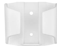
WALL MOUNT HOLDER

Image: All items included in the product package.