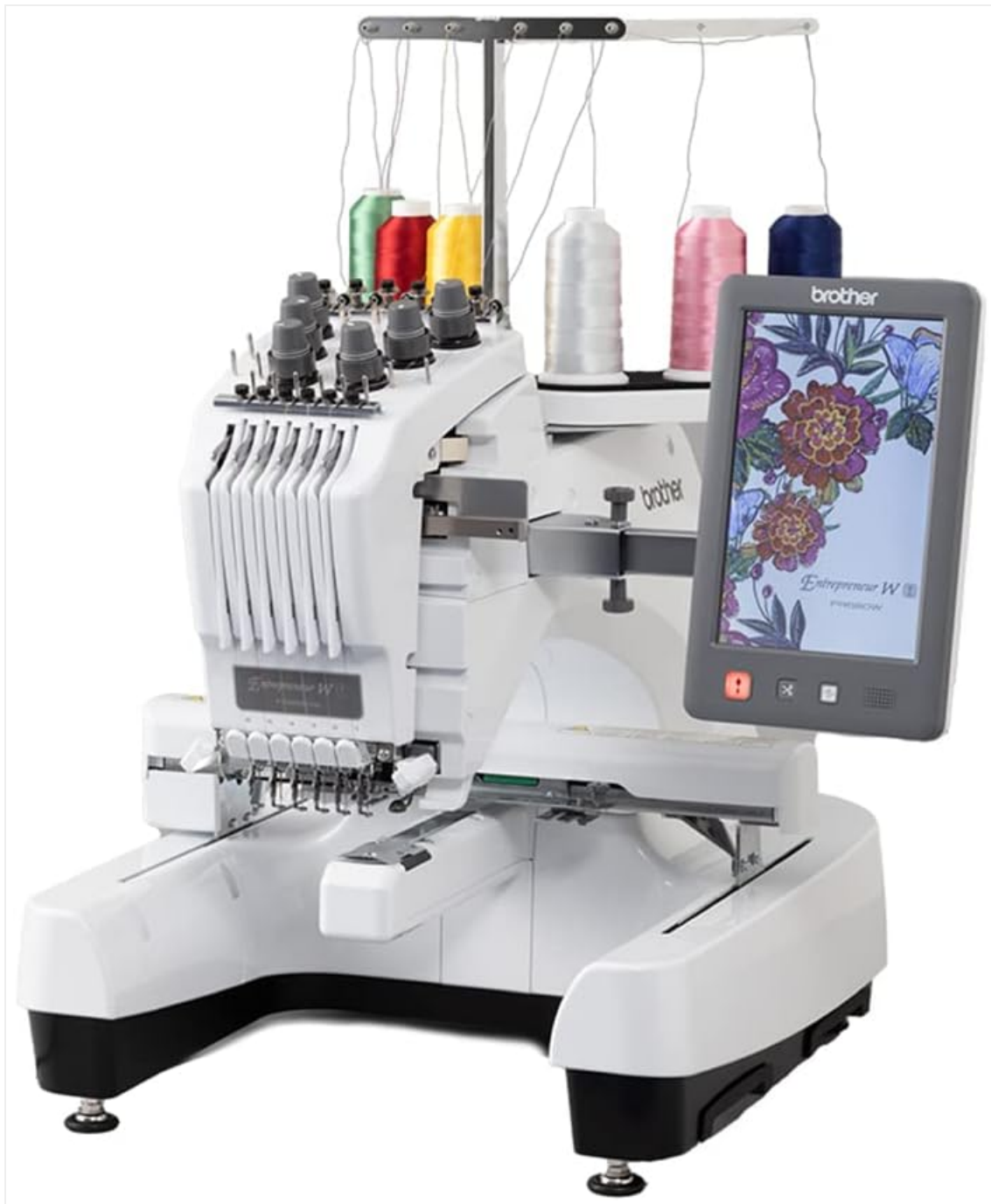
Figure 1: Brother Entrepreneur PR680W Multi-Needle Embroidery Machine.