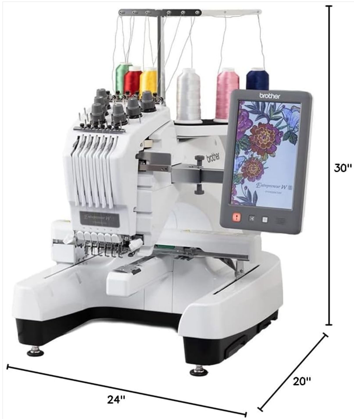
Figure 2: Approximate dimensions of the Brother Entrepreneur PR680W.