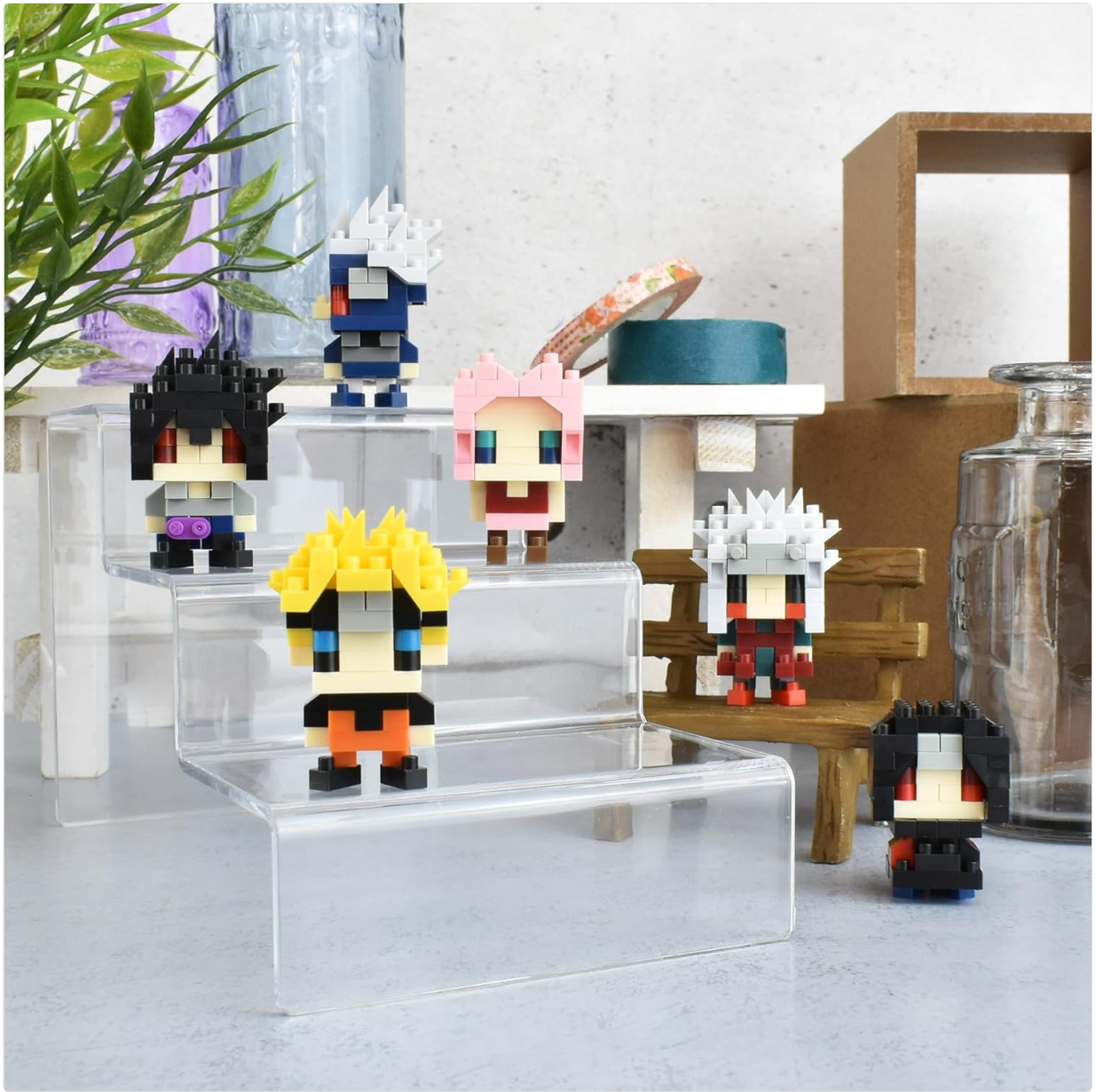
A collection of Nanoblock mininano Naruto Shippuden characters, including Naruto, Sakura, Sasuke, Kakashi, Itachi, and Jiraiya, arranged on a display.