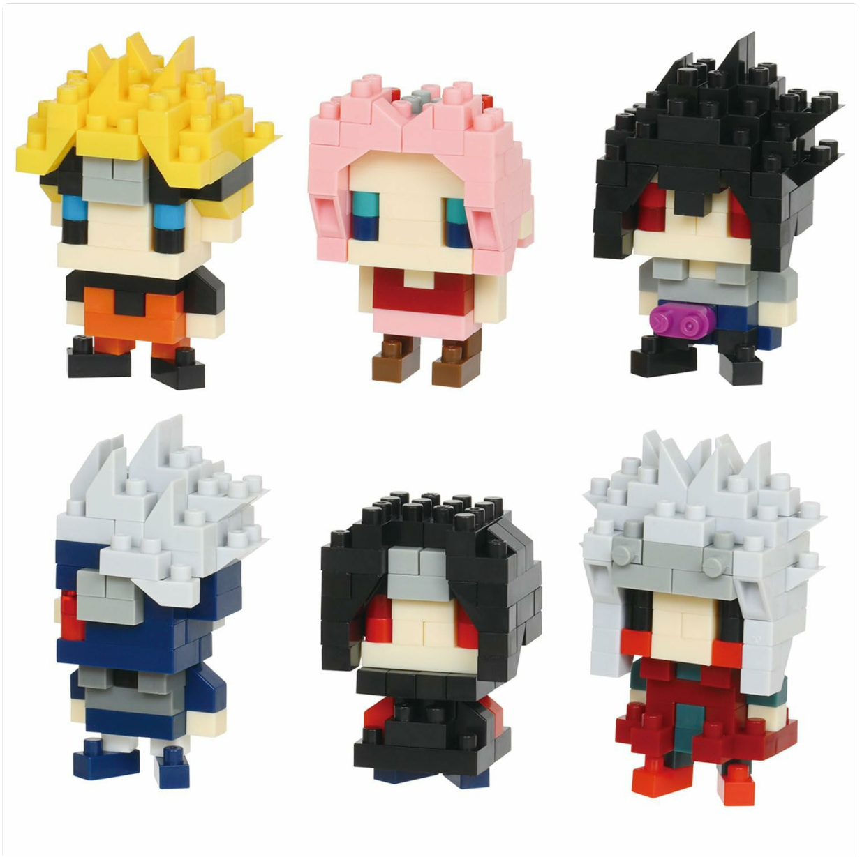
Figure of Naruto from the mininano series, showcasing its compact size when held in a hand.