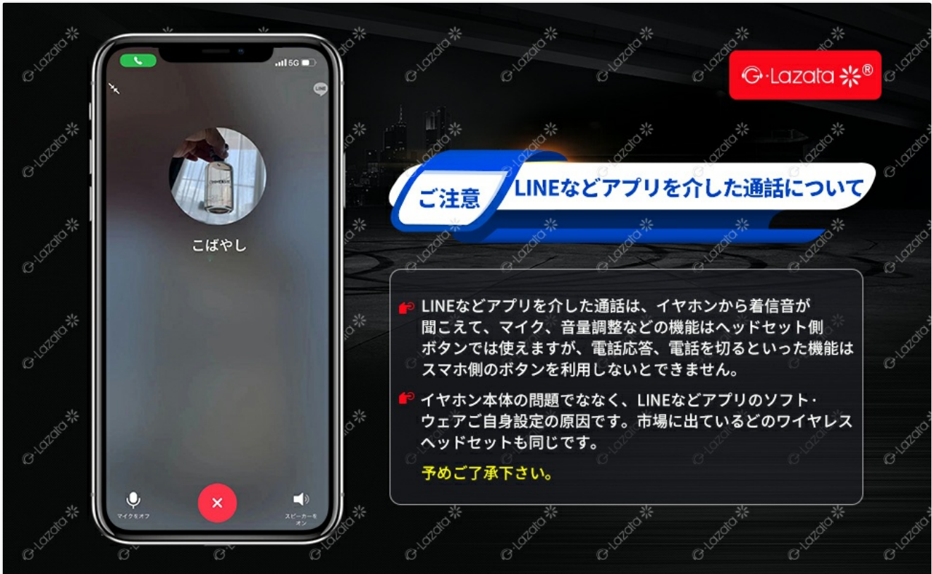
Image 7.3: Notes on calls using the LINE app. This image displays a smartphone screen during a LINE call and provides important information regarding headset functionality with the LINE application.