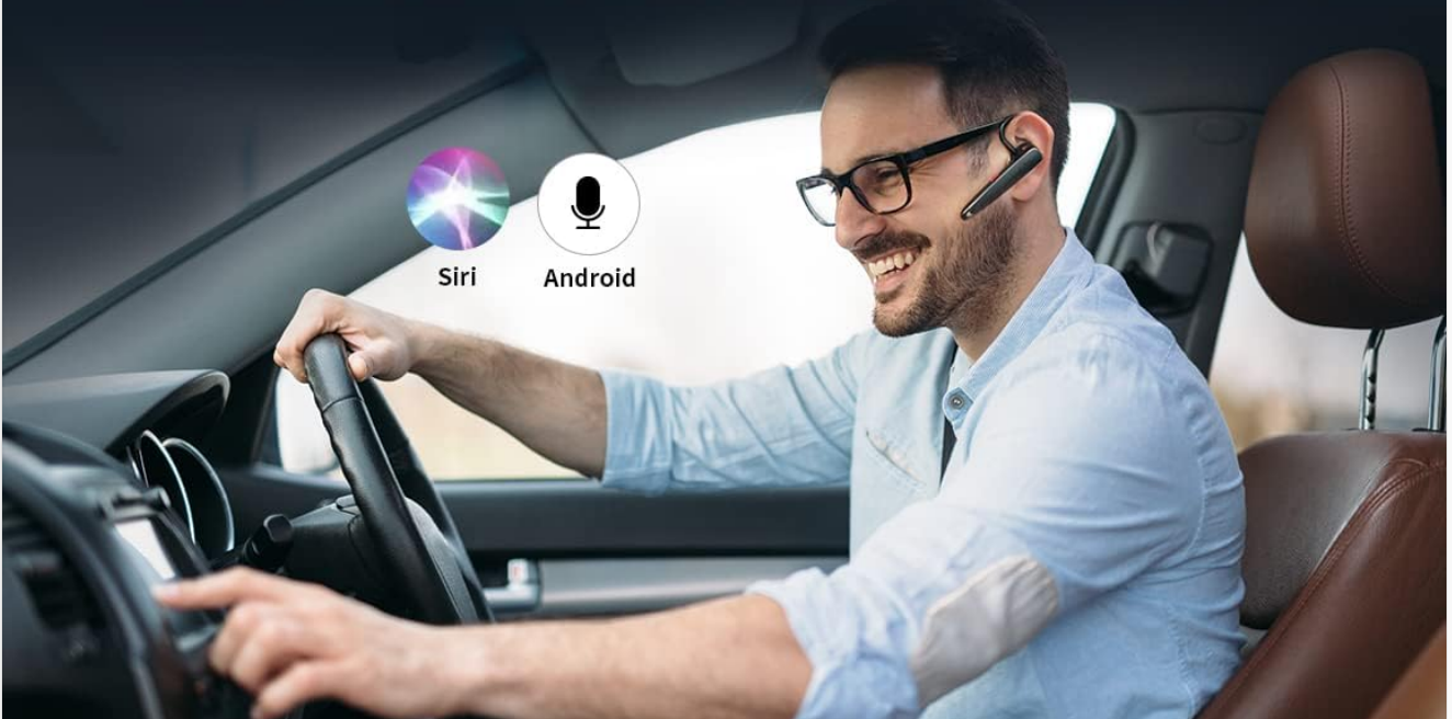
Image 5.1: Mute function in use. This image depicts individuals using the headset, demonstrating the mute button's functionality during a call.

待機中にマルチ・ボタン（着信時に受話のために押すボタン）を3秒（反応があるまで）長押し、手を離すと、siriが起動します。