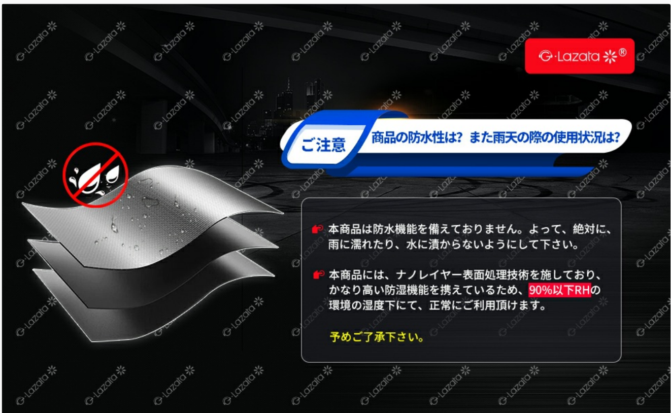
Image 6.1: Water resistance warning. This image shows a crossed-out water droplet icon, indicating that the product is not fully waterproof.

This product is not fully waterproof. Avoid using it in heavy rain or submerging it in water for extended periods. While it features nanolayer surface treatment technology for a certain level of moisture protection, it is designed for normal use under conditions of 90% RH or less. Always remove the headset before washing clothes or pants to prevent damage.