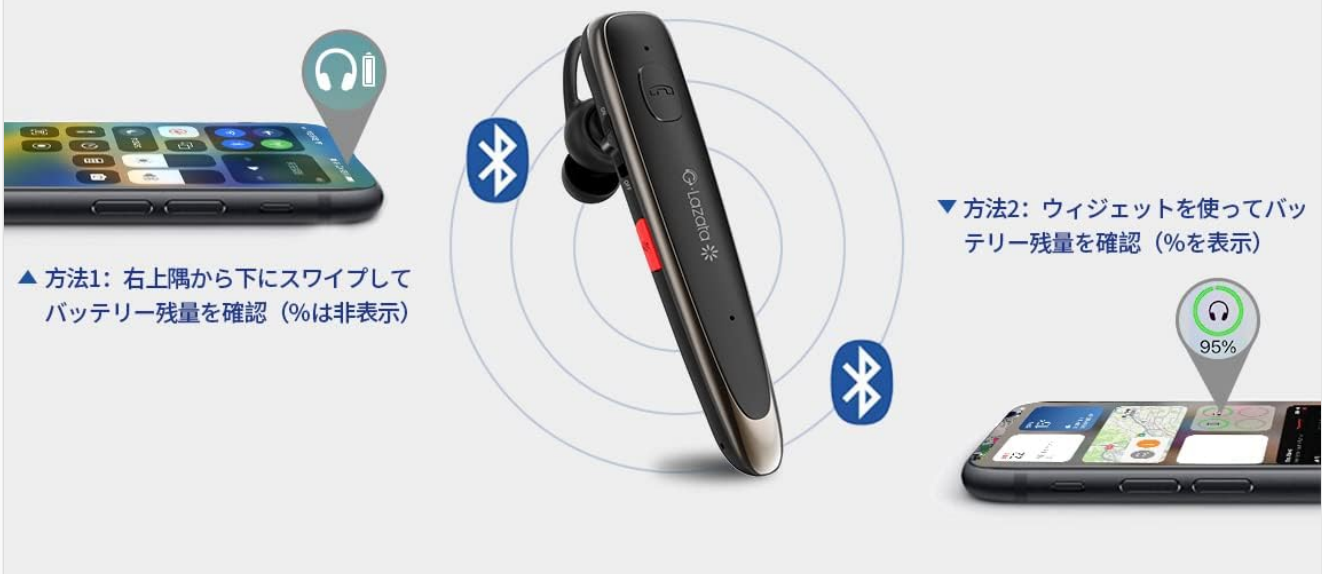
Image 4.2: Automatic pairing process. This image shows a smartphone's Bluetooth settings screen displaying the EC300N as a discoverable device, and the headset wirelessly connected.

iPhone, iPadなどiOSデバイスでは、バッテリー残量を右上隅から下にスワイプする方法又はウィジェットを使う方法これら2通りの方法により表示され、そこからいつでも電池残量を確認することができ、バッテリー不足の心配不要 【注: Android一部機種がAndroidシステム設定原因により、表示がされないかもしれません】