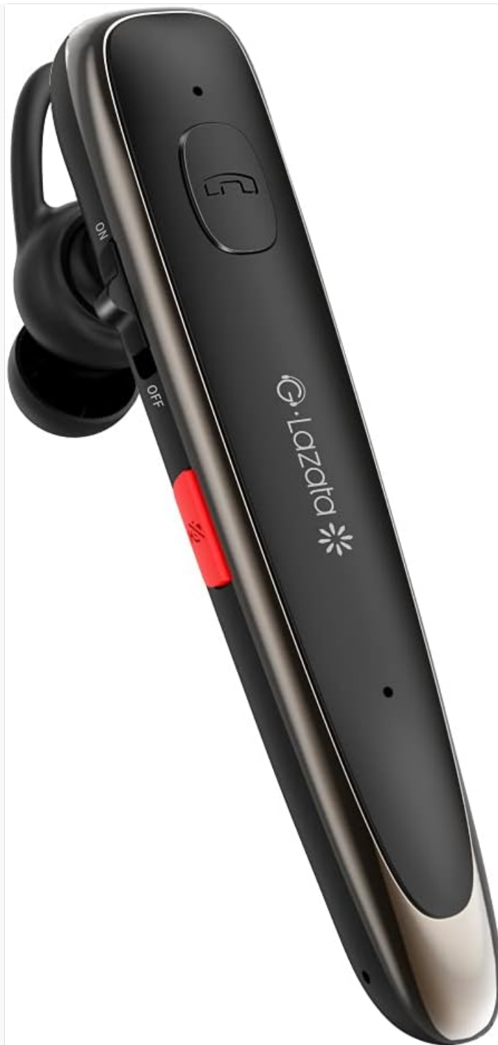
Image 3.1: Glazata EC300N Wireless Bluetooth Headset. This image shows the sleek black design of the headset with its ear hook and control buttons.