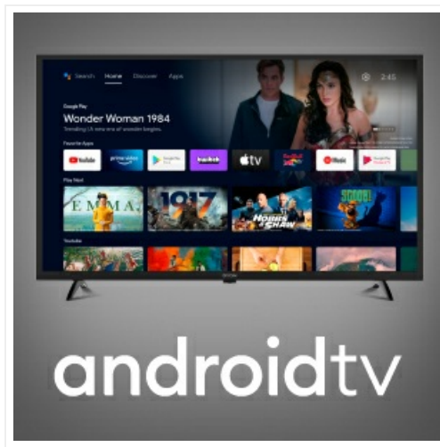
Image 3.3: The DYON Smart 43 AD-2 TV screen showing the Android TV interface with various app icons.