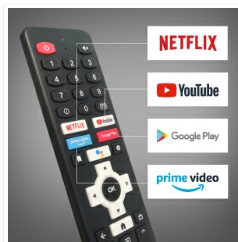
Image 3.2: Close-up of the remote control, highlighting the dedicated quick access buttons for Netflix, YouTube, Google Play, and Prime Video.