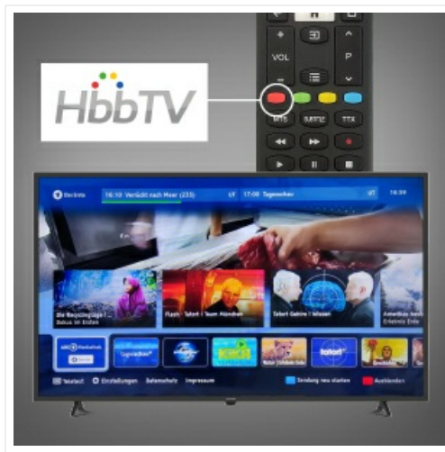
Image 3.6: The DYON Smart 43 AD-2 TV screen showing an HbbTV interface, which integrates broadcast television with internet-delivered content.