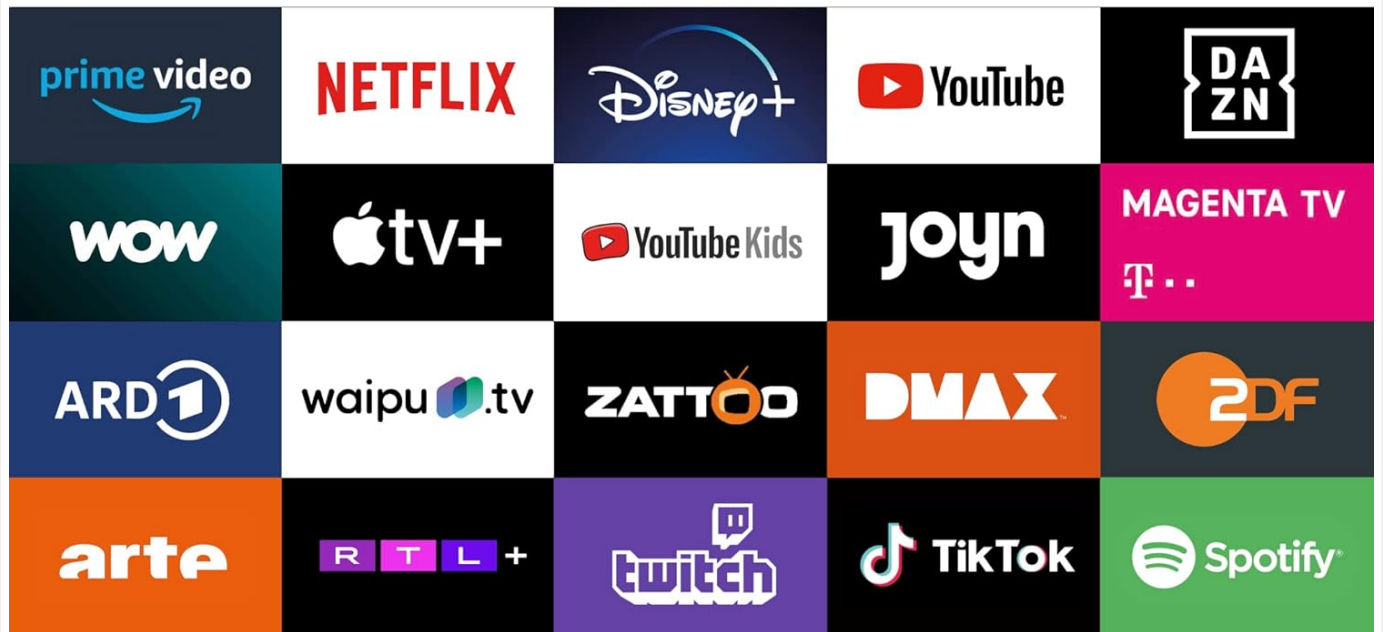
Image 3.5: A graphic illustrating the Google Play ecosystem, emphasizing the availability of numerous entertainment applications.