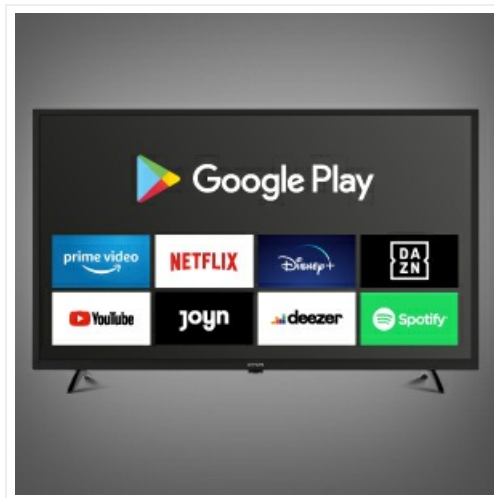
Image 3.4: The DYON Smart 43 AD-2 TV screen showcasing the Google Play Store interface with a selection of available applications.