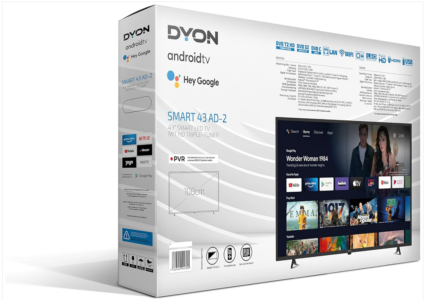
Image 2.1: The product packaging for the DYON Smart 43 AD-2, highlighting key features like Android TV, triple tuner, and PVR function.