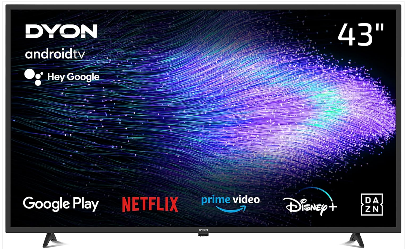
Image 1.1: The DYON Smart 43 AD-2 Android TV, featuring a 43-inch display and integrated Android TV interface with popular streaming service logos.

This manual provides essential information for the setup, operation, and maintenance of your DYON Smart 43 AD-2 Android TV. Please read it thoroughly before using the device to ensure proper functionality and safety.