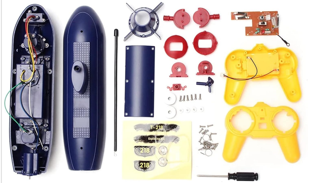
Figure 2: Package Contents