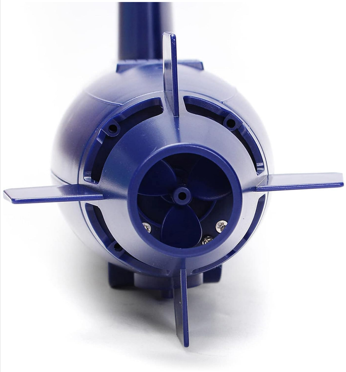
Figure 3: Submarine Components and Functions