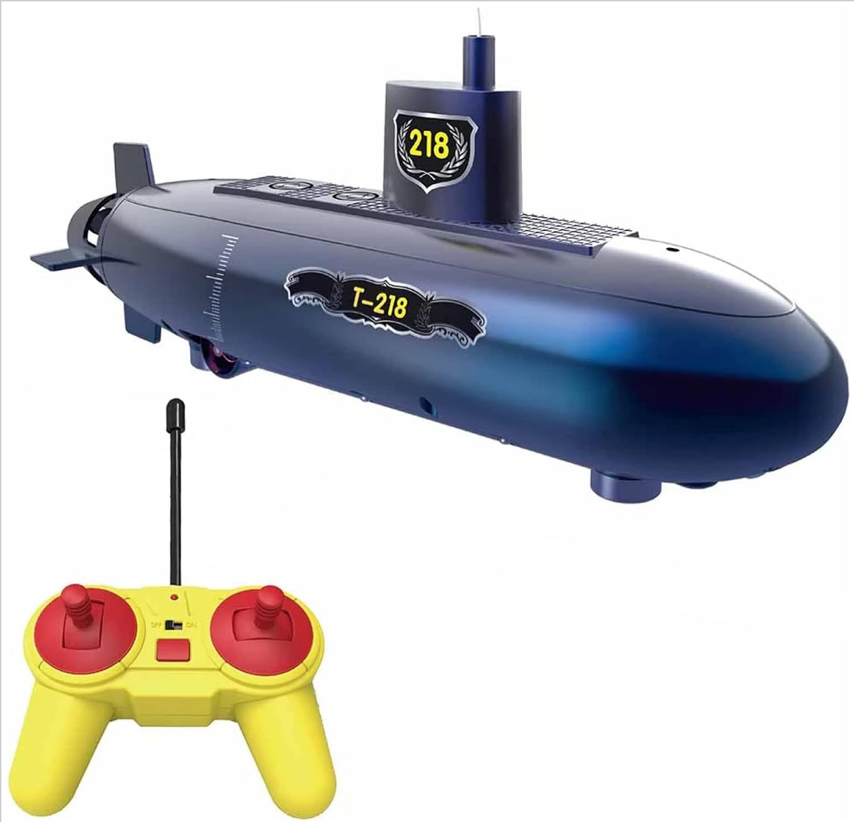
Figure 1: GoolRC Mini RC Submarine and Remote Controller