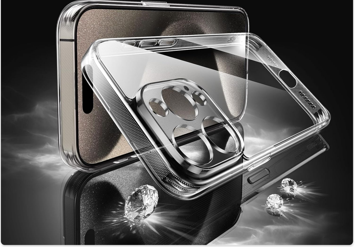
Image 3.1: Demonstrates the process of installing the clear case onto the iPhone, highlighting its flexible nature for easy application.