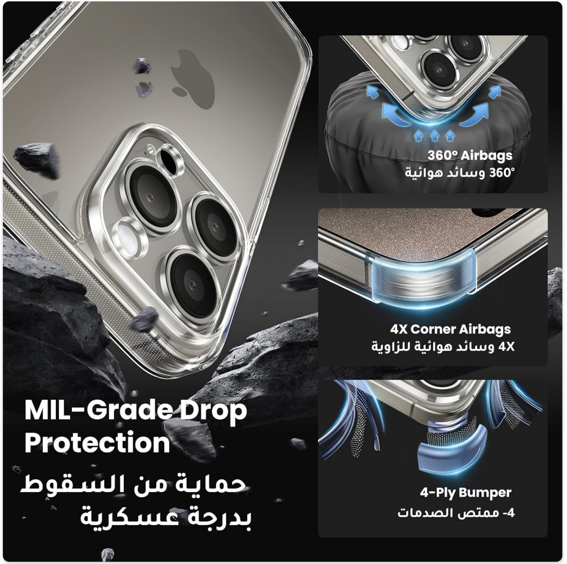
Image 2.2: Visual representation of the MIL-Grade drop protection, highlighting the 360° airbags and 4-ply bumper design for impact absorption.