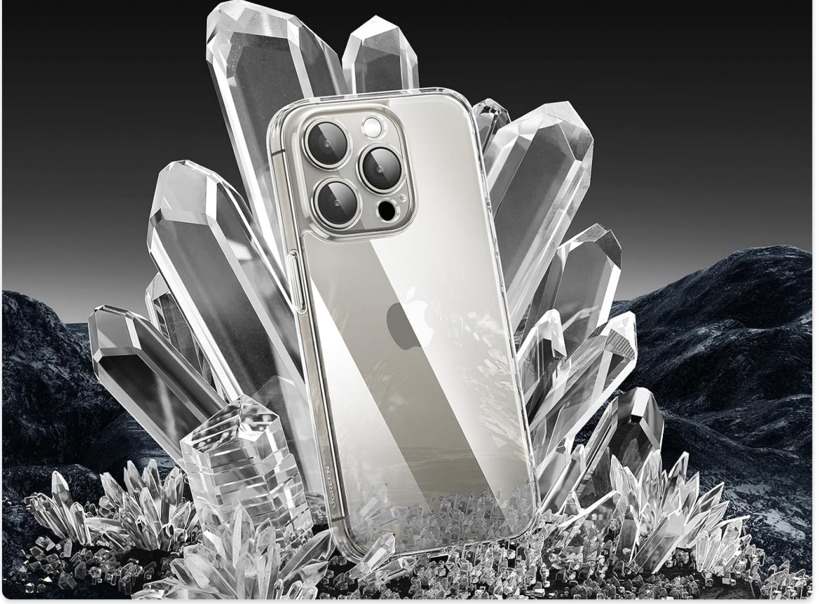
Image 2.1: Illustration of the case's anti-yellowing properties and crystal-clear material, designed to maintain transparency over time.

The Bayer material back keeps the original color تحافظ مادة باير الخلفية على اللون الأصلي