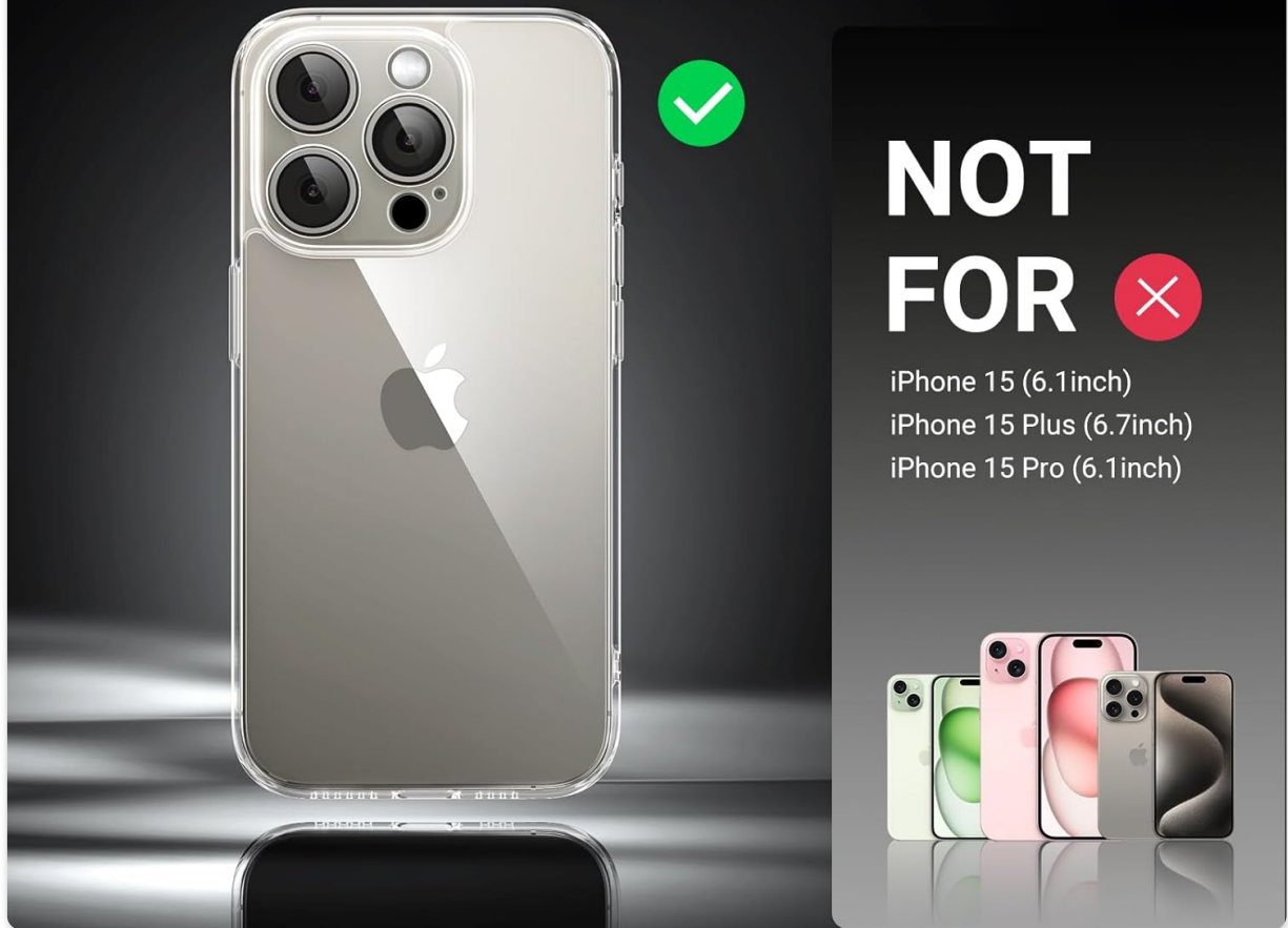
Image 3.2: A clear visual indicating that the case is exclusively for the iPhone 15 Pro Max (6.7 inch) and not for other iPhone 15 models.