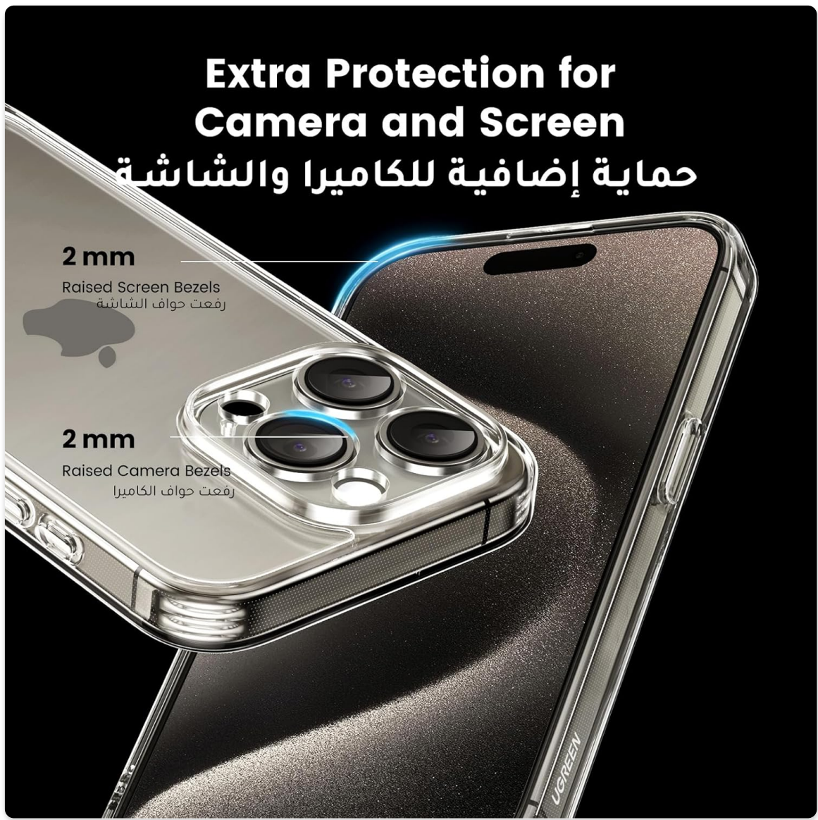
Image 2.4: Close-up view illustrating the 2mm raised bezels designed to protect the iPhone's screen and camera from scratches.