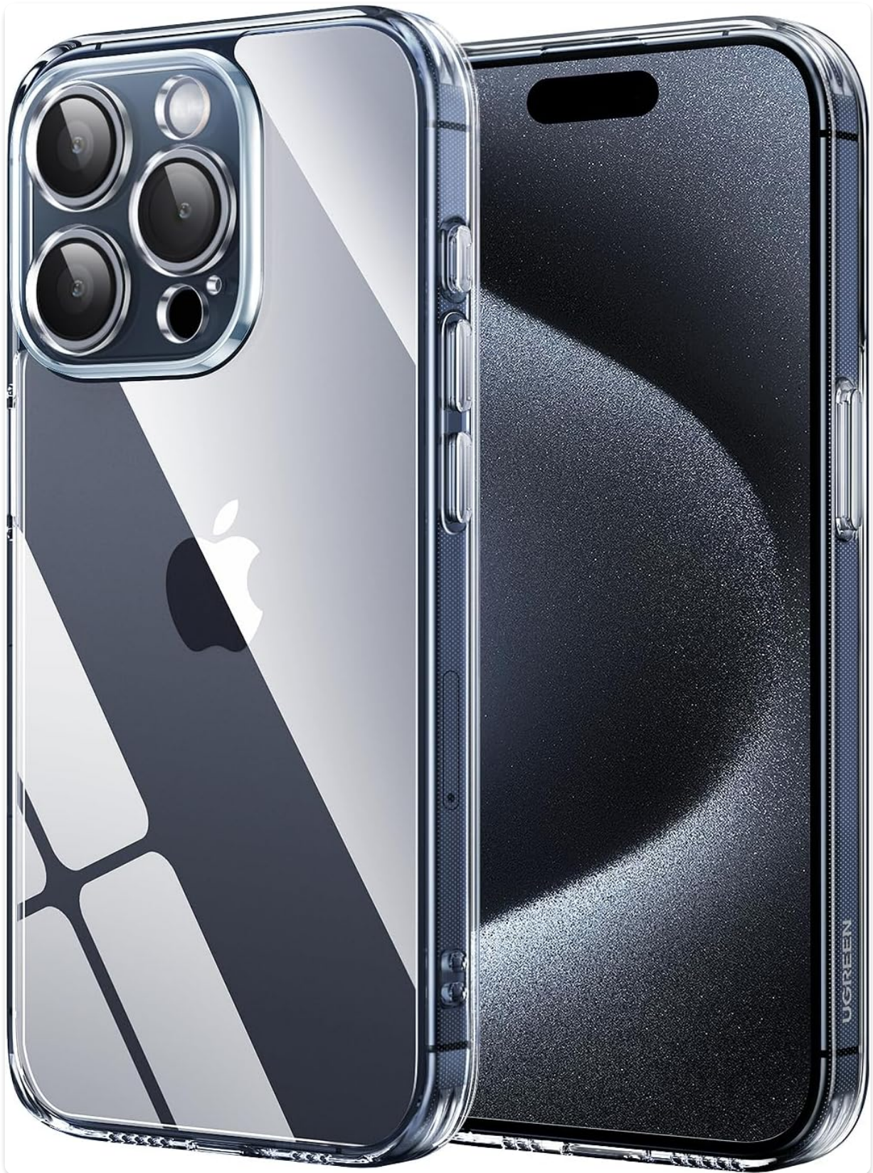
Image 1.1: The UGREEN Clear Case for iPhone 15 Pro Max, showcasing its transparent design and precise fit.