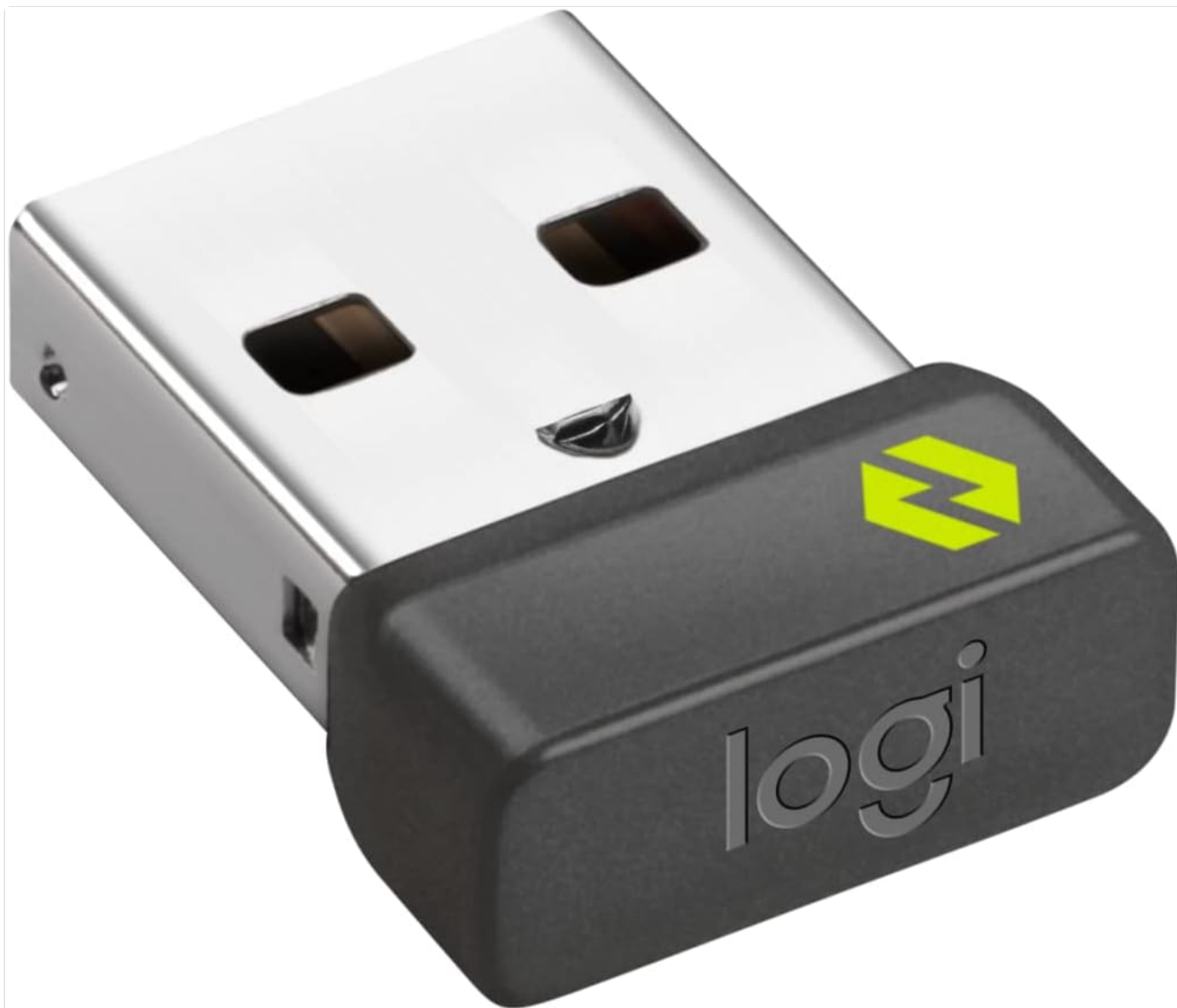
Image: The Logi Bolt USB Receiver, a small black USB dongle with a green lightning bolt logo.