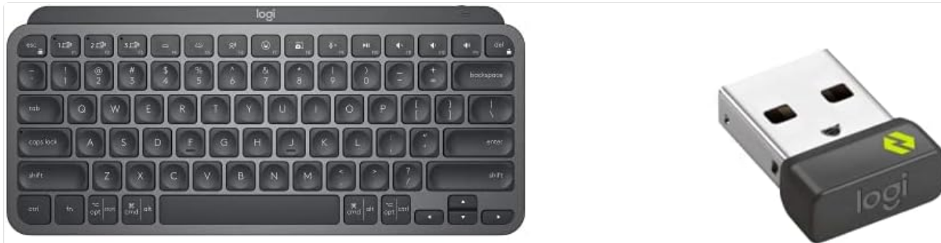
Image: Logitech MX Keys Mini Keyboard (left) and Logi Bolt USB Receiver (right).

This manual provides comprehensive instructions for setting up, operating, maintaining, and troubleshooting your Logitech MX Keys Mini Minimalist Wireless Illuminated Keyboard and the accompanying Logi Bolt USB Receiver. Please read this manual carefully to ensure optimal performance and longevity of your devices.