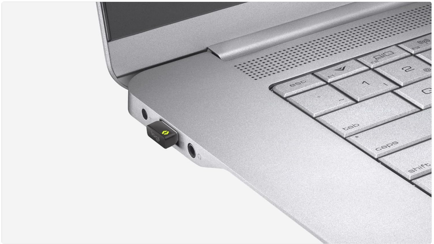
Image: The Logi Bolt USB Receiver discreetly plugged into the side USB port of a silver laptop.