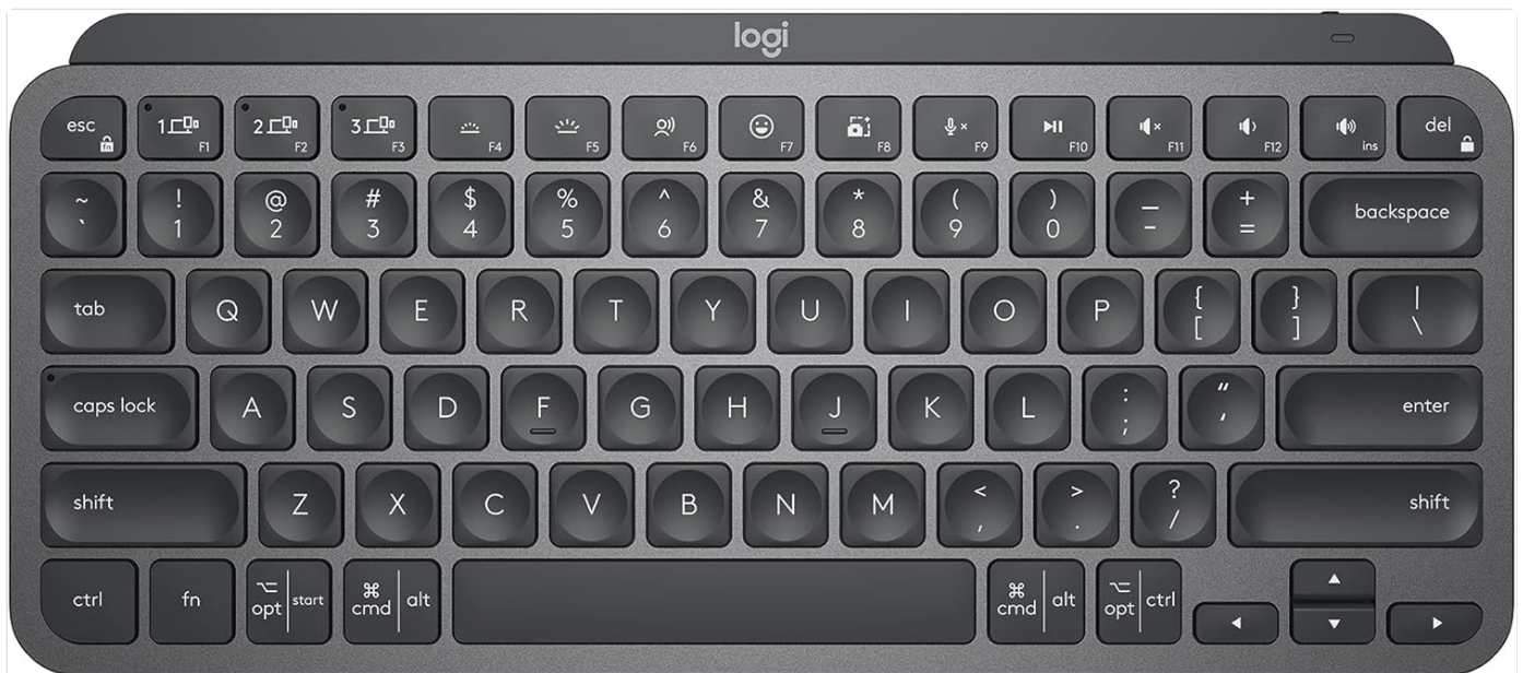
Image: Top-down view of the Logitech MX Keys Mini keyboard, showing its compact layout and function keys.