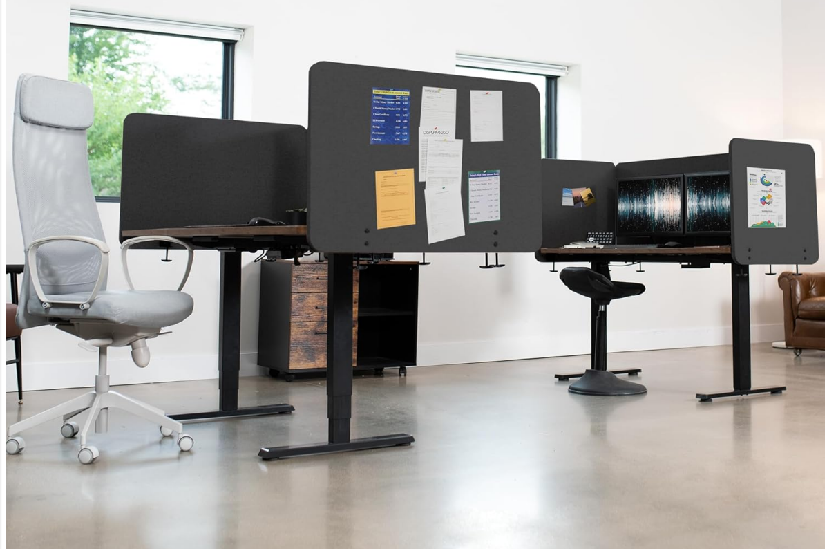
Image: The tackable surface of the privacy panel, shown with notes pinned for workspace customization.