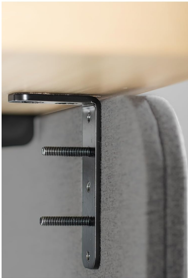
SECURED TO DESKTOP WITH INCLUDED HARDWARE