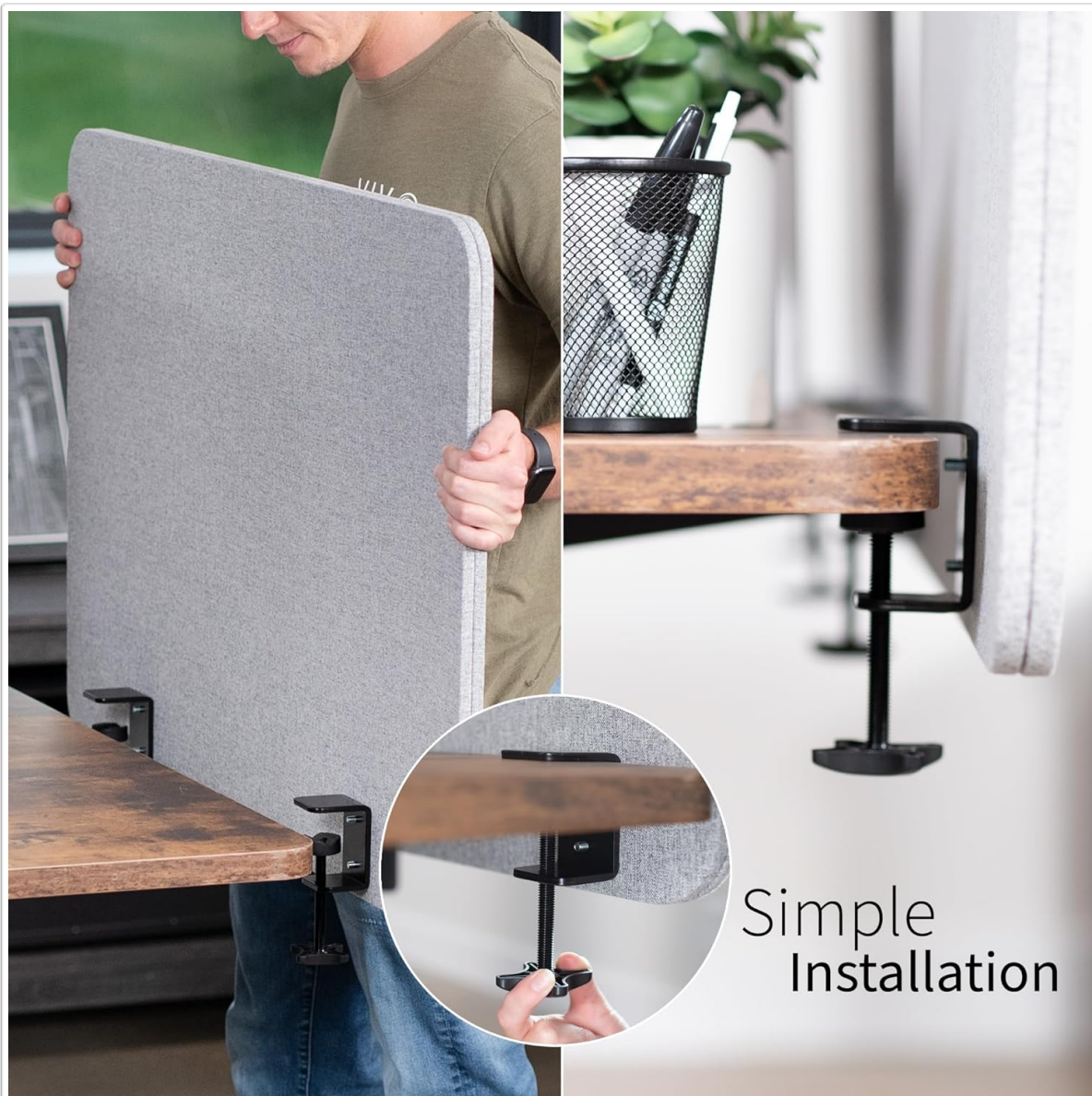
Image: A hand tightening the clamp for simple installation of the privacy panel onto a desk.