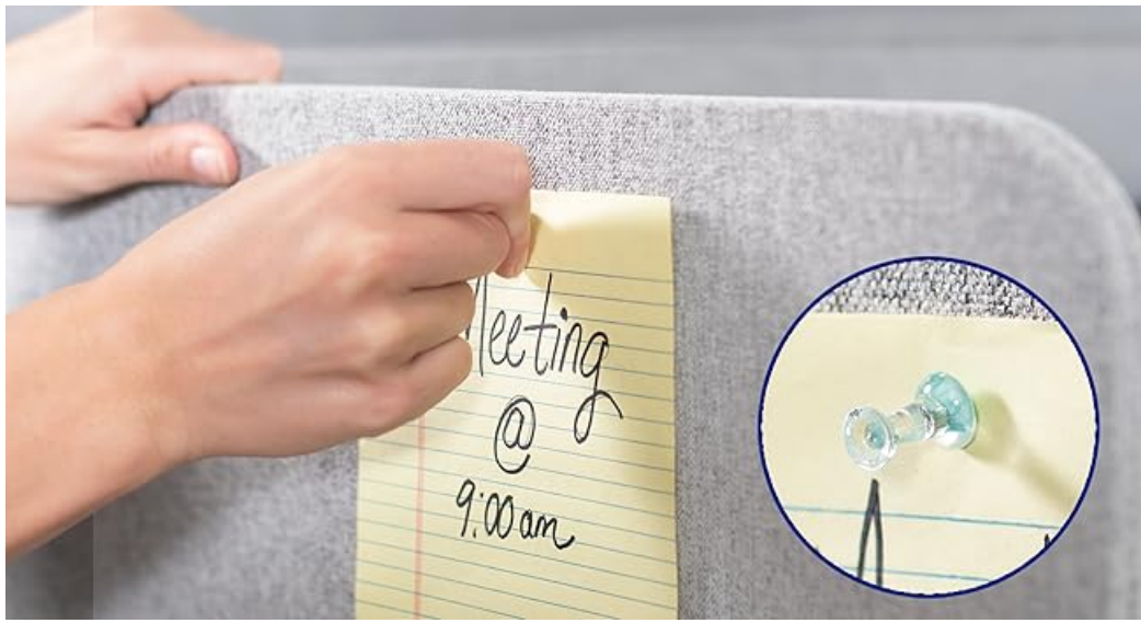
Image: A close-up view of a hand pinning a note to the tackable surface of the privacy panel.