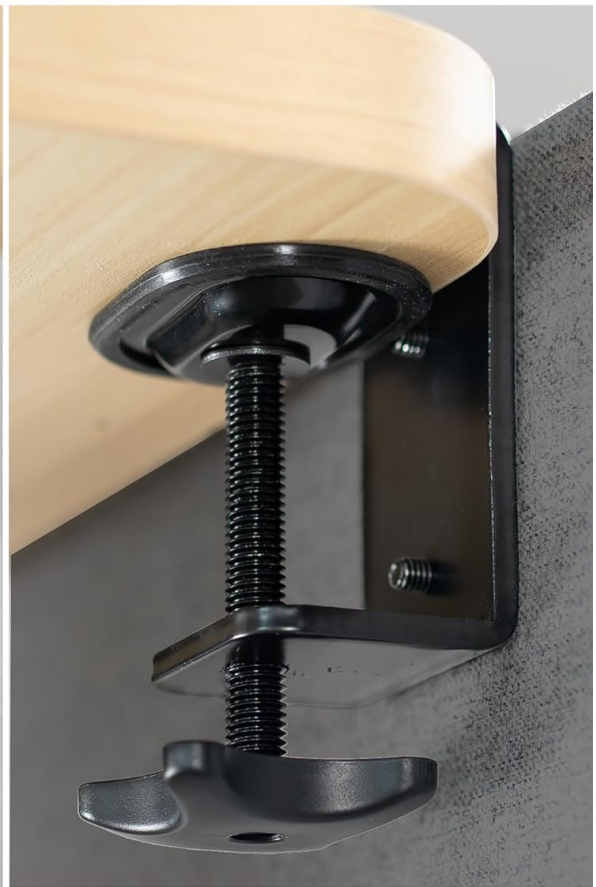
TOOL-FREE CLAMP ON INSTALLATION

Image: Two installation options for the VIVO privacy panel: screw-in (left) and clamp-on (right).