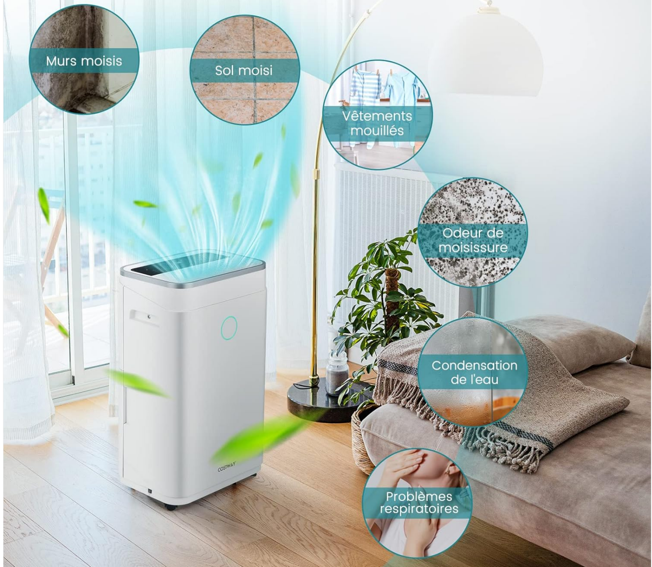
Image: A visual representation of the dehumidifier's benefits, including preventing mold on walls and floors, drying clothes, eliminating musty odors, and improving respiratory comfort.

Créer un environnement confortable et sain