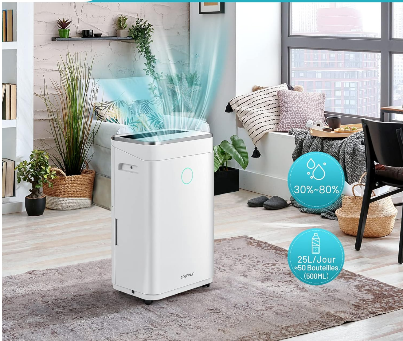
Image: The COSTWAY 25L/Day Dehumidifier operating in a living room, demonstrating its high efficiency in covering up to 50m 2 .

Déshumidificateur avec Haute Efficacité Zone de couverture : 30 m 2