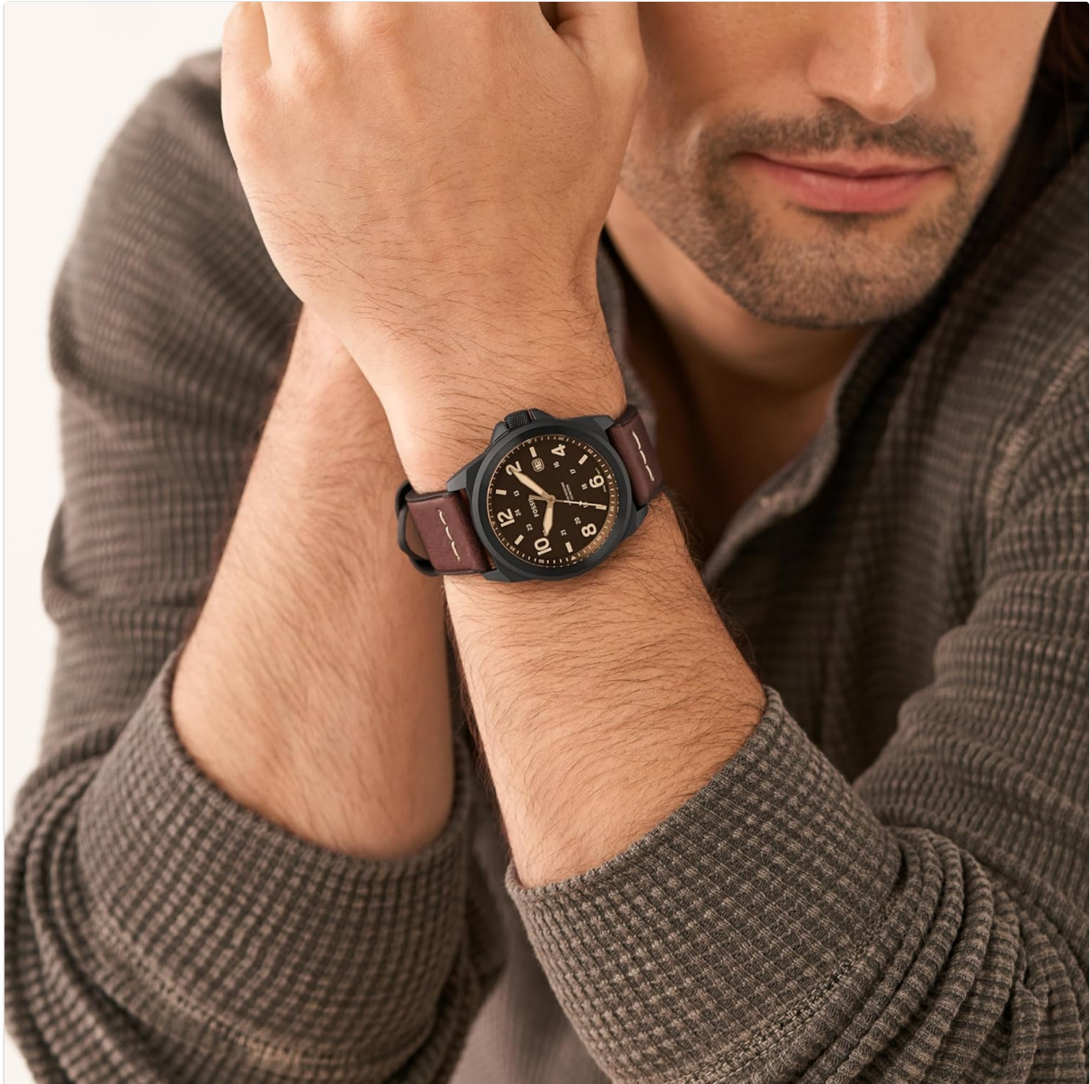
The Fossil Bronson watch displayed on a wrist, illustrating its fit and appearance during wear.

While designed with a chronograph aesthetic, this specific model features a three-hand date movement. The outer ring (bezel) is fixed and does not rotate for timing purposes. The sub-dials are decorative and do not provide additional timing functions.