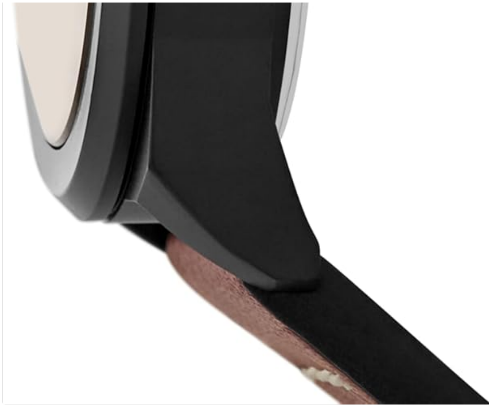
Side profile of the watch case, displaying the crown used for setting time and date.