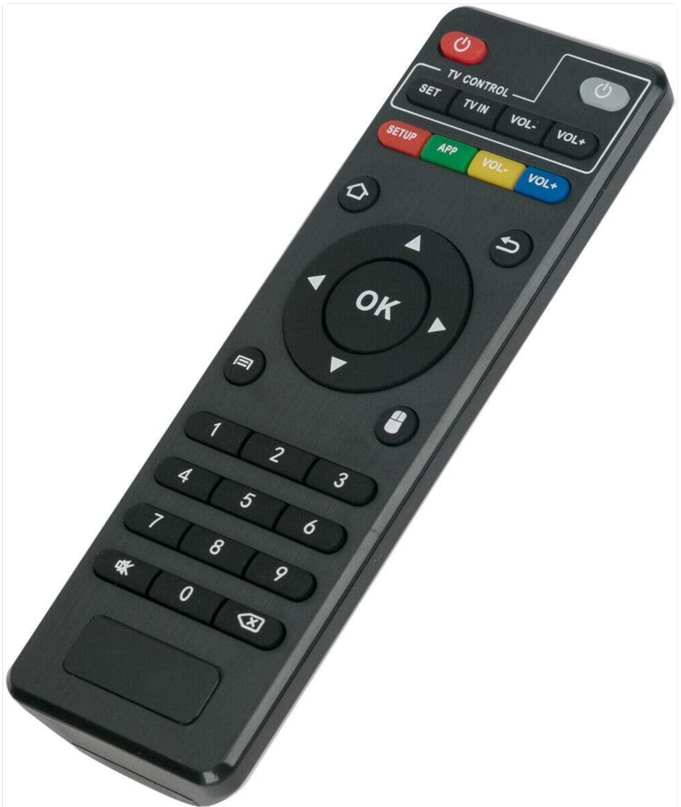
Figure 5.2: An angled perspective of the remote control, showing its ergonomic shape and the arrangement of its various function buttons.