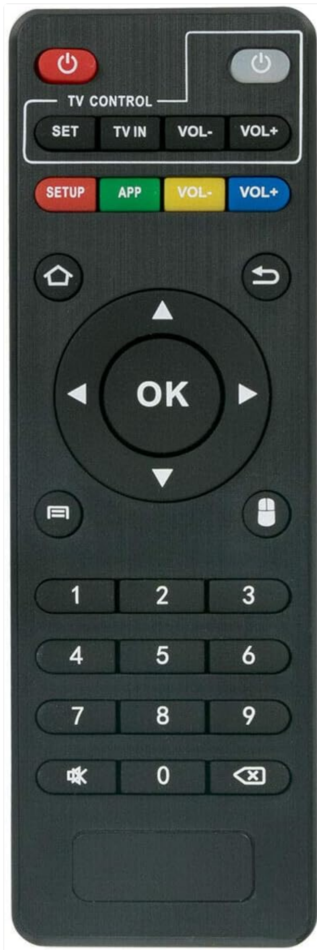
Figure 5.1: This image displays the front of the remote control, highlighting its button layout including power, volume, navigation, and numeric keys. The design is sleek and black.