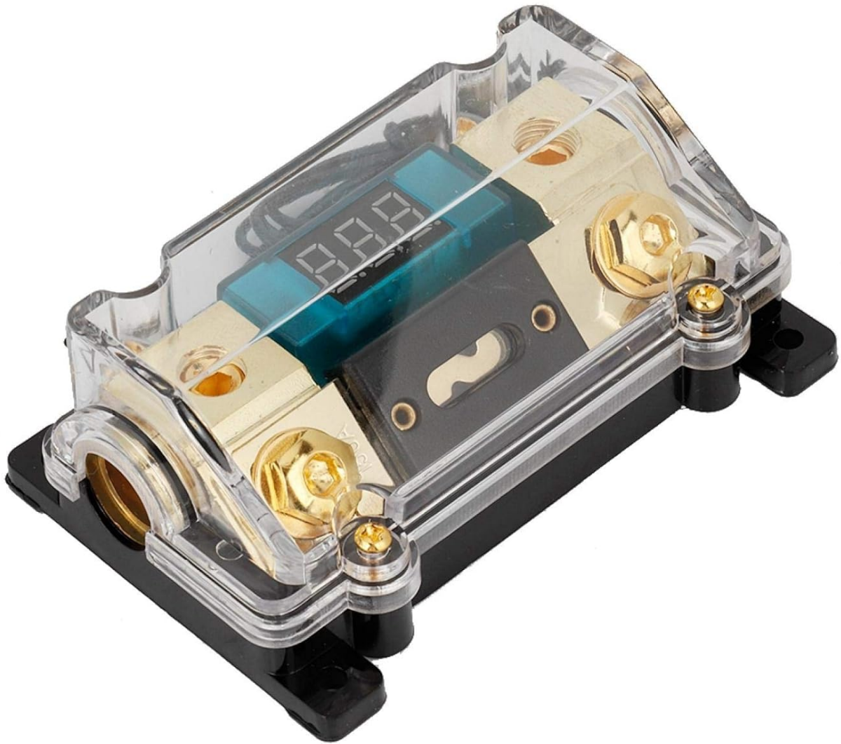
Figure 2: Key features of the fuse holder, highlighting its durable construction and suitability for various vehicle types.