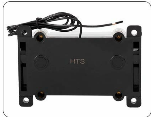
Figure 3: Detailed view of the fuse holder's terminals, showing where power cables are connected.