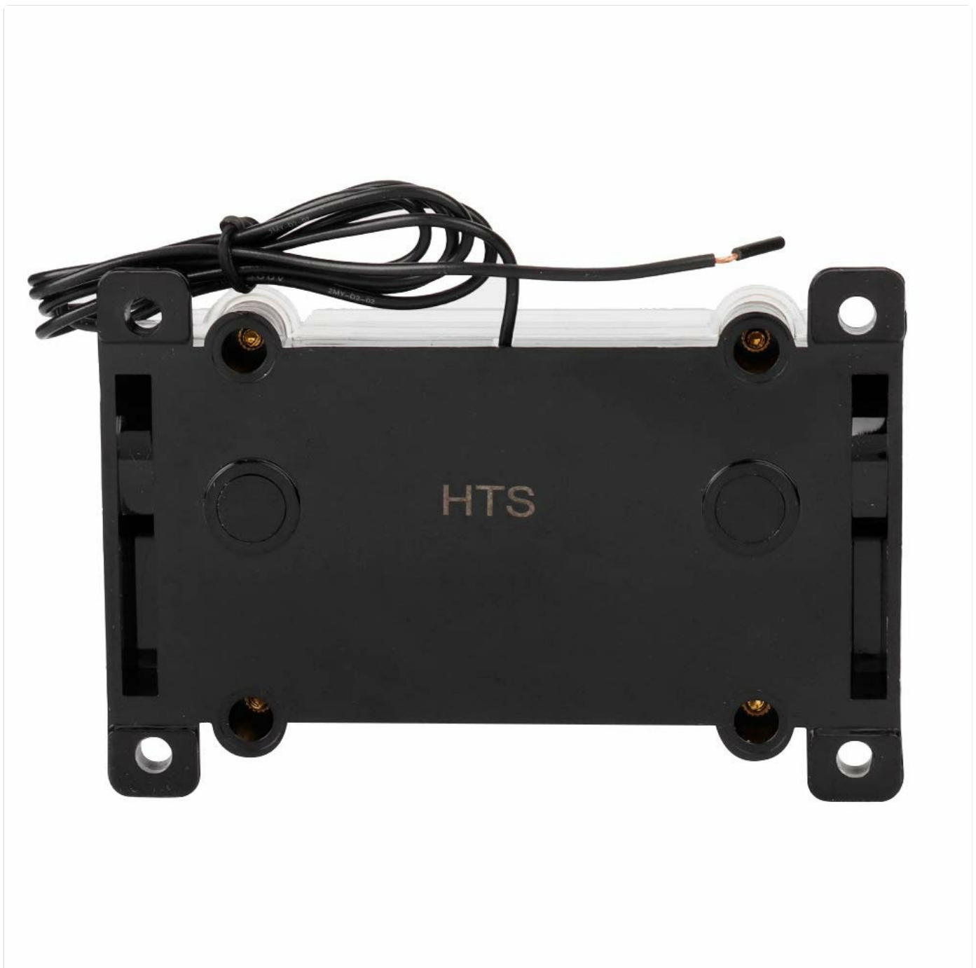
Figure 4: Underside of the fuse holder, illustrating the mounting points for secure installation.