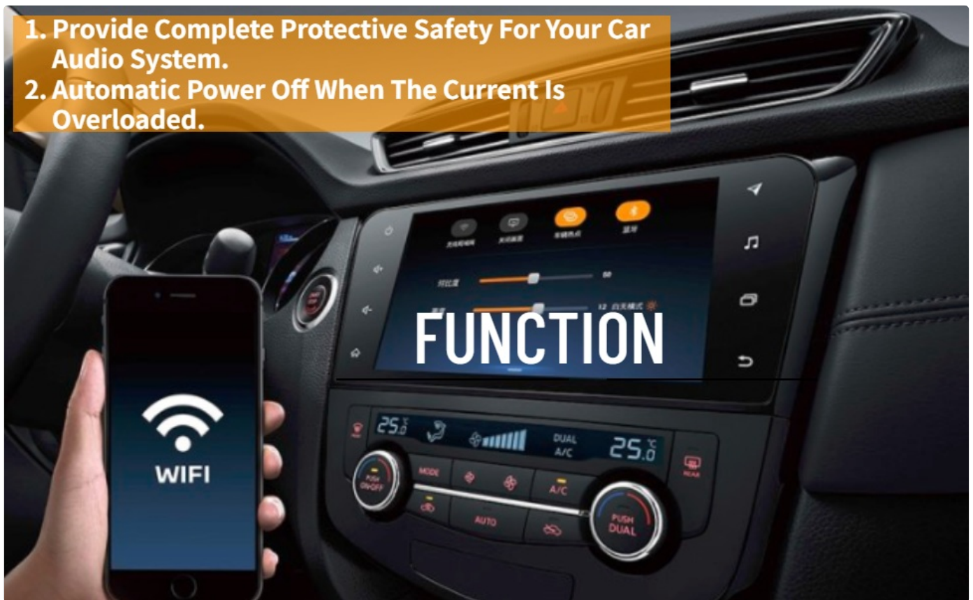
Figure 5: Illustration of the fuse holder's protective function within a car audio system, emphasizing safety and automatic power cut-off.