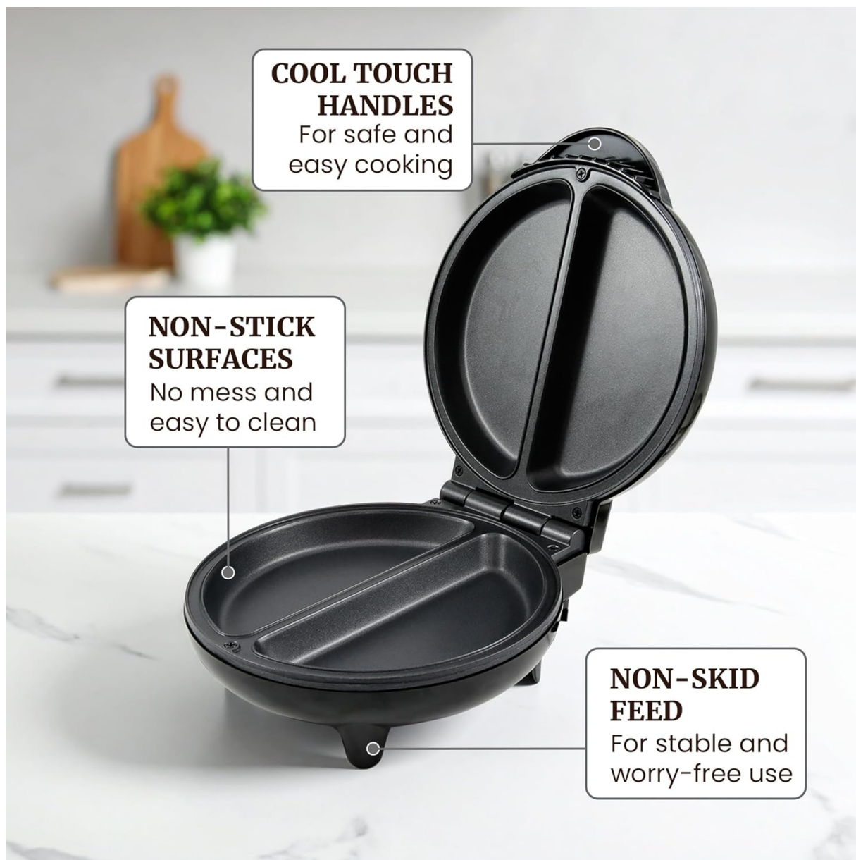
Image: The omelet maker open, showcasing its non-stick cooking surfaces, cool touch handles, and non-skid feet for stable use.

3. Close the lid and plug the appliance into a standard electrical outlet.