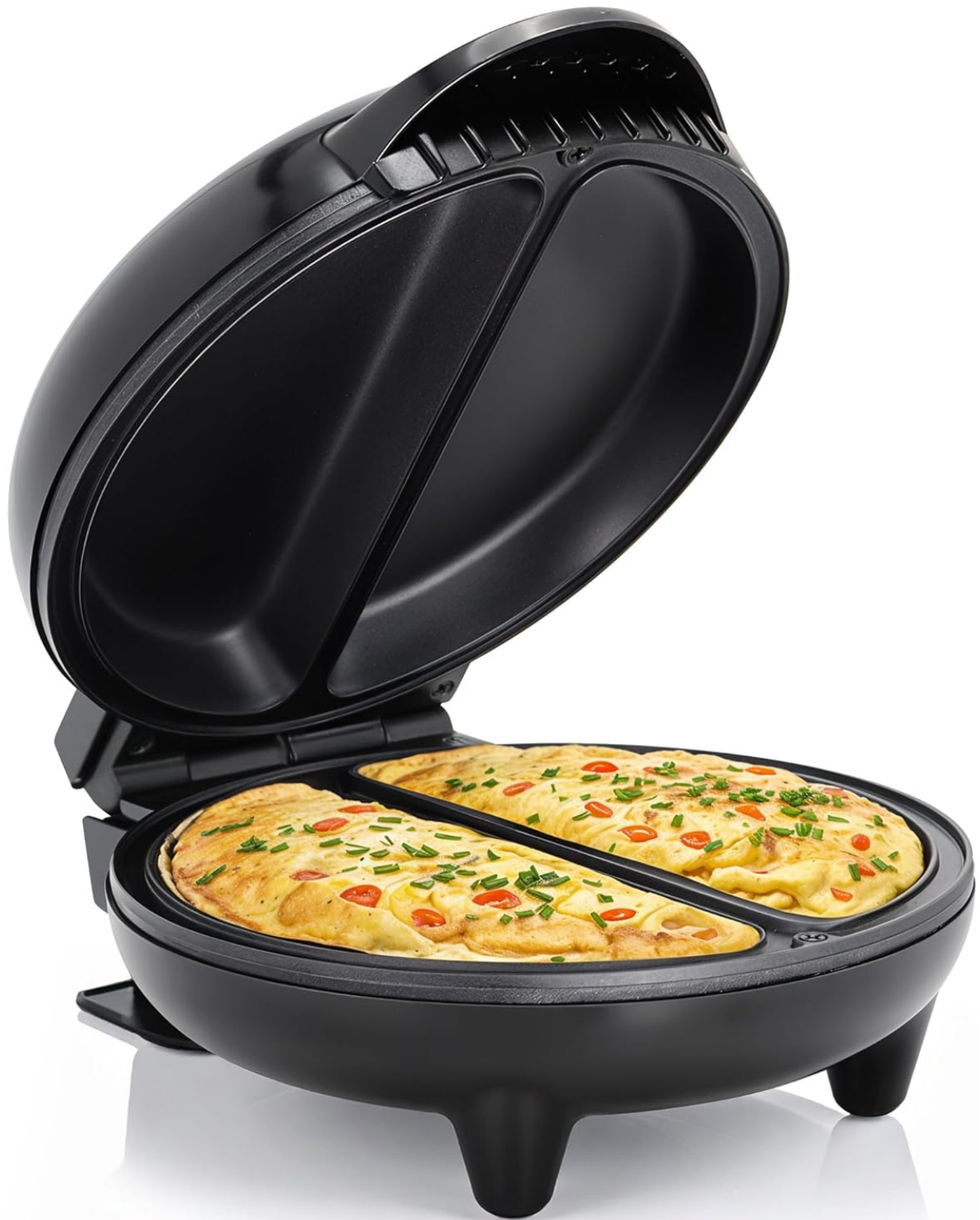
Image: The Elite Gourmet Omelet Maker with two perfectly cooked omelets, ready to serve.