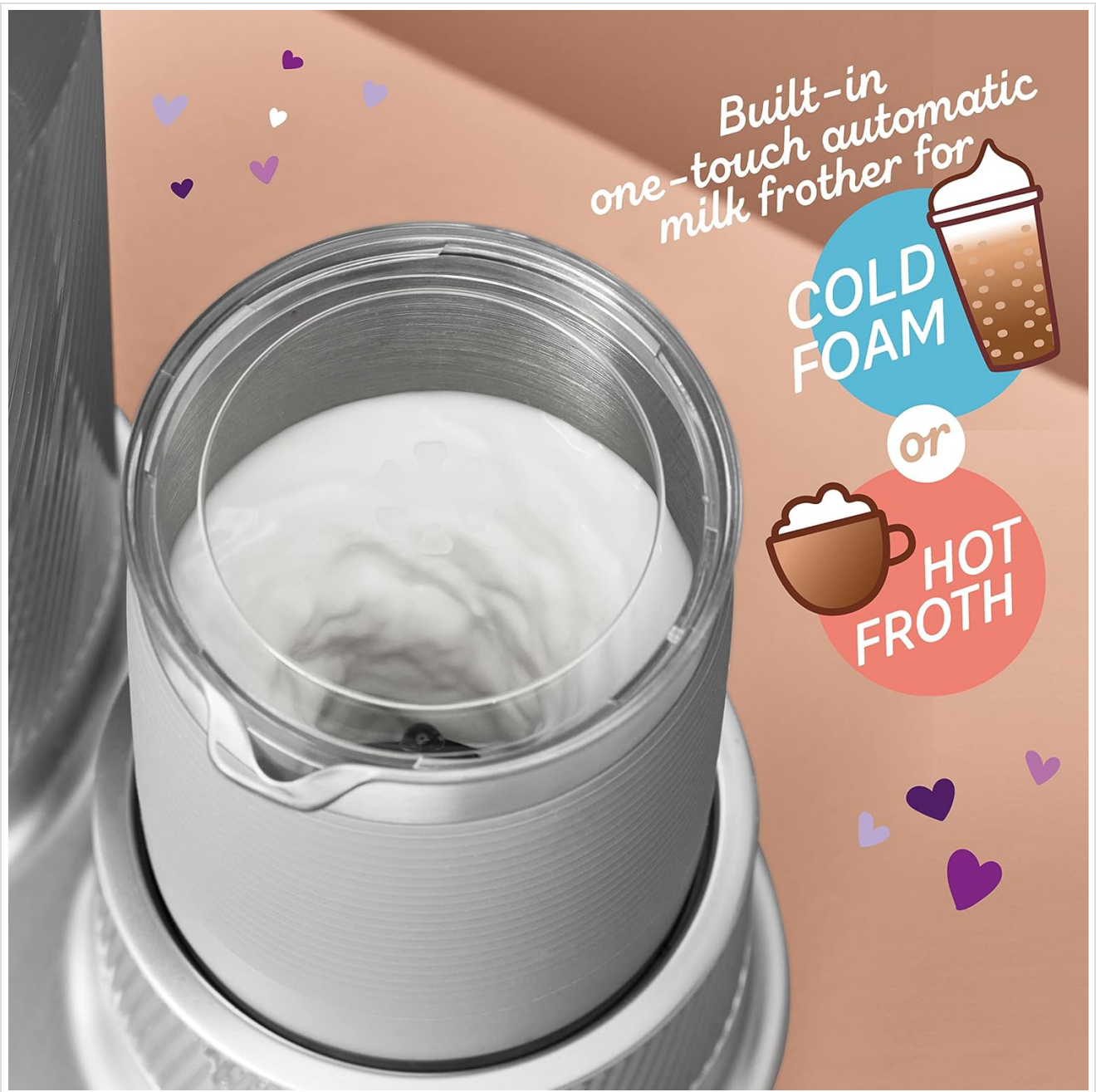
Image: A close-up of the automatic milk frother in action, creating white foam. Text indicates options for 'COLD FOAM' or 'HOT FROTH'.