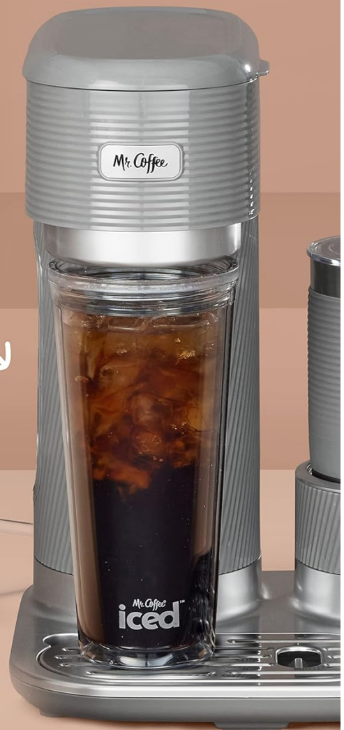
Image: A close-up of the Mr. Coffee 4-in-1 Latte Lux Coffee Maker showing the included accessories: a reusable filter, a dual-sided coffee scoop, and a 22-oz. reusable tumbler with lid and straw.