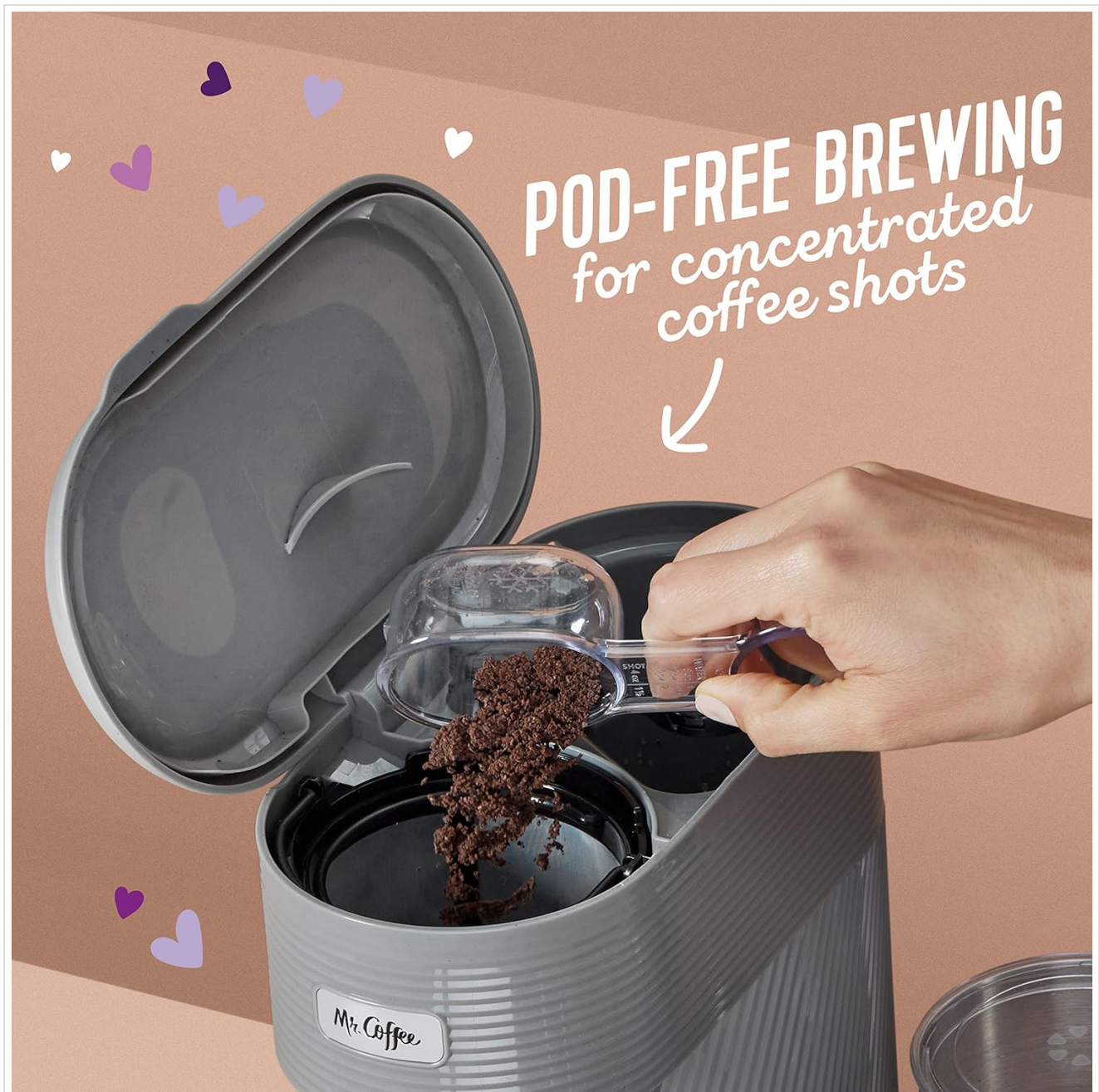
Image: A hand is shown scooping coffee grounds into the reusable filter of the Mr. Coffee 4-in-1 Latte Lux Coffee Maker, illustrating the pod-free brewing process.