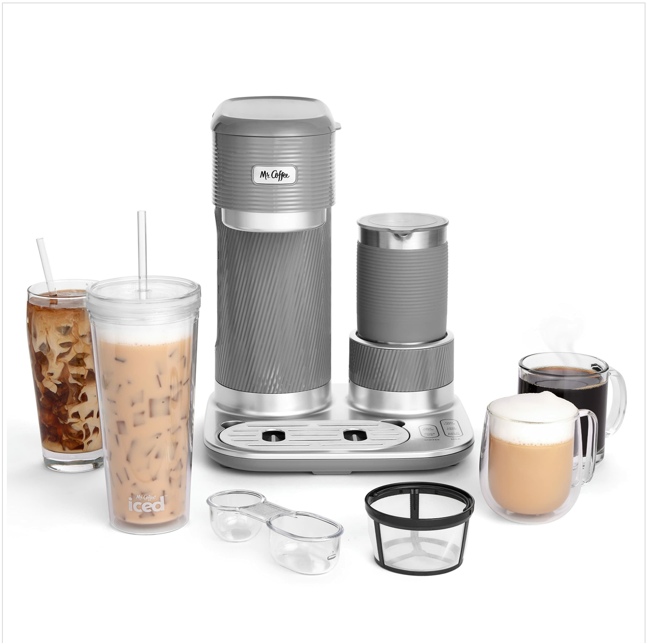
Image: The Mr. Coffee 4-in-1 Latte Lux Coffee Maker in grey, shown with different coffee beverages including iced coffee in a tumbler, a latte with foam, and a hot black coffee. A circular graphic highlights its 4-in-1 functionality for lattes, cappuccinos, iced, and hot drinks.