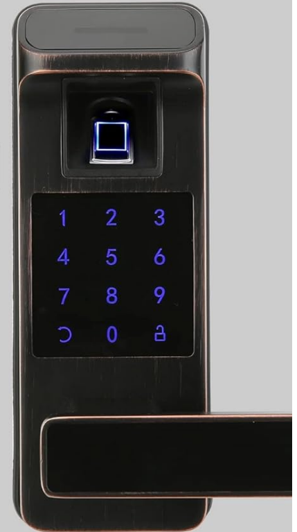
Figure 10: Anti-Peep Password feature for enhanced security.