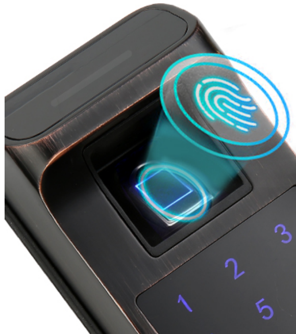
Figure 6: Fingerprint unlock in action.