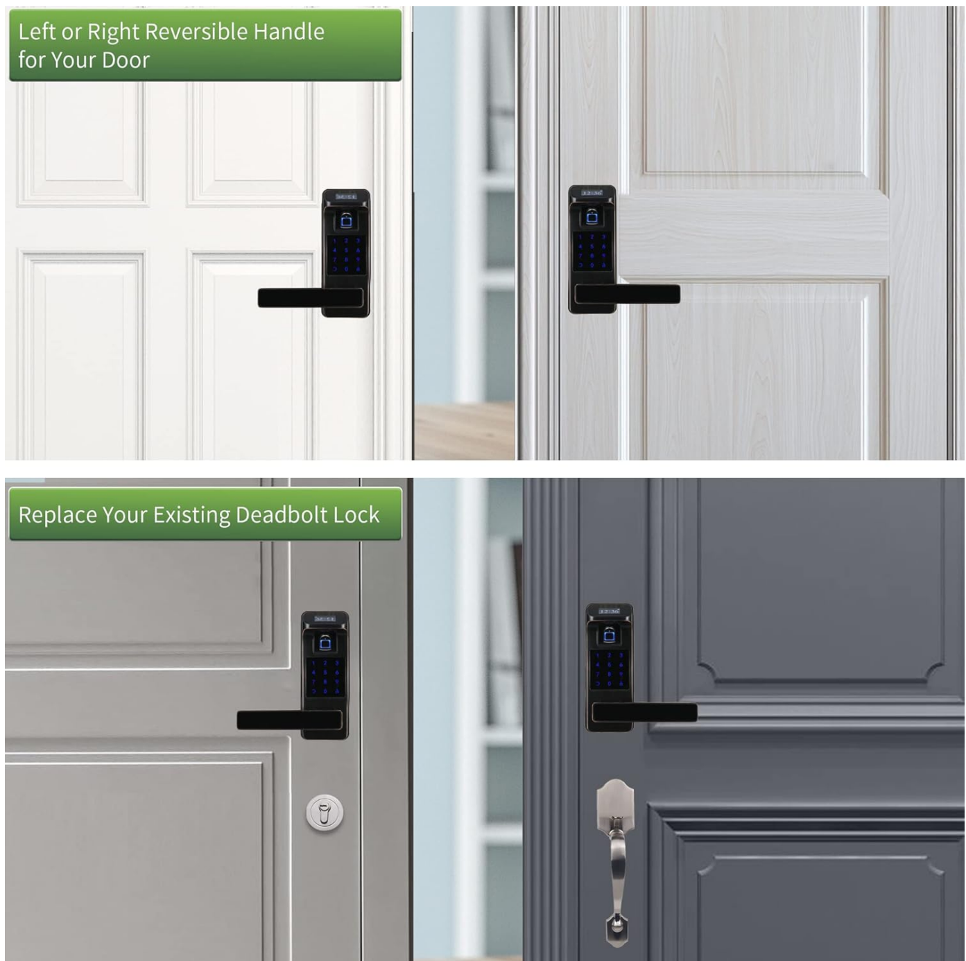
Figure 2: Reversible handle for left or right-handed door installation.