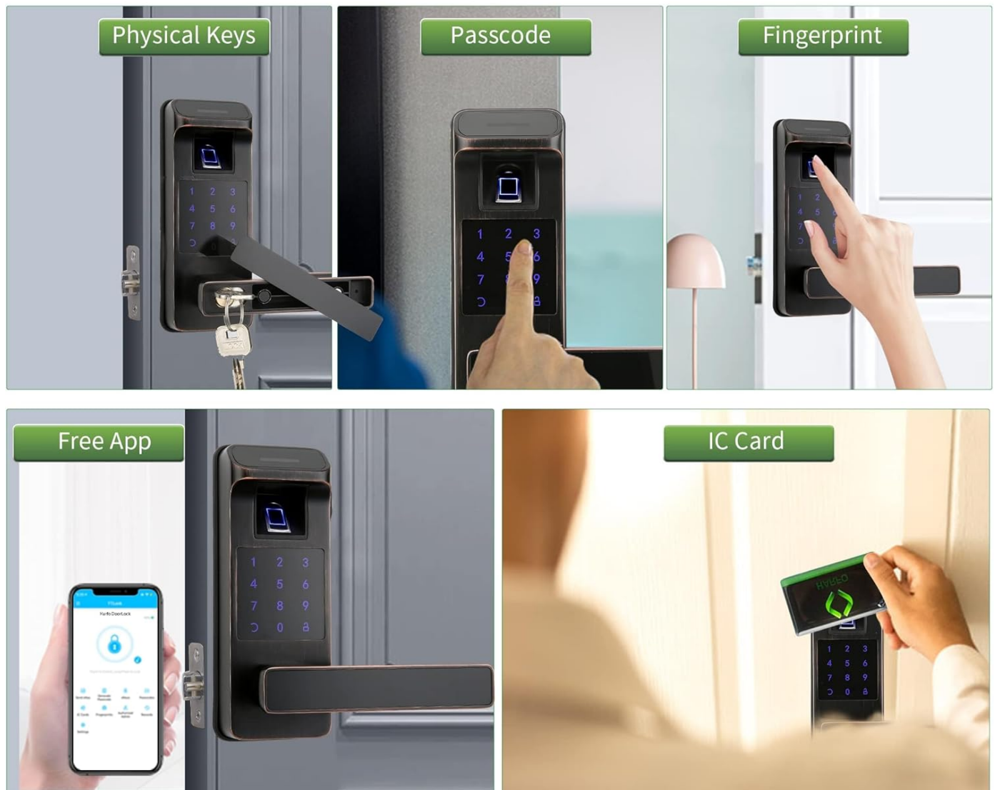
Figure 5: Overview of the 5 unlock methods.