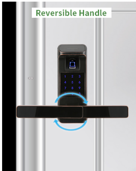
Figure 7: Passcode entry on the digital keypad.