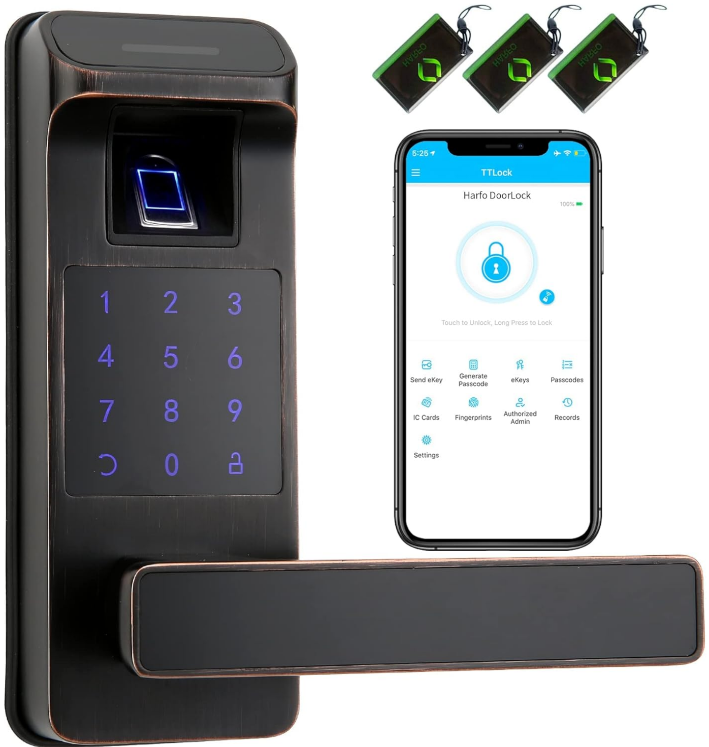
Figure 1: Harfo Smart Door Lock and included accessories.