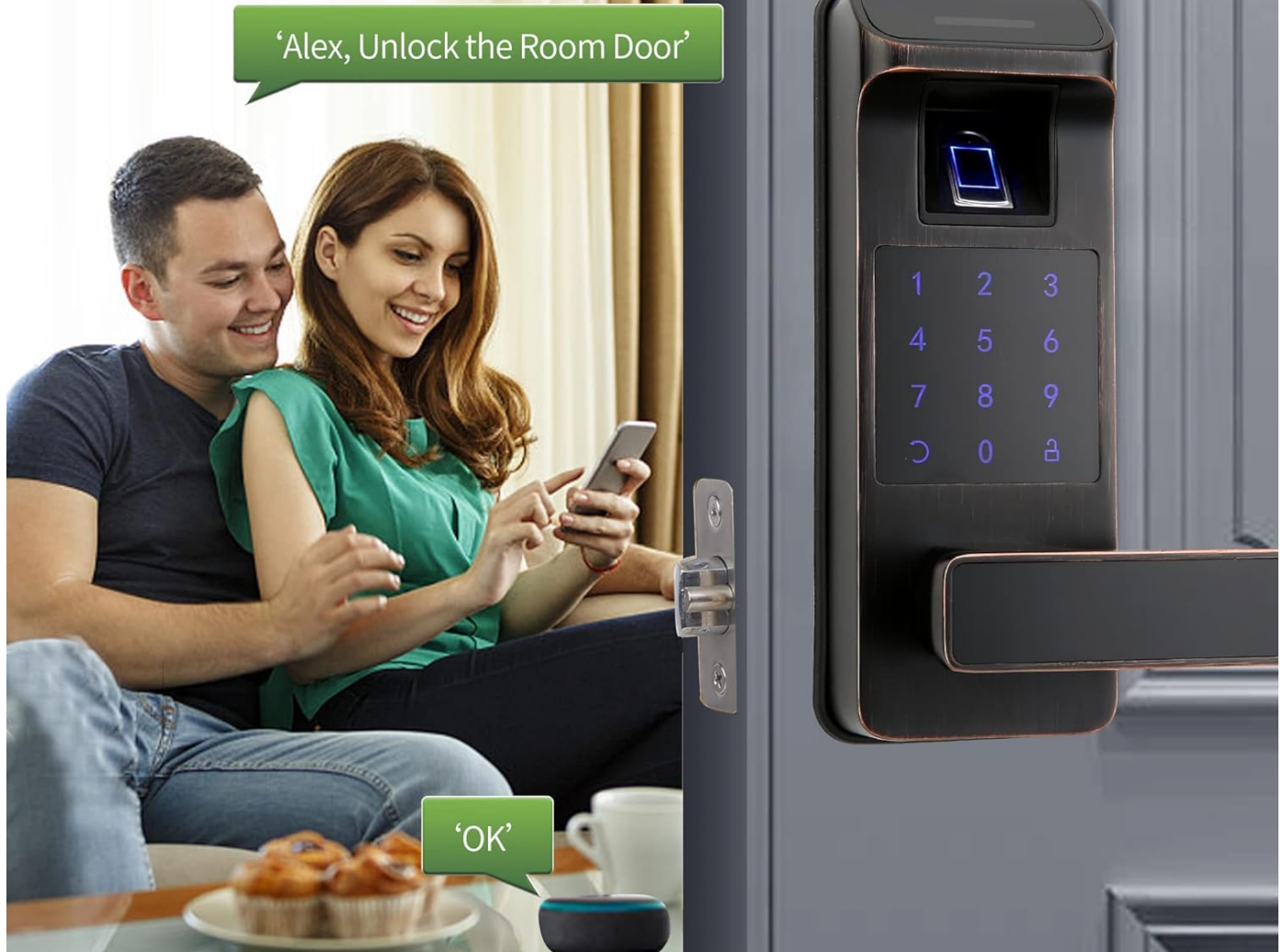
Figure 9: Smart Voice Control with Alexa (Gateway required).

(Require Harfo Gateway (Sold separately))