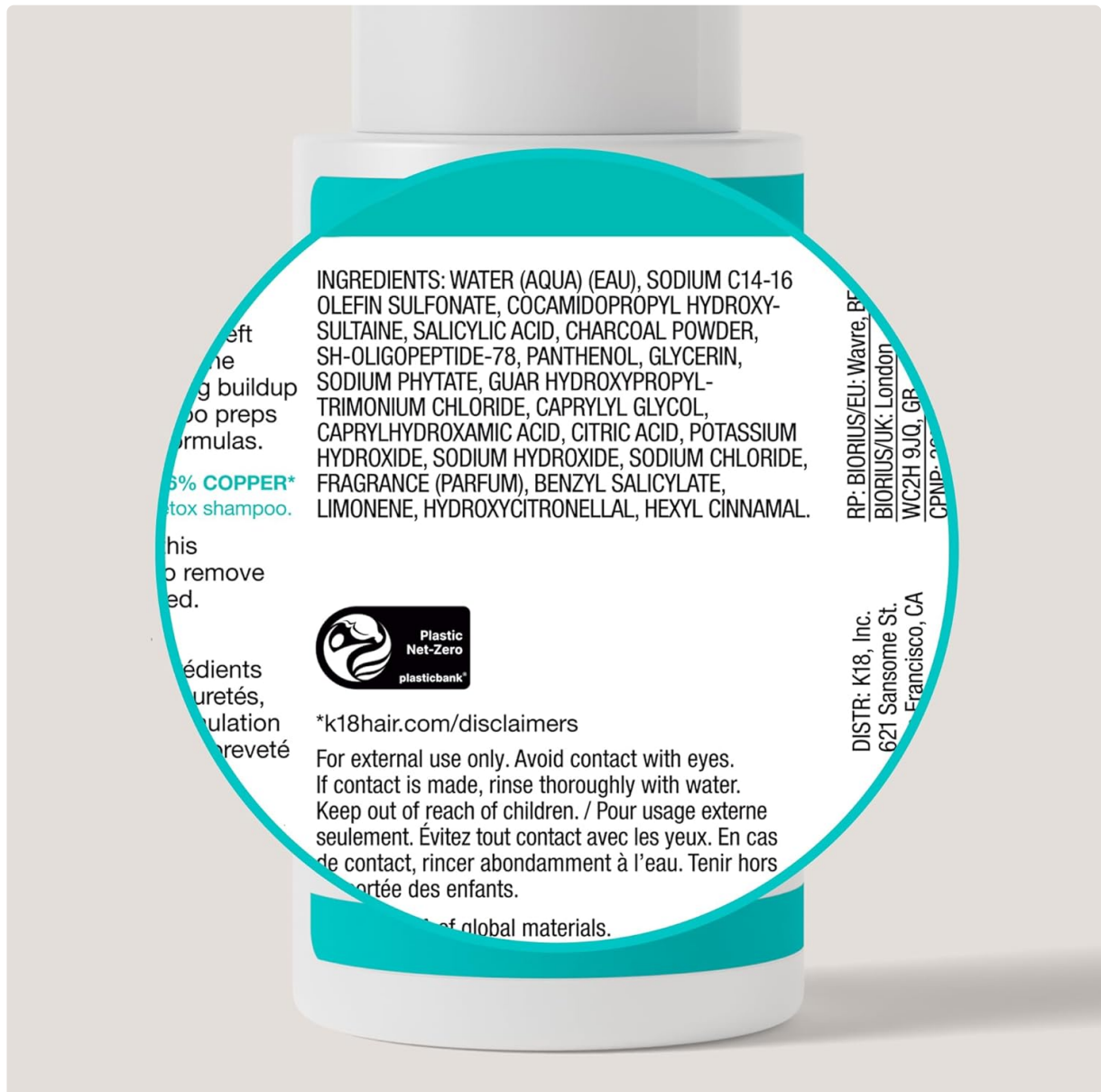
Figure 4: The back label of the K18 PEPTIDE PREP™ shampoo bottle, detailing ingredients and usage information.