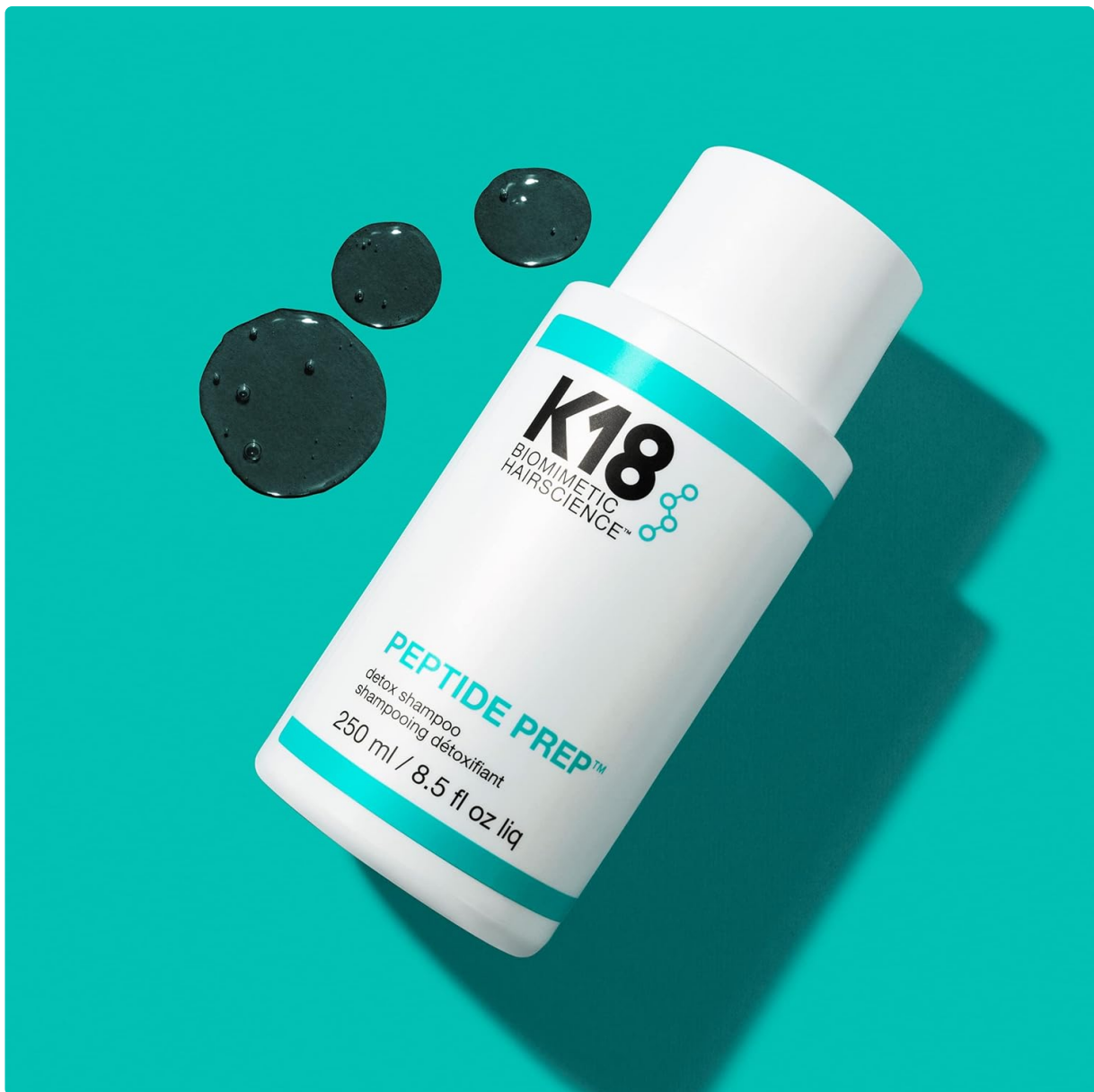
Figure 3: The K18 PEPTIDE PREP™ shampoo bottle, illustrating the product's texture and color.