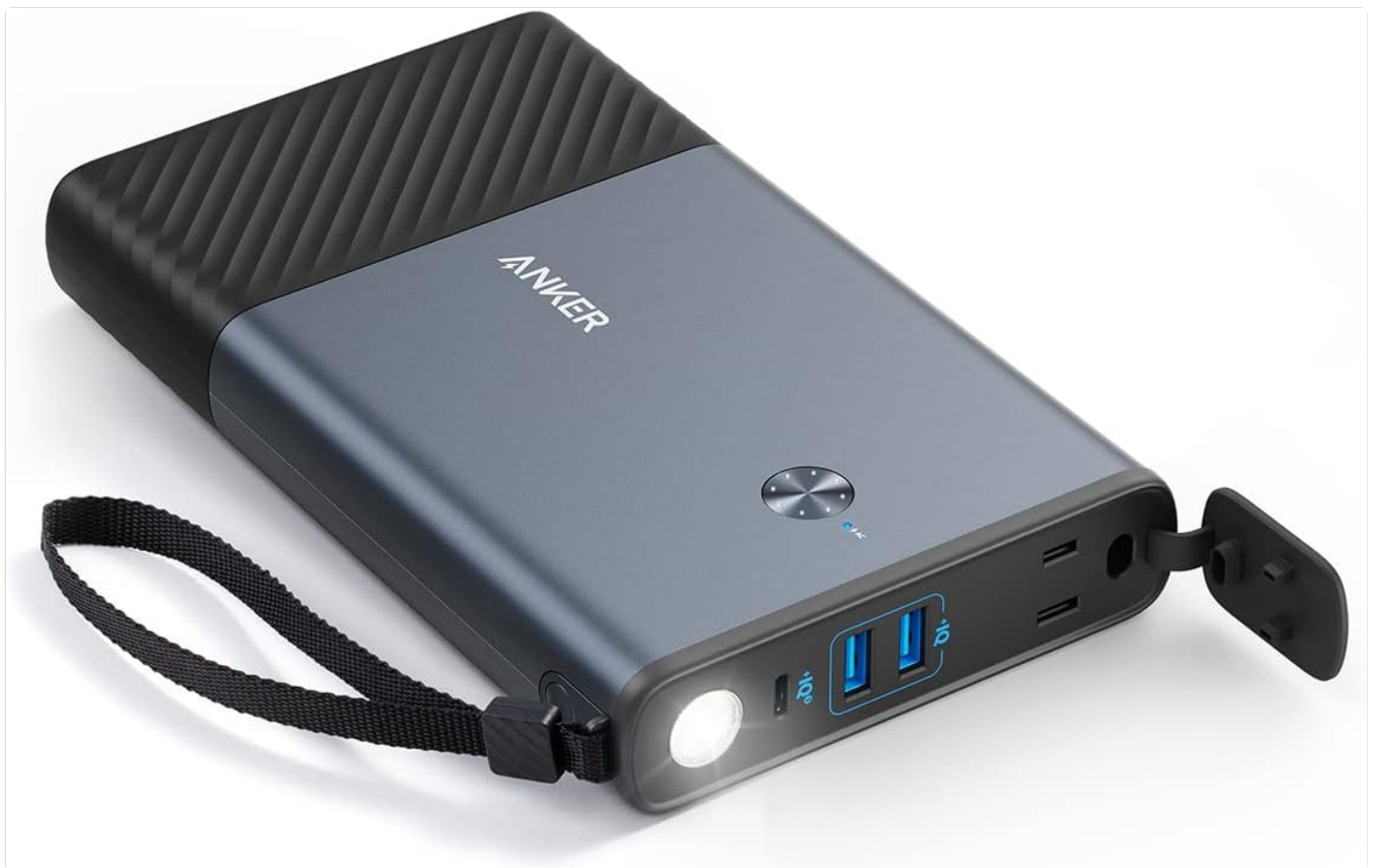
Image: The Anker Powerhouse 90 portable charger, highlighting its front panel with the AC outlet, USB-A ports, USB-C port, and integrated flashlight.