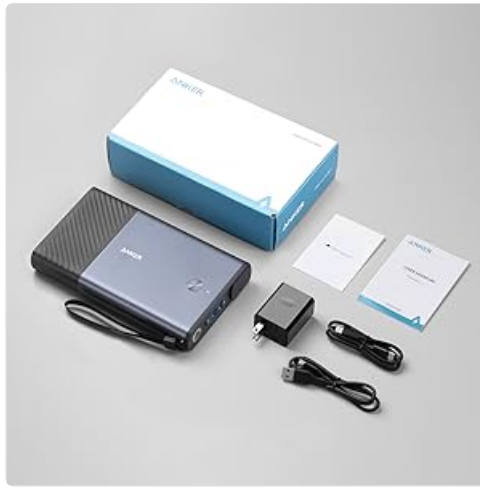
Image: The Anker Powerhouse 90 connected to a wall outlet via its 45W wall charger for recharging.

It is recommended to fully charge the Powerhouse 90 at least once every 1-2 months if not in regular use to maintain battery health.