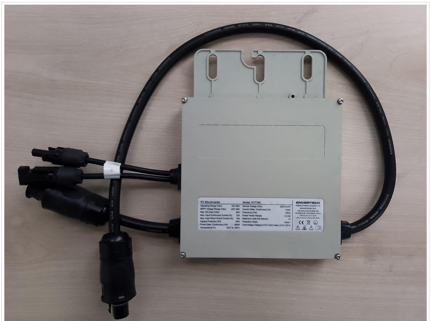
Figure 2: Top view of the EVT360 Micro-Inverter, displaying the product label with technical specifications.