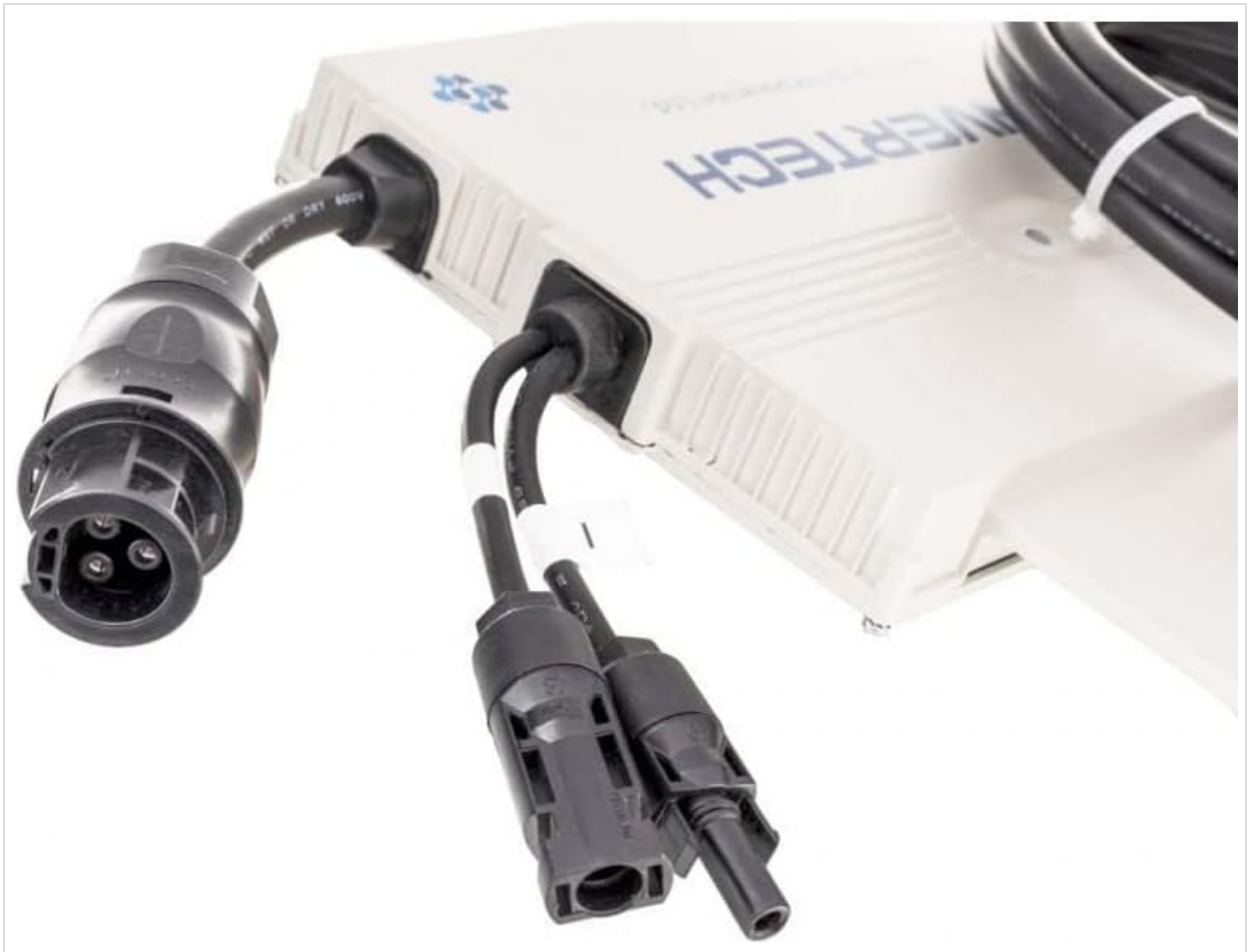
Figure 4: Close-up view of the DC input connectors.