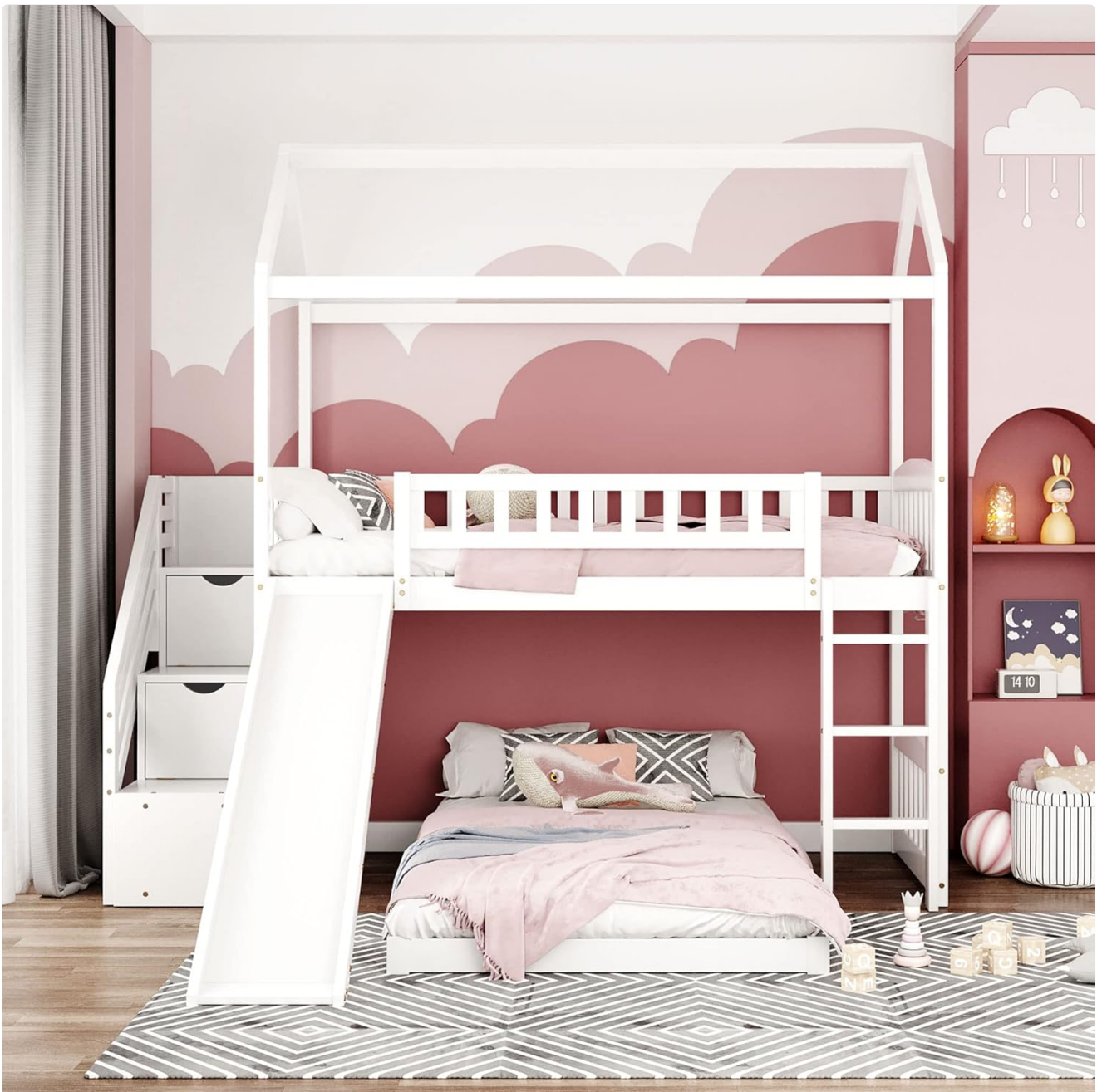
Figure 4.1: The bunk bed configured with the slide and storage stairs on the left side, demonstrating its functional layout for play and rest.