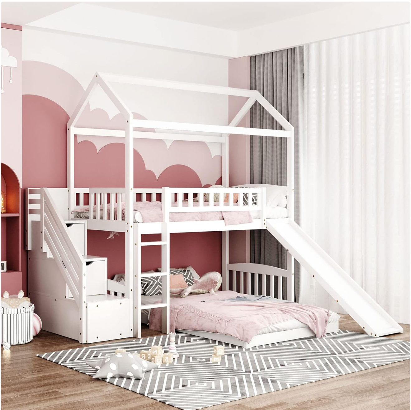
Figure 1.1: Overall view of the MOEO Twin Over Twin House Bunk Bed, showcasing its house-shaped frame, slide, and integrated storage stairs with drawers.