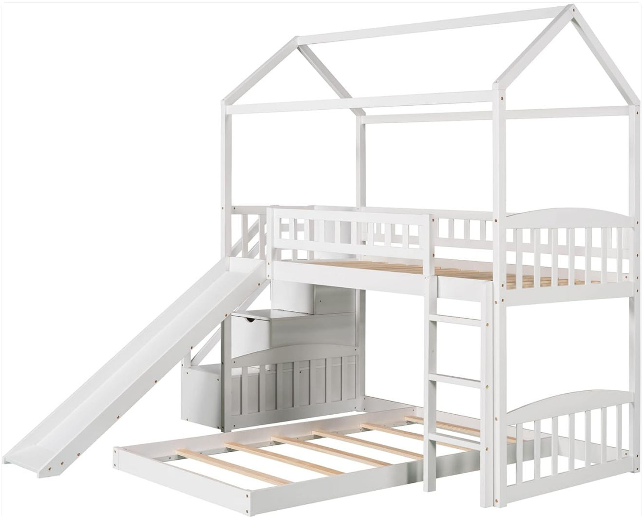
Figure 3.2: Detailed view of the integrated storage steps and slide, which can be configured on either side of the bunk bed during assembly.