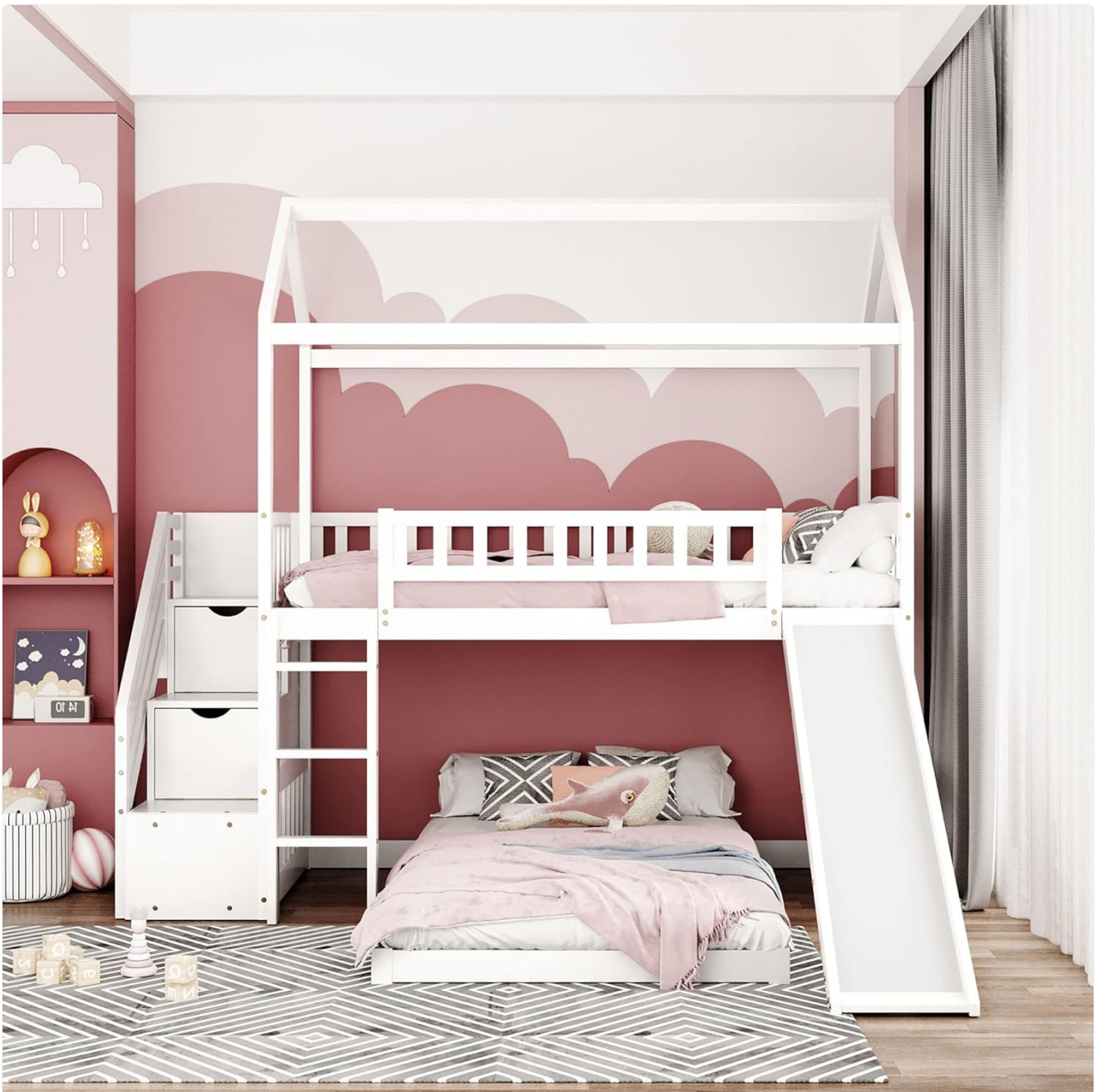
Figure 3.1: Structural view of the bunk bed, illustrating the various components and their arrangement before assembly.