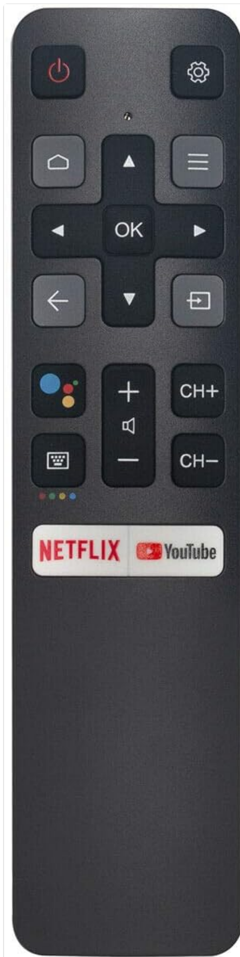
Image: Front view of the remote control, indicating the location of the OK and Back buttons used for the pairing process.