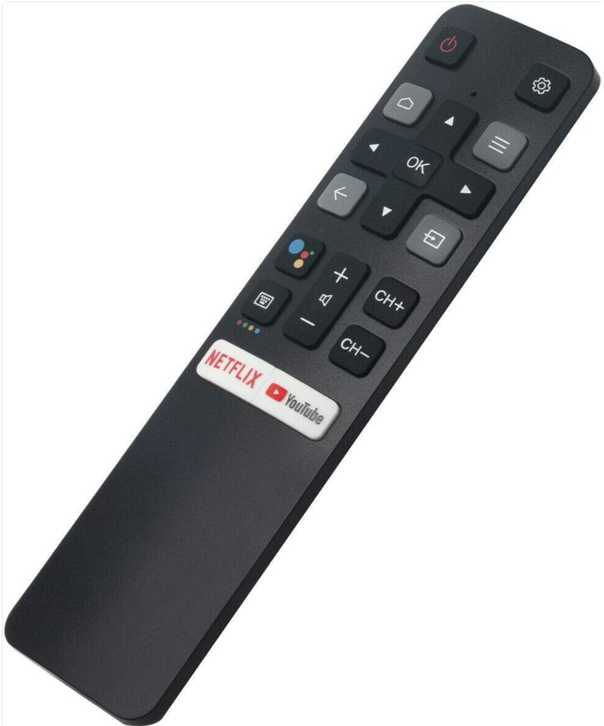
Image: Full front view of the Generic RC802V remote control, displaying the layout of all buttons.

Once paired, your remote control provides full functionality for navigating your TCL Smart Android TV. Below is an overview of key buttons and their functions: