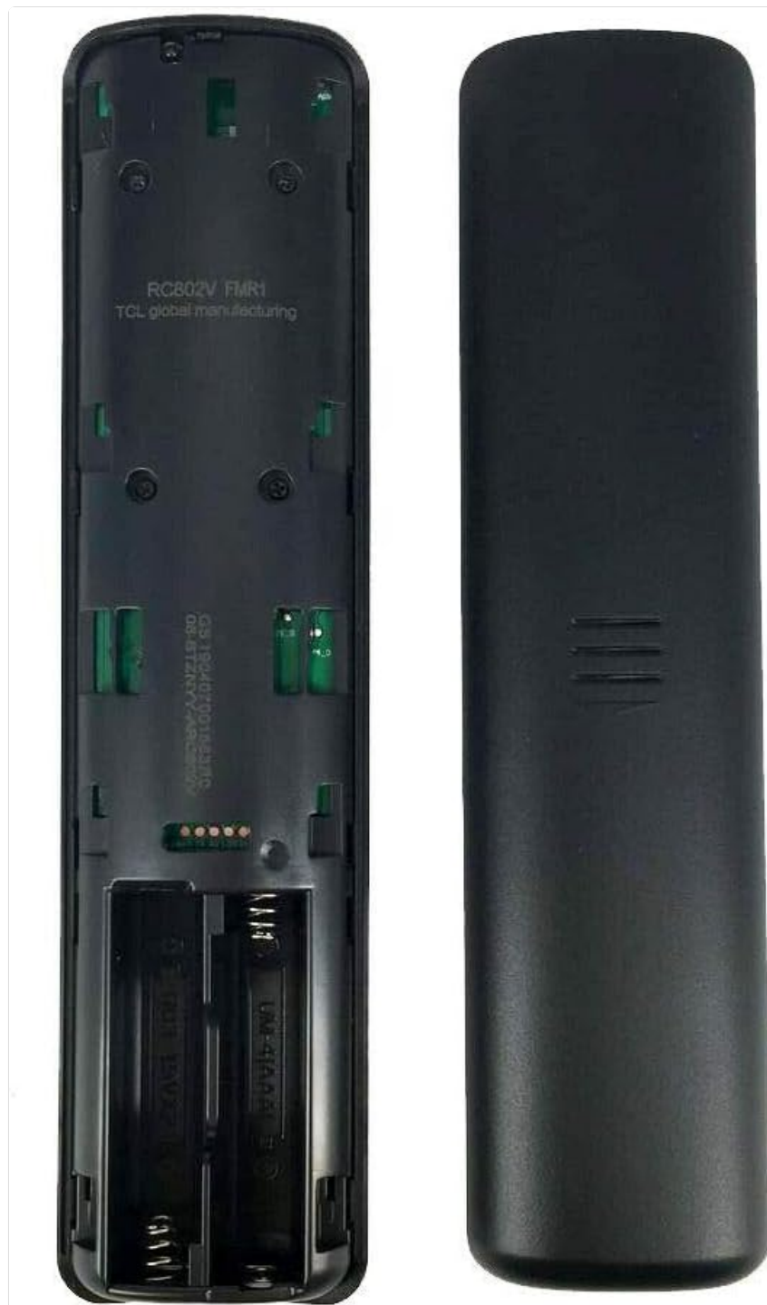
Image: Back view of the remote control, illustrating the open battery compartment for AAA battery installation.