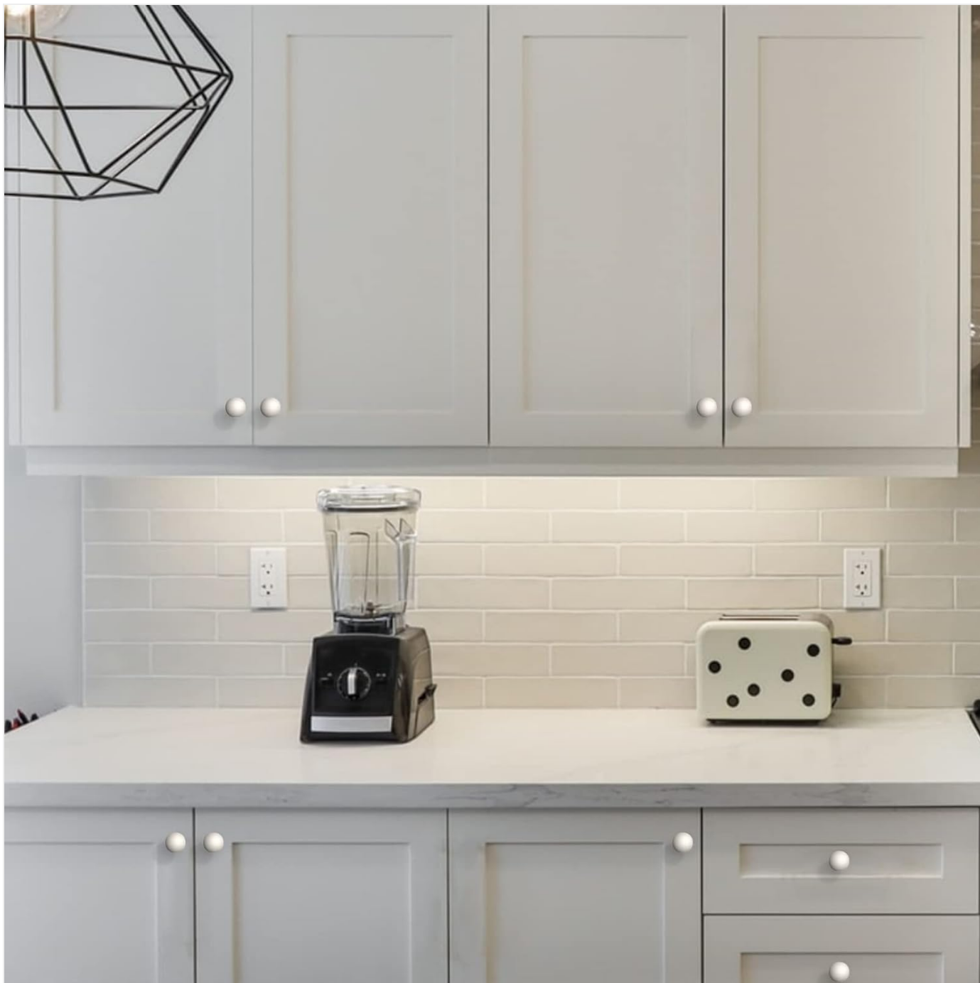
Image 2.2: Asidrama Brushed Satin Nickel Cabinet Knobs integrated into a kitchen environment, demonstrating their aesthetic contribution.