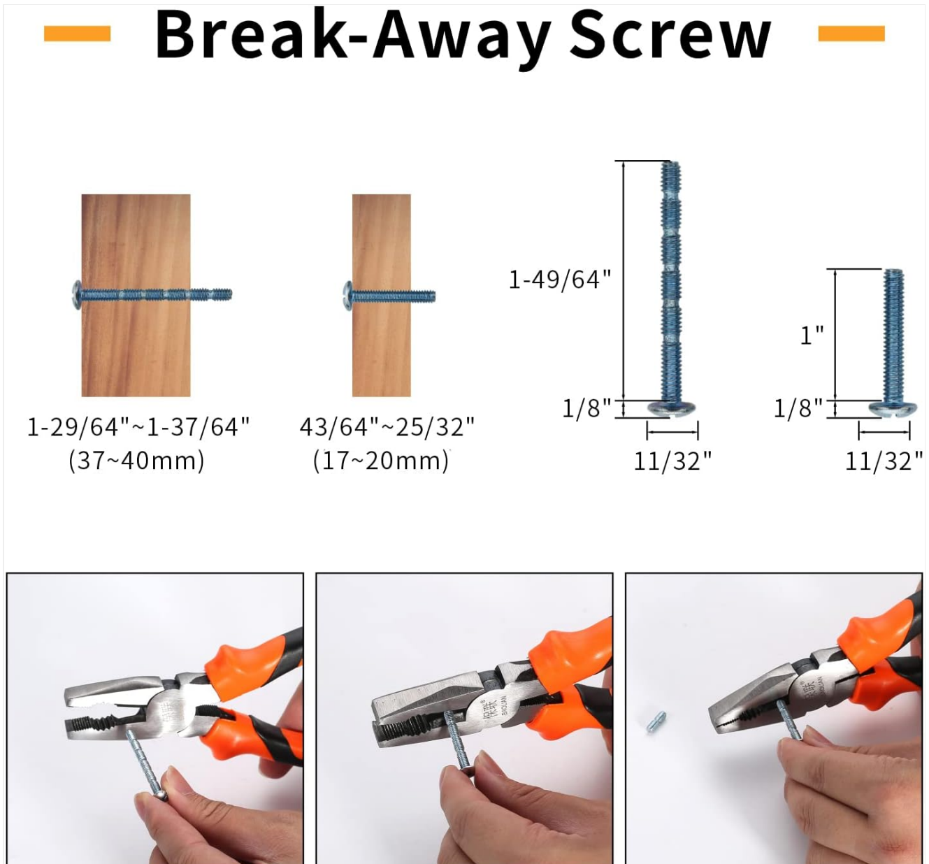
Image 2.1: Illustration of break-away screws and the method for shortening them with pliers to fit various cabinet or drawer thicknesses.

Measure the thickness of your cabinet door or drawer front. Select the appropriate break point on the screw that allows it to pass through the material and engage sufficiently with the knob. Use pliers to firmly snap off the excess length of the screw at the desired score line.