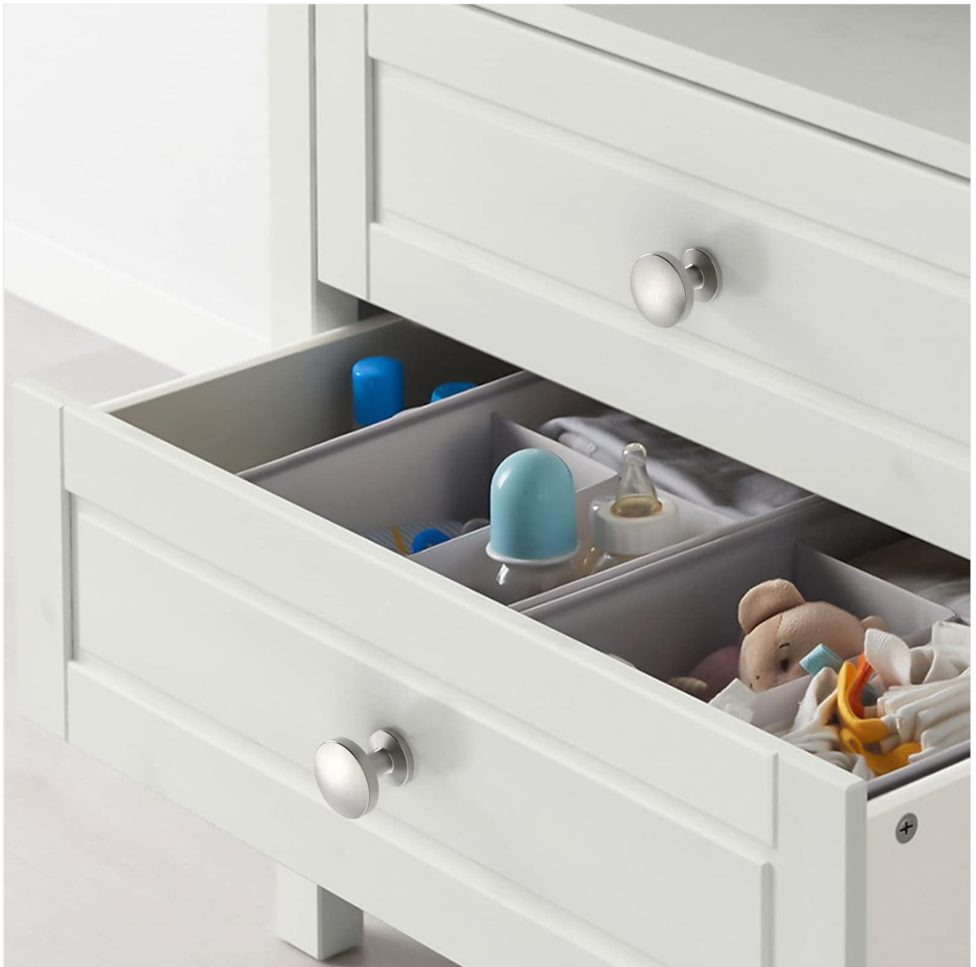
Image 3.1: Asidrama Brushed Satin Nickel Cabinet Knobs on white dresser drawers, illustrating their functional use on furniture.