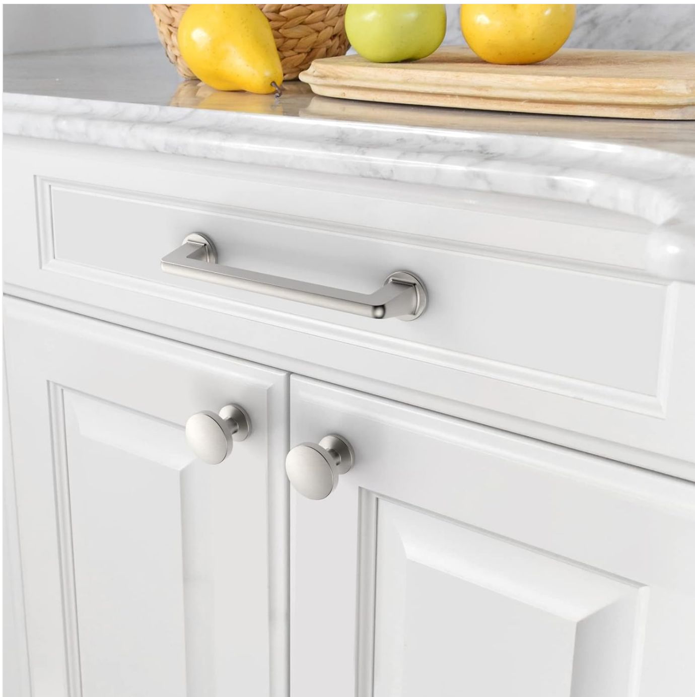
Image 1.1: Asidrama Brushed Satin Nickel Cabinet Knobs installed on white kitchen cabinets and drawers, showcasing their appearance in a typical setting.