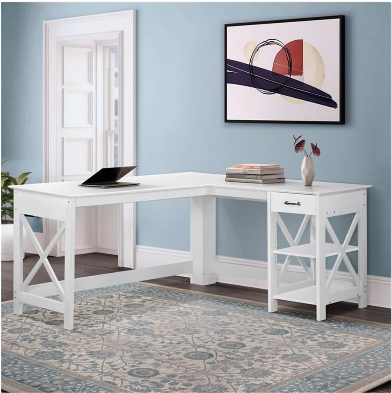
Image 1: The Saint Birch L-Shaped Farmhouse Wood Desk in a white finish, showcasing its design and storage features.