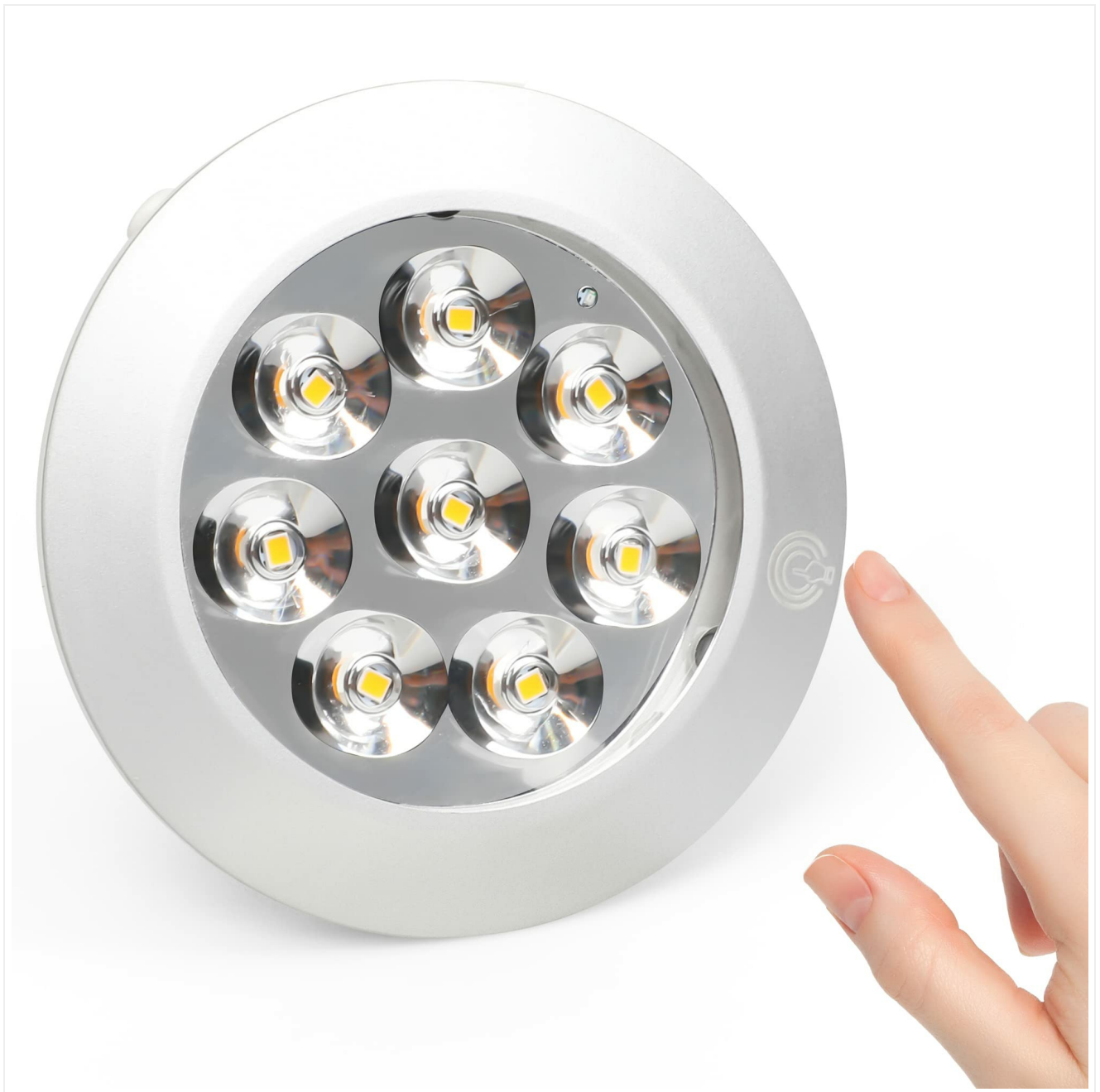
Image: This image highlights the touch sensor on the SOAIY LED Cabinet Light, demonstrating its one-touch functionality for turning the light ON and OFF. The lamp is shown installed in a cabinet.