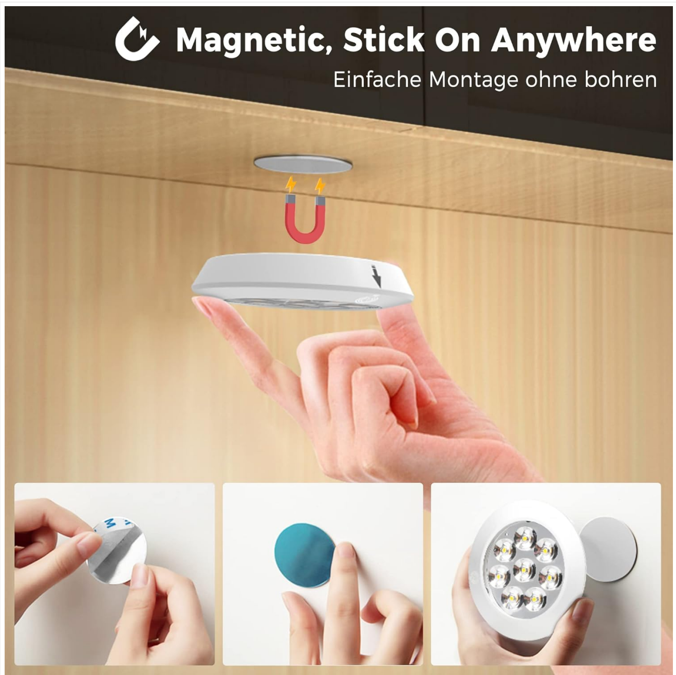
Image: This image demonstrates the simple, drill-free magnetic installation of the SOAIY LED Cabinet Light. It shows how to apply the adhesive metal disc to a surface and then attach the lamp magnetically.