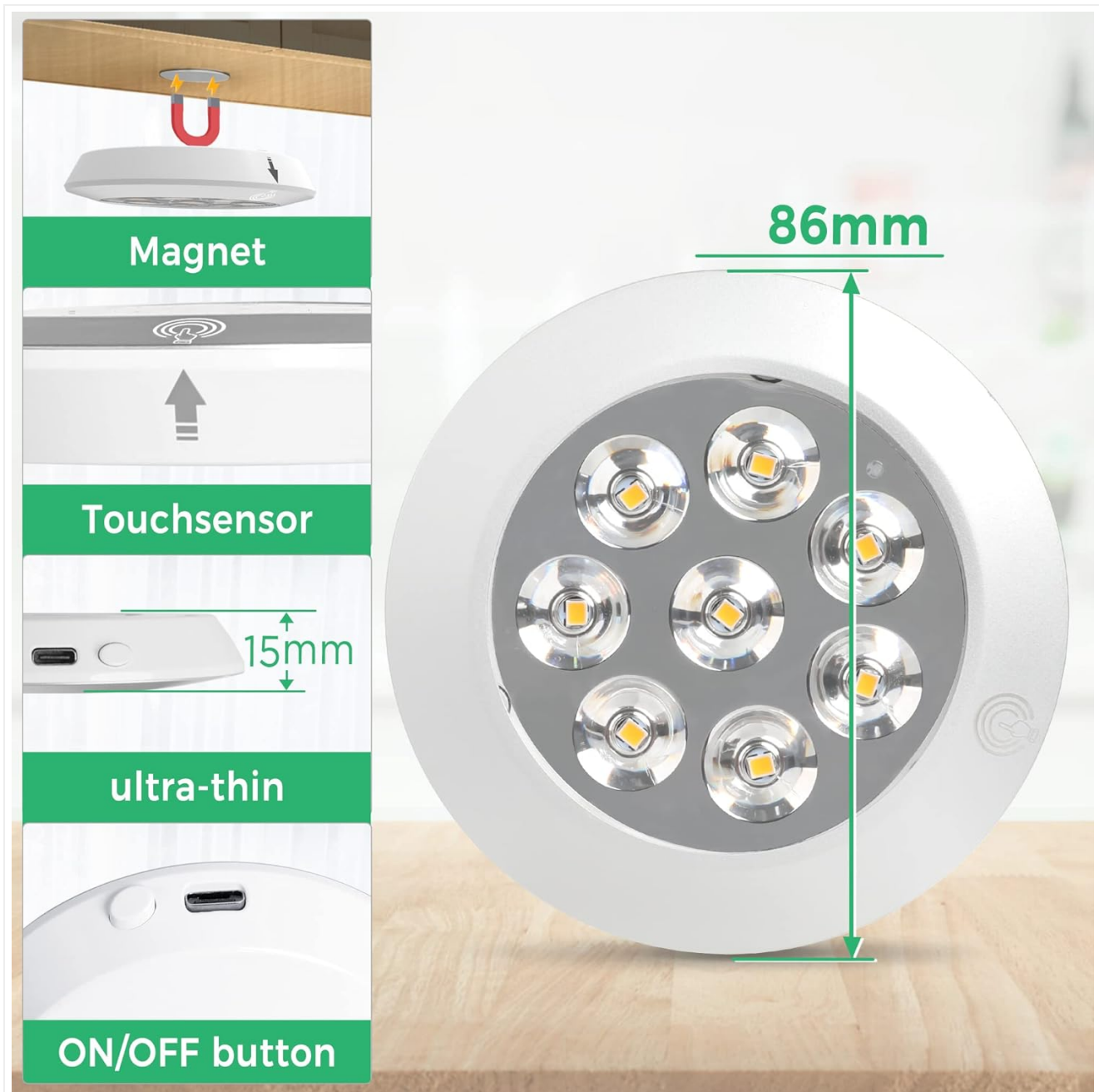
Image: This diagram illustrates the key components of the SOAIY LED Cabinet Light, including the magnet, touch sensor, USB-C port, and ON/OFF button. It also shows the product dimensions: 86mm diameter and 15mm thickness.