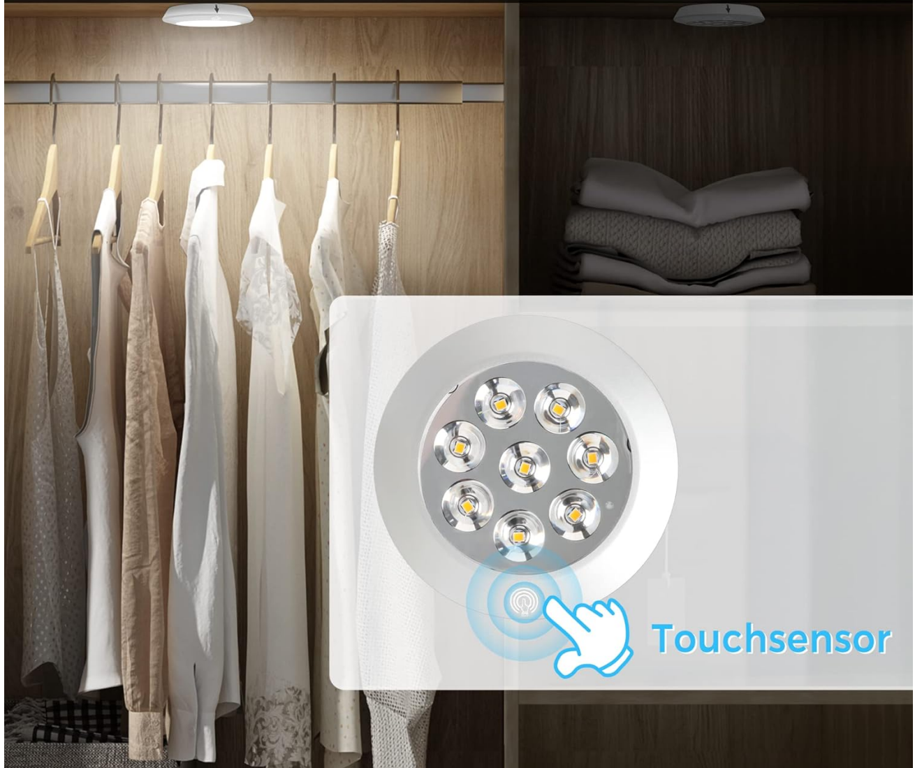
Image: This image illustrates the dimming capability of the SOAIY LED Cabinet Light. It shows that a short touch controls ON/OFF, while a long touch allows for continuous brightness adjustment from 10% to 100%.