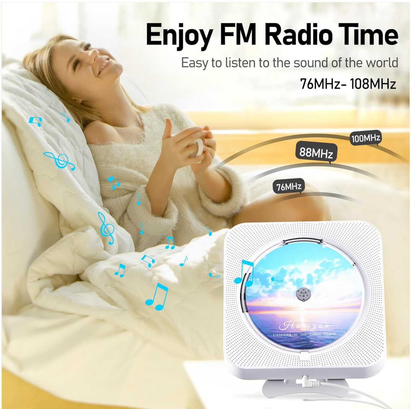
Image: Enjoying FM Radio.