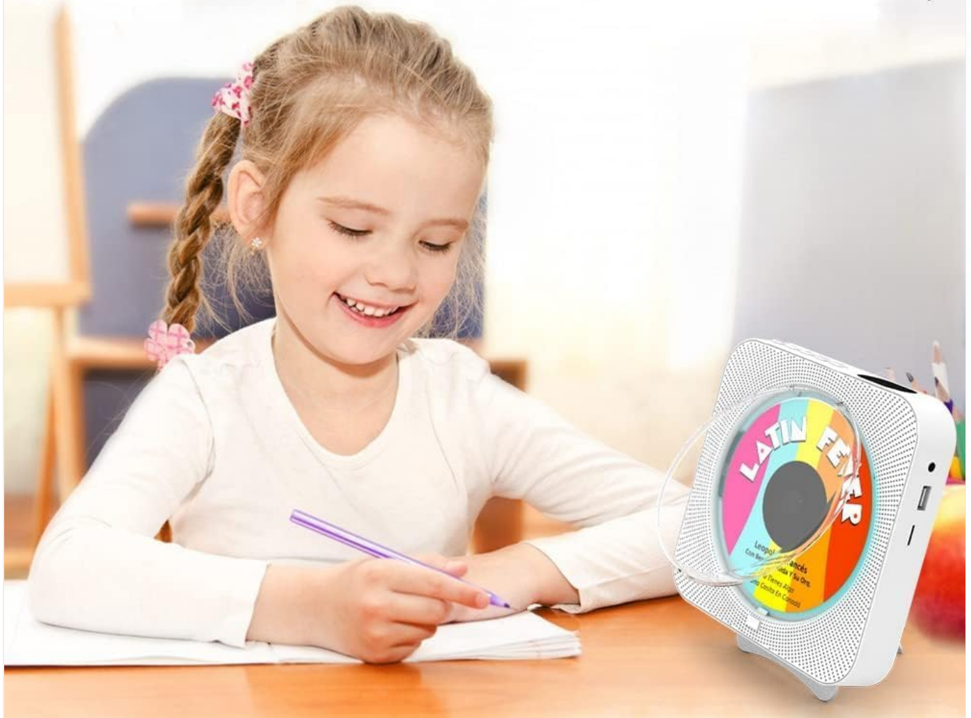
Image: Language learning with A-B repeat function.

A-B Repeat Function Allows Children To Master Words Quickly