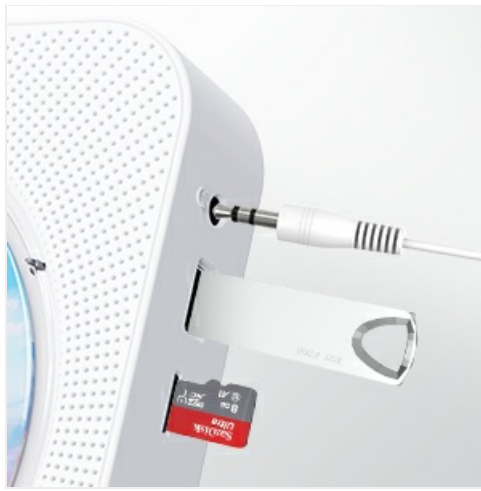
Image: TF card and USB flash drive insertion points.