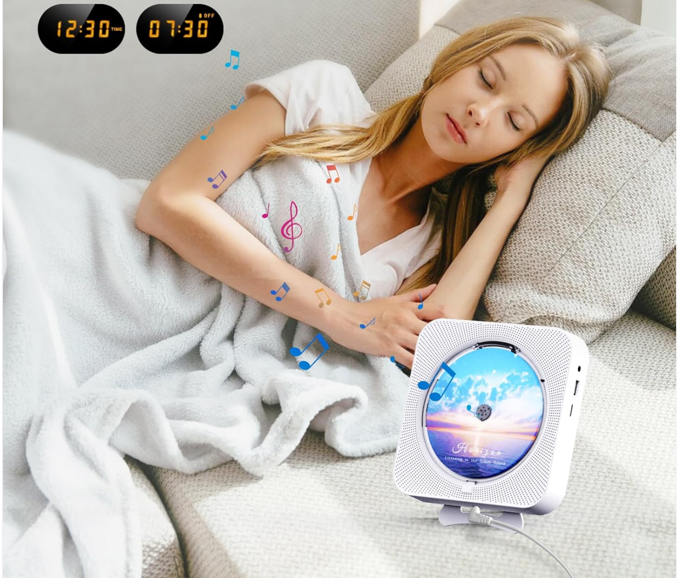
Image: Setting the timer to stop playing.