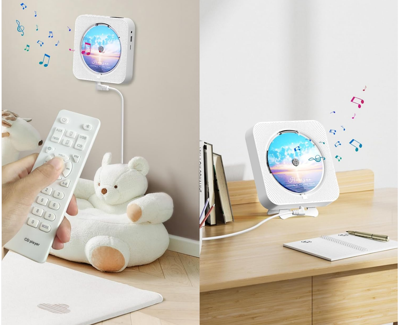
Image: The CD player shown in both wall-mounted and desk-standing configurations.