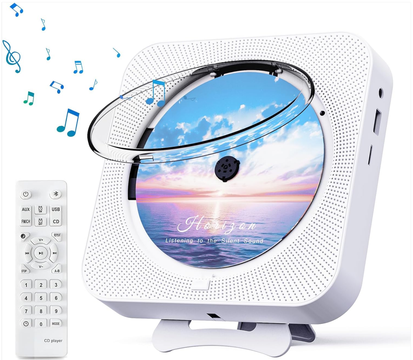
Image: MICOCIOUS CD Player and its remote control.