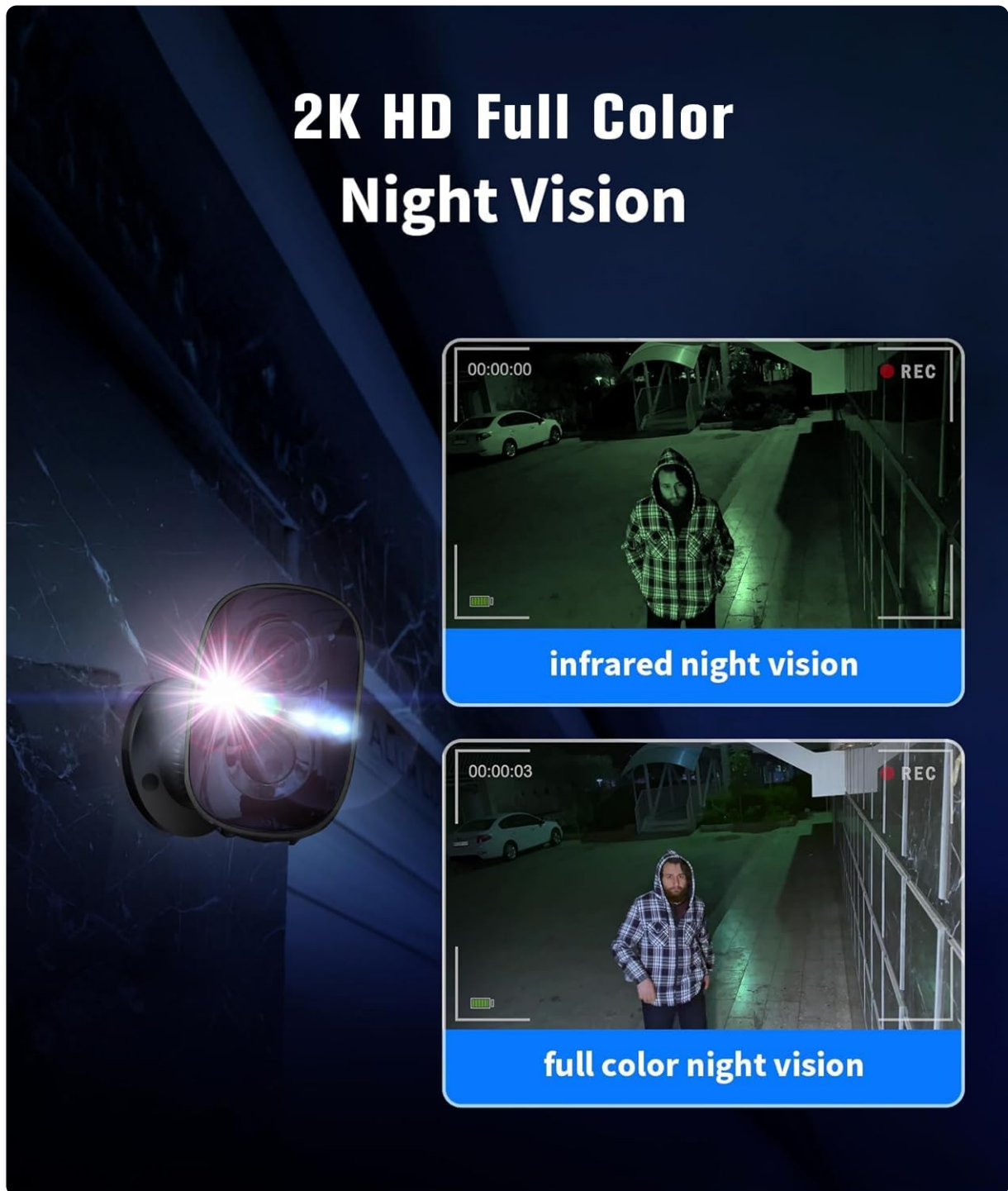
Image: Comparison image showing infrared night vision (monochrome) and full-color night vision from the abetap X83 camera.