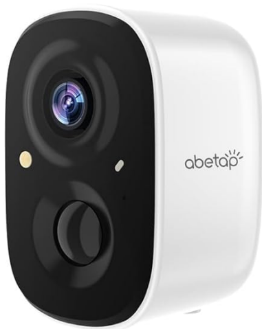
1080P HD Camera *1