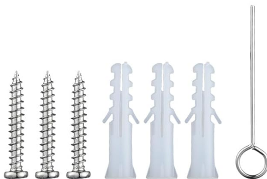
Mounting Kit *1