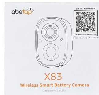
Operation Instruction *1