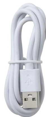
USB Charging Cable *1

Image: Contents of the abetap X83 box, including the camera, mounting bracket, charging cable, screws, and user guide.