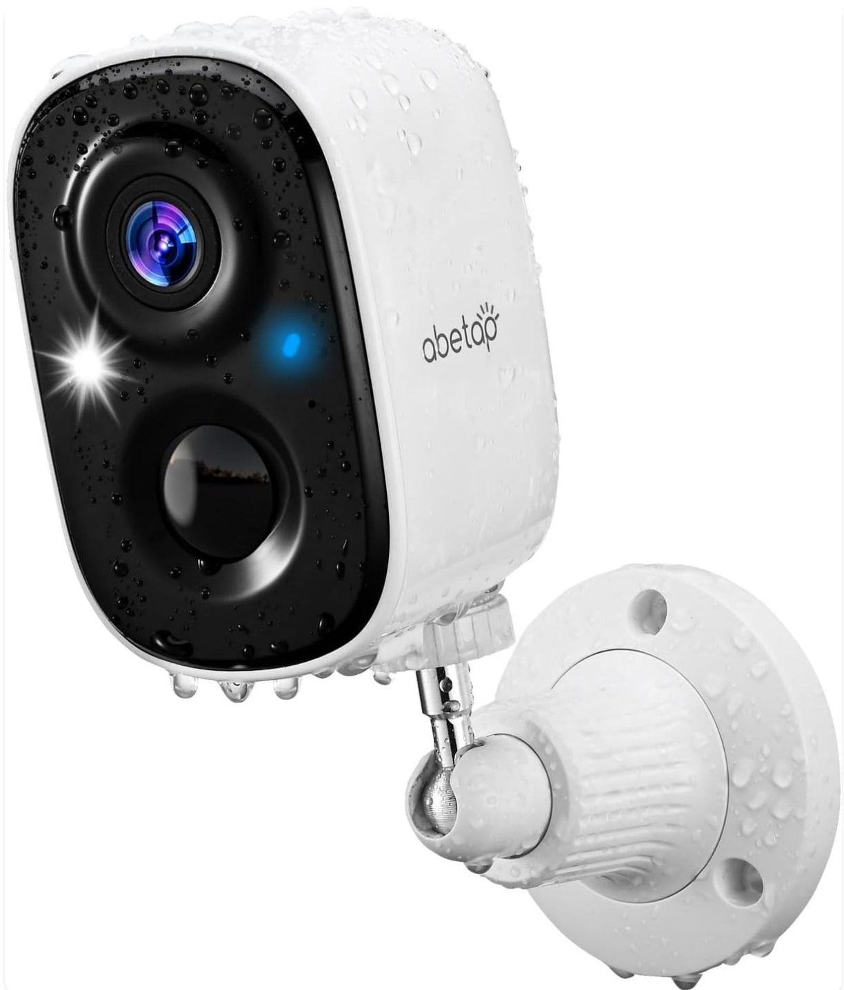
Image: abetap X83 Wireless Security Camera, white, showing the lens and sensors, with water droplets on its surface, mounted on a wall bracket.