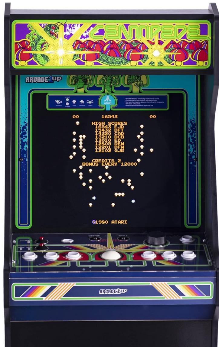
Figure 4: Control panel with trackball and buttons for game interaction.