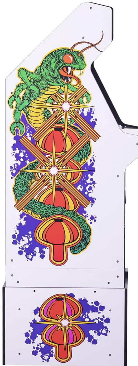
Figure 2: Side view of the arcade machine, illustrating the cabinet design.