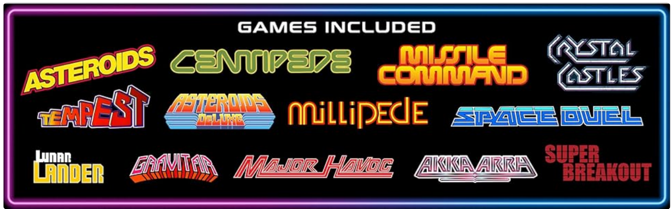
Figure 8: Visual representation of the 14 classic games included.