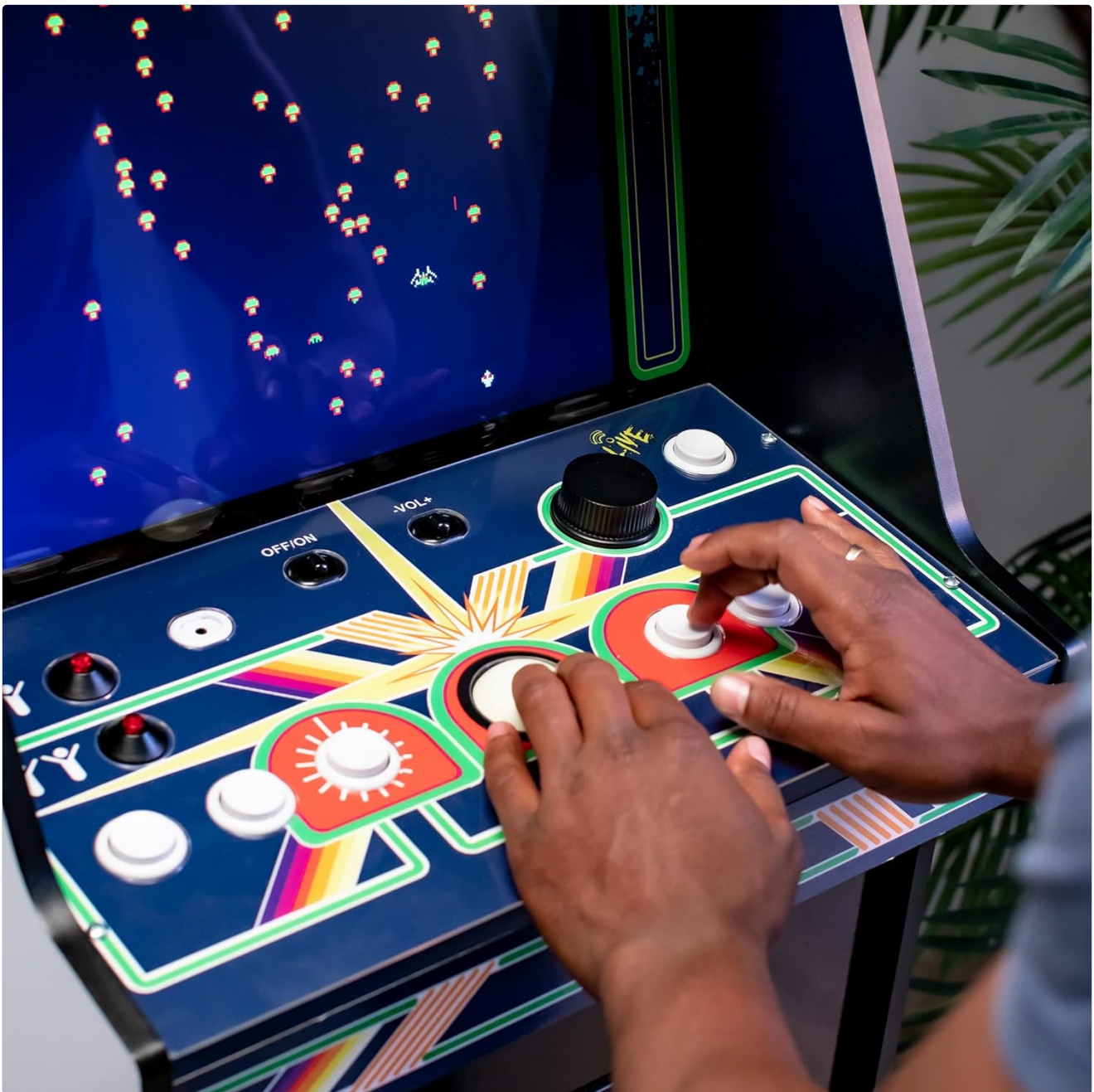
Figure 5: User interacting with the arcade machine's controls.