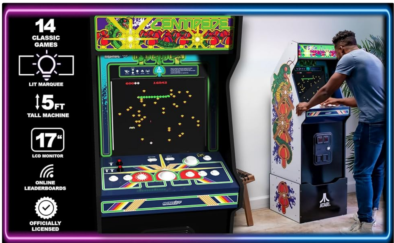
Figure 7: Key features and specifications of the arcade machine.