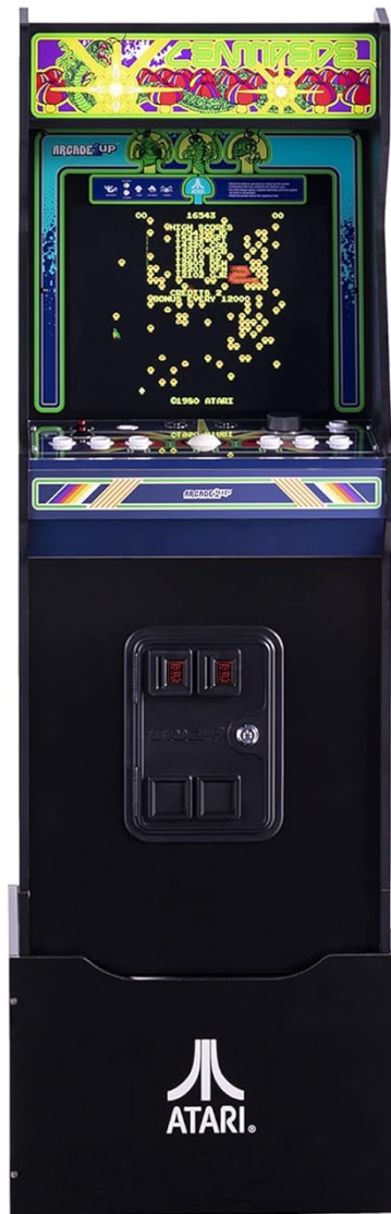
Figure 1: Front view of the Arcade1Up Centipede Atari Legacy Edition Home Arcade Machine.