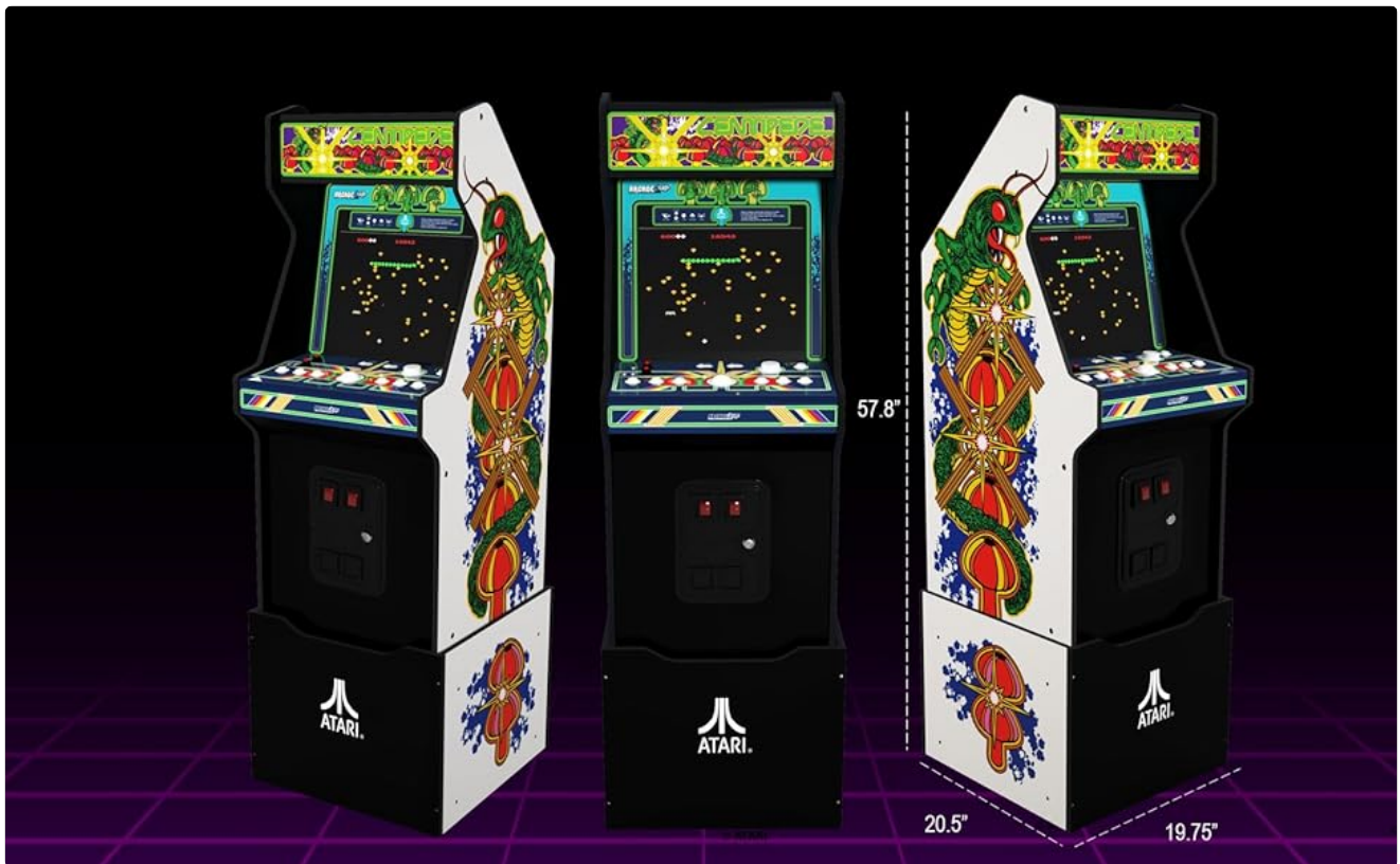
Figure 3: Arcade machine dimensions for placement planning.