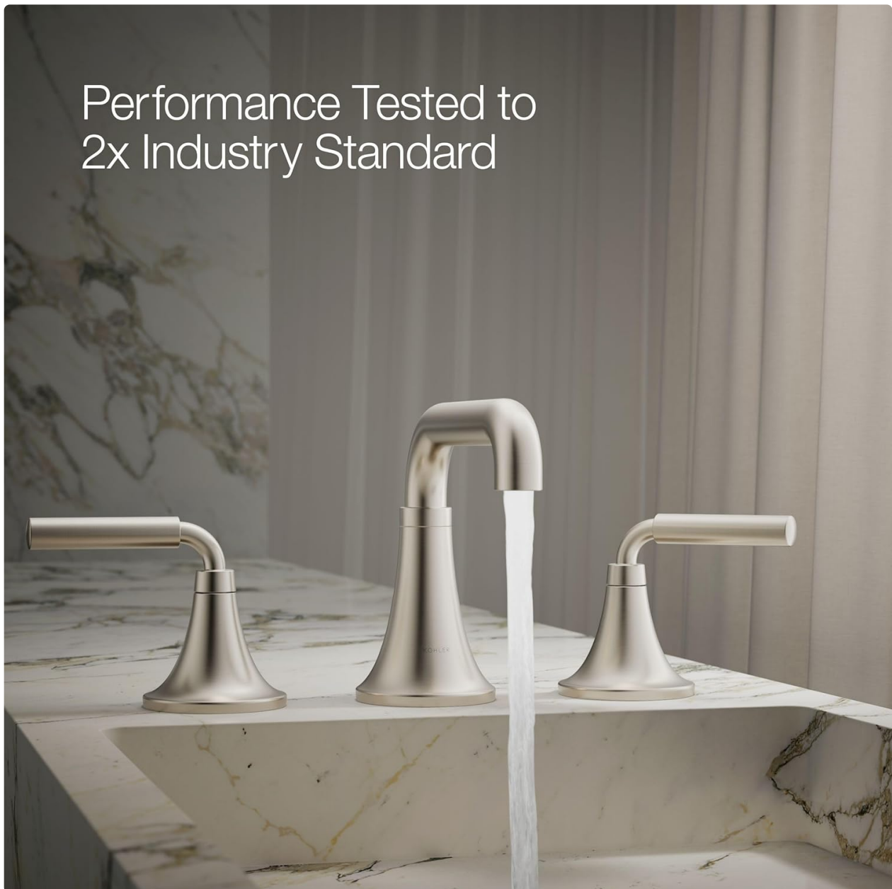
Image: The KOHLER Tone faucet in operation, demonstrating water flow from the spout.