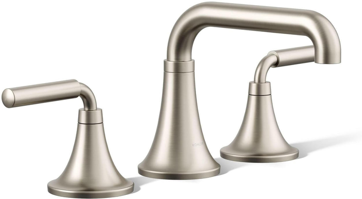
Image: The KOHLER Tone widespread bathroom sink faucet, showcasing its design and Vibrant Brushed Nickel finish.

The KOHLER Tone widespread bathroom sink faucet combines clean lines with a soft teardrop base, offering a modern aesthetic. This 3-hole widespread faucet is designed for easy installation and features two lever handles for precise control of hot and cold water. It is engineered to provide efficient water usage while maintaining performance.