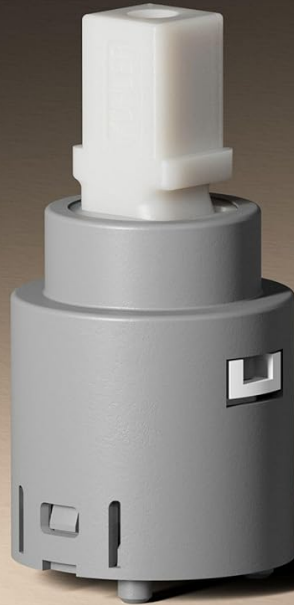
Image: A close-up view of the durable ceramic valve, highlighting its robust construction designed to prevent leaks.