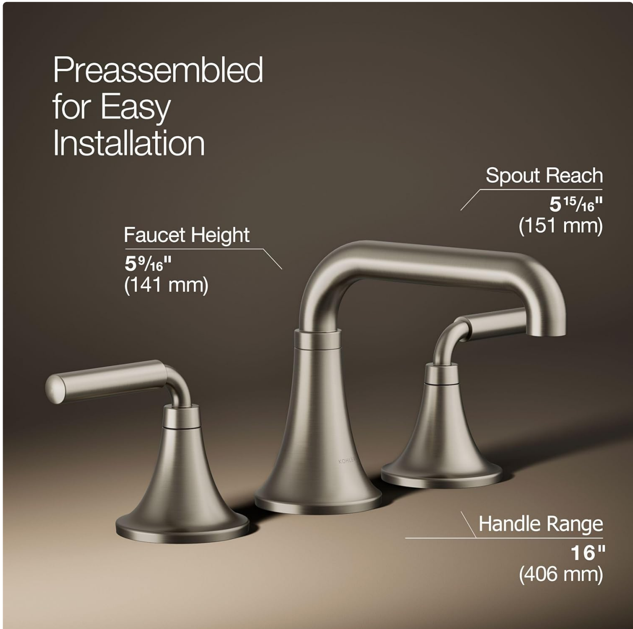
Image: Dimensional diagram of the faucet, indicating faucet height, spout reach, and handle range for installation planning.

This faucet is designed for 3-hole widespread installation. The unit comes preassembled for simplified setup. For detailed step-by-step instructions, please refer to the installation guide included in your product packaging. Ensure all local plumbing codes are followed during installation.