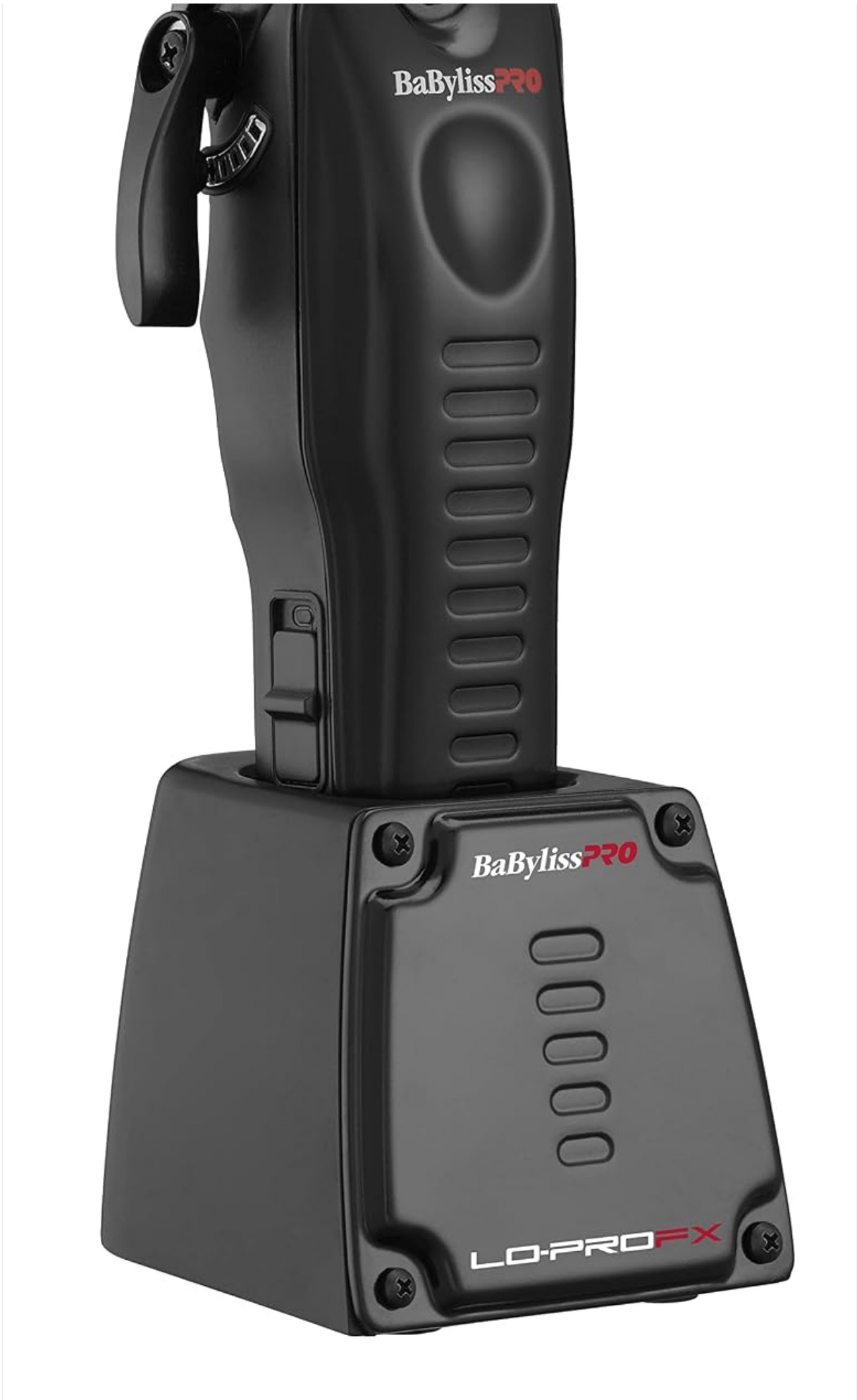
A side view of the BaBylissPRO LO-PROFX Charging Base, highlighting its compact design and the slot where the clipper is inserted.