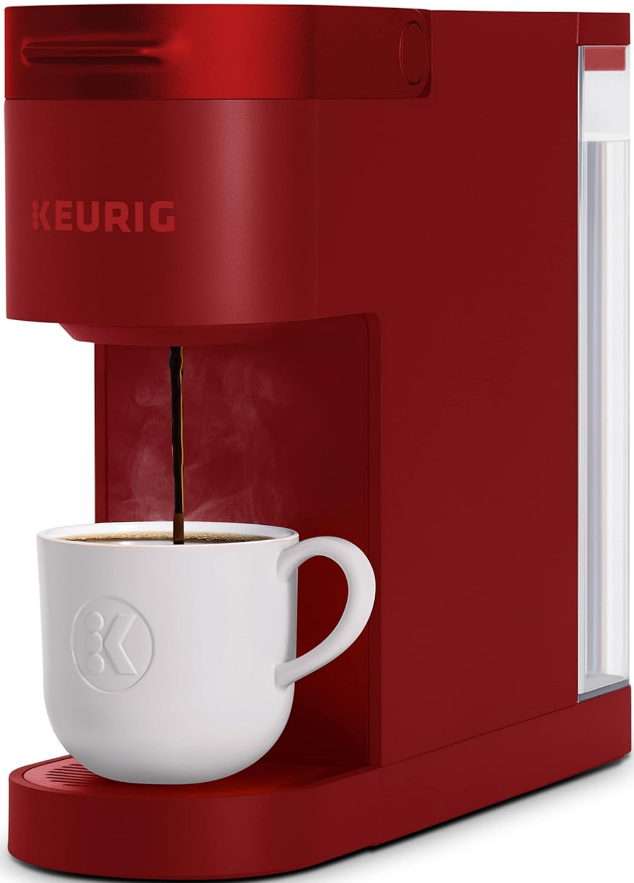
Keurig K-Slim Single Serve Coffee Maker in Scarlet Red, brewing coffee into a white mug.