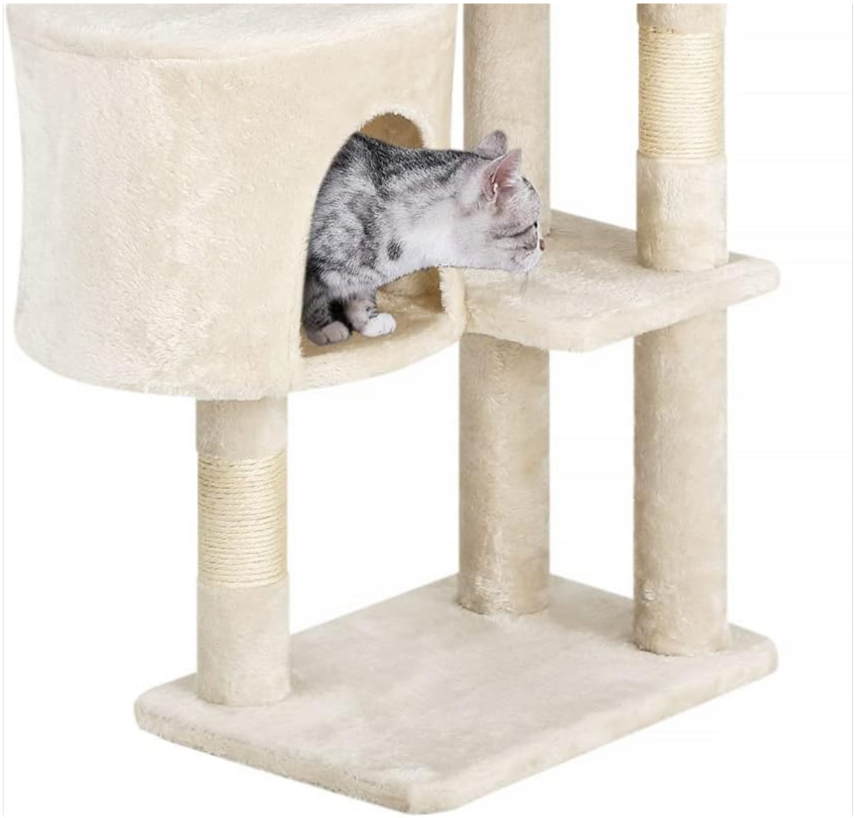
Figure 1: The BestPet Cat Tree in beige, showcasing its multi-level design, integrated condo, and scratching posts.