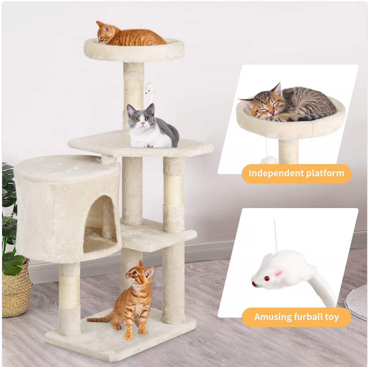
Figure 2: The cat tree offers an independent platform for resting and an amusing furball toy for interactive play.