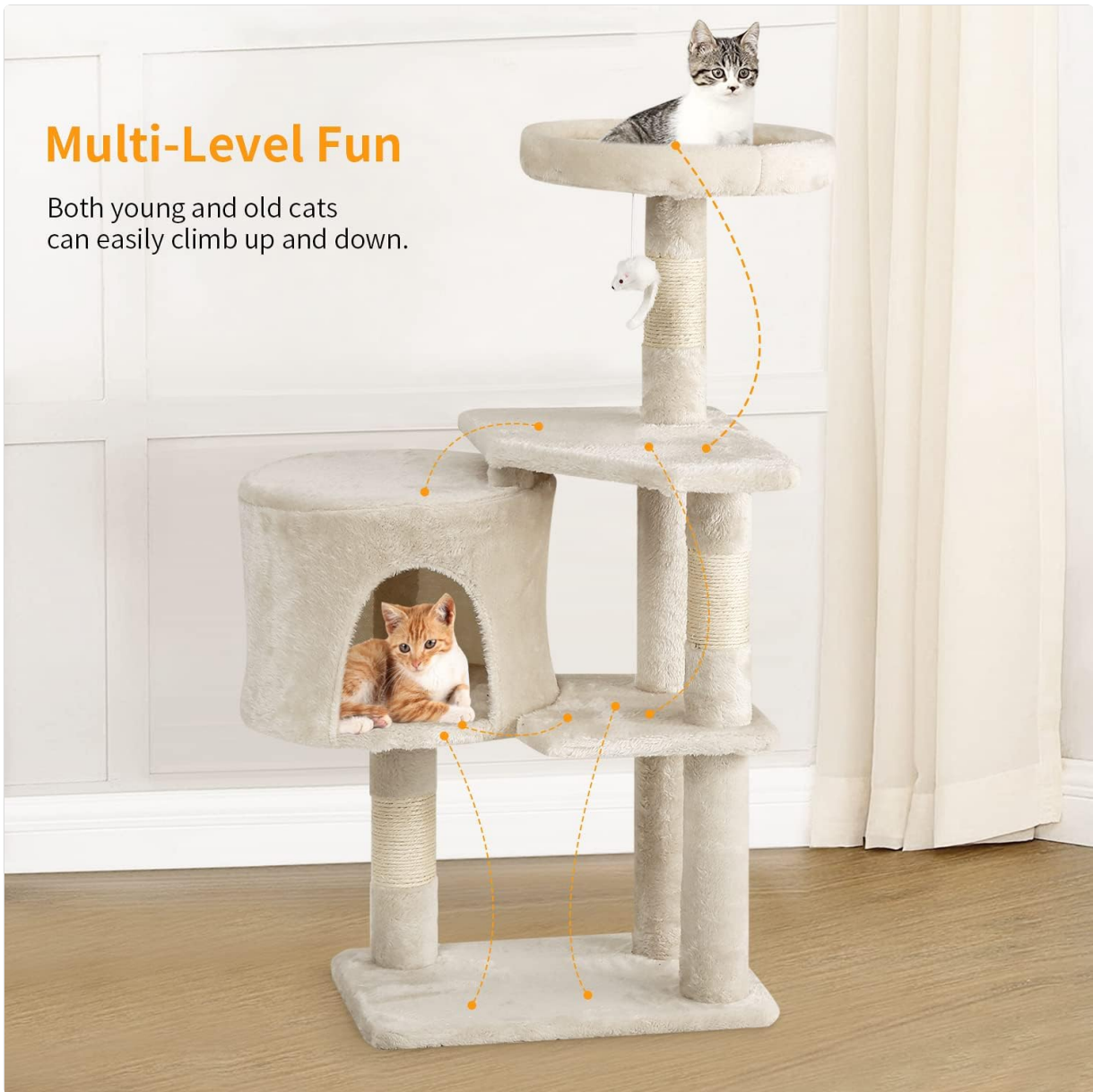
Figure 3: The multi-level design allows both young and old cats to easily climb up and down, providing varied activity.

Both young and old cats can easily climb up and down.