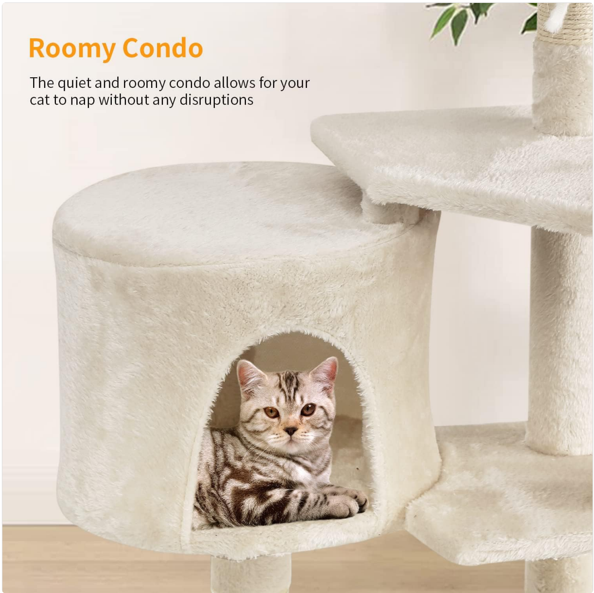
Figure 5: The roomy condo offers a private and comfortable space for your cat to nap.

The quiet and roomy condo allows for your cat to nap without any disruptions