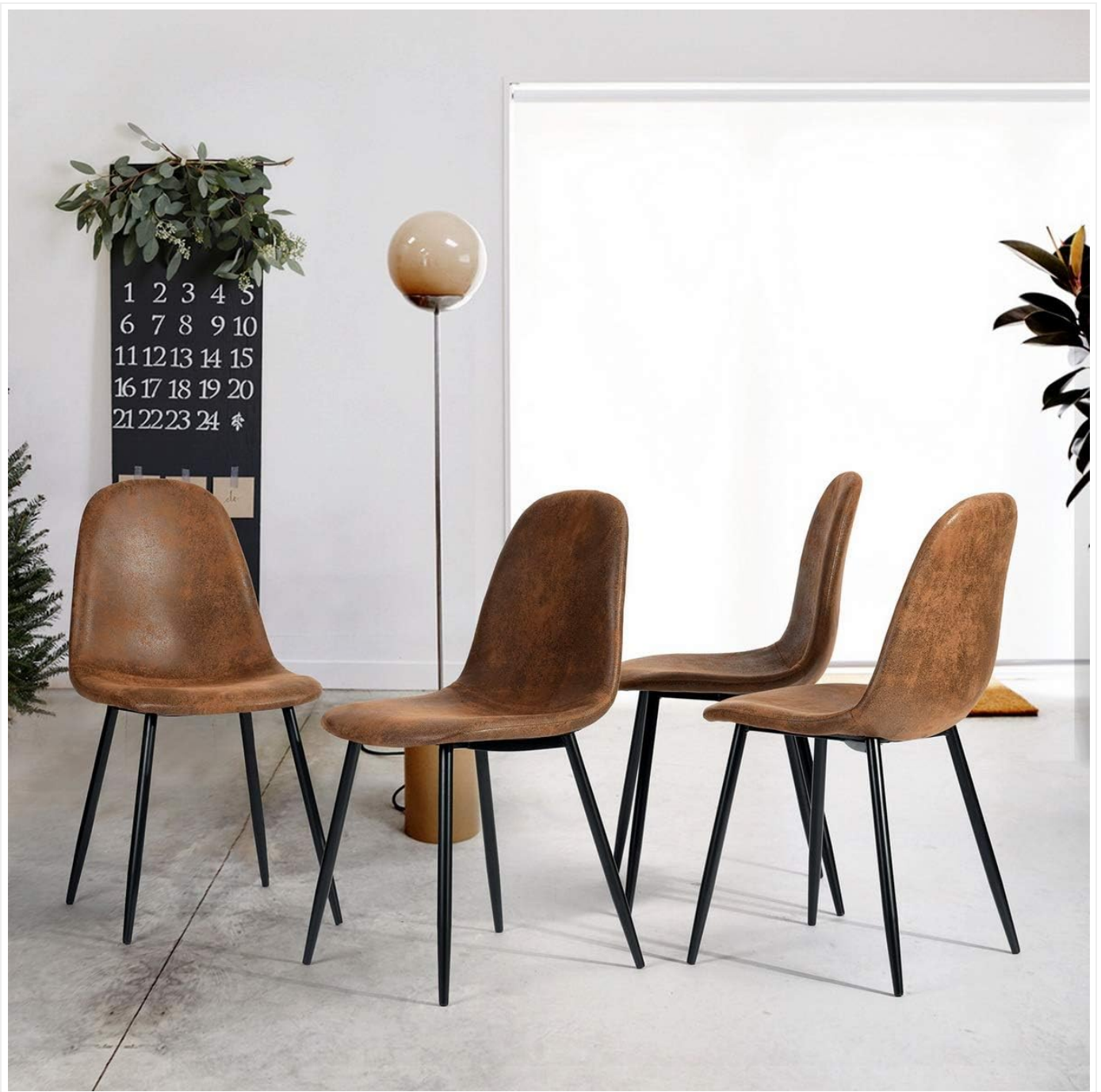
Figure 3: Homy Casa Dining Chairs in a dining setting.