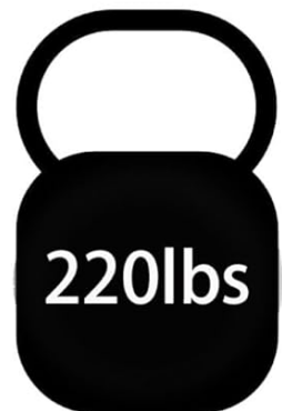
Figure 4: Ergonomic design and weight capacity details.

Your browser does not support the video tag.