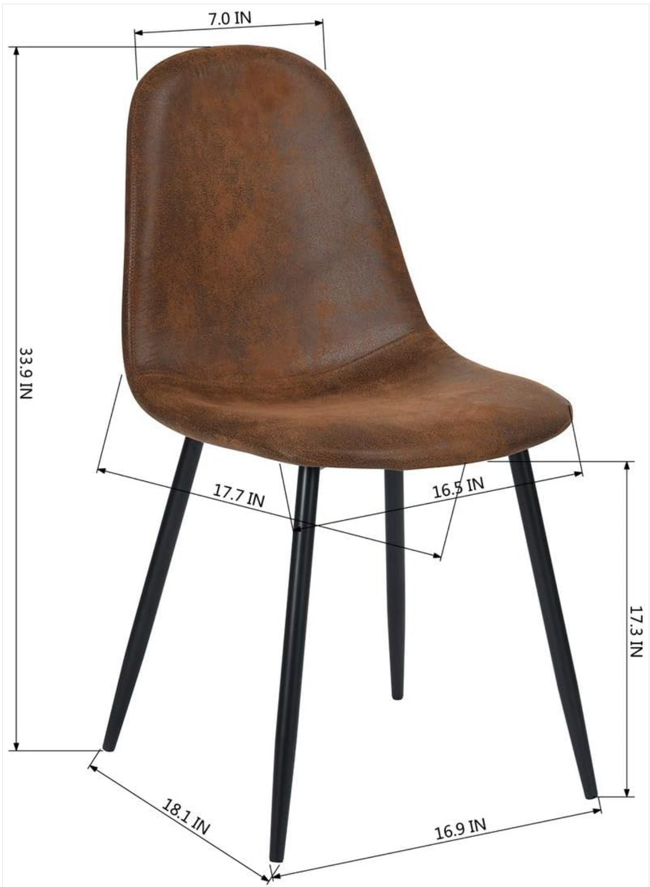
Figure 5: Detailed dimensions of the dining chair.