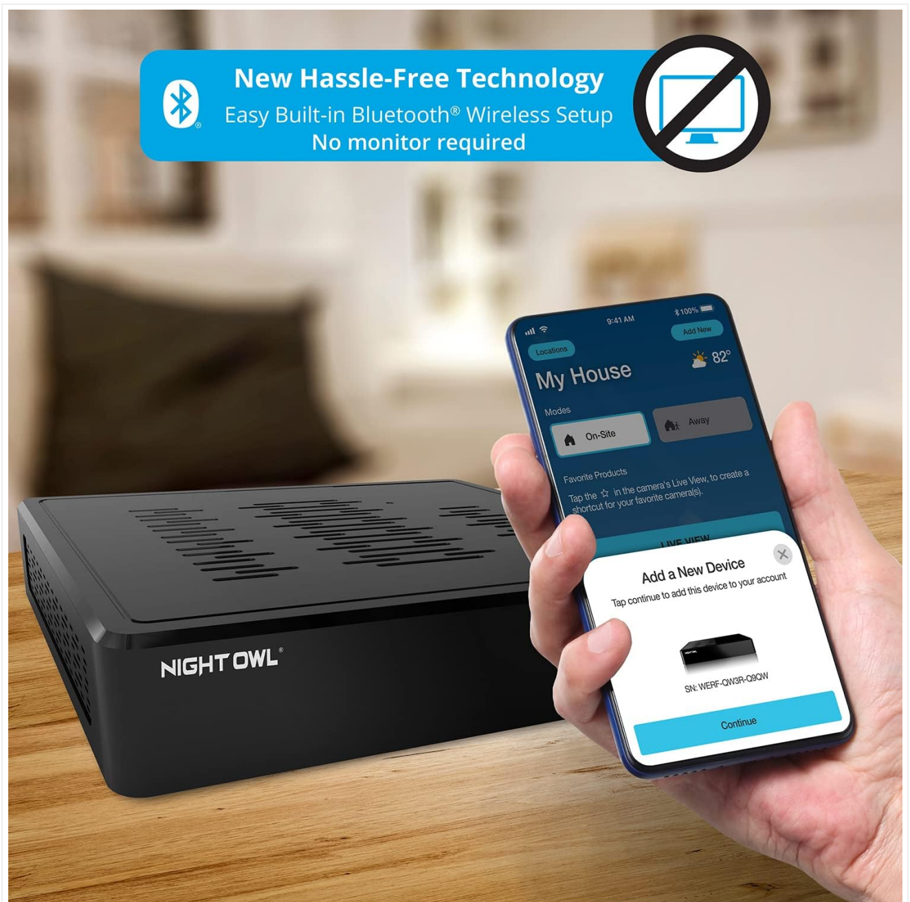
Image: A Night Owl NVR unit on a table with a hand holding a smartphone showing the Night Owl Protect app's device setup screen, highlighting the easy Bluetooth setup.

Follow the in-app instructions to pair your smart device with the NVR via Bluetooth and complete the initial system configuration.