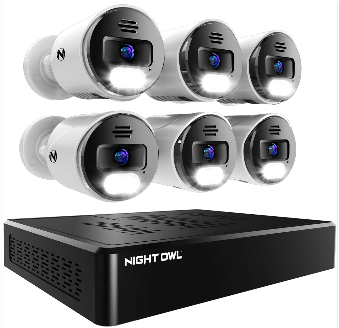
Image: Overview of the Night Owl 8 Channel Security System components, showing the NVR unit and six wired IP cameras.