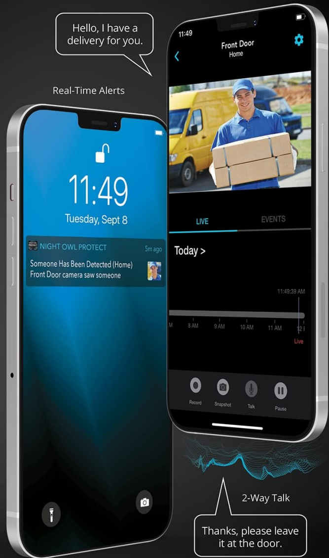
Image: Screenshots of the Night Owl Protect mobile app interface, demonstrating real-time alerts, live view, playback options, and sharing capabilities.