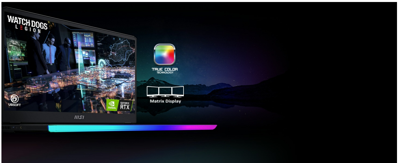
Image: The MSI Raider GE77HX laptop demonstrating its ability to connect to multiple external displays via Matrix Display technology.