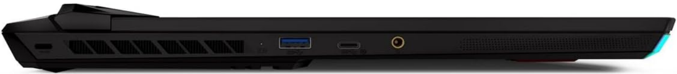
Image: Left side view of the MSI Raider GE77HX laptop, highlighting USB-A, USB-C, and audio jack ports.

Connect any external devices such as a mouse, keyboard, or external monitor to the available ports. The laptop features various ports including USB 3.2 Gen 1, USB 3.2 Gen 2, Thunderbolt 4, HDMI, and an SD card reader.