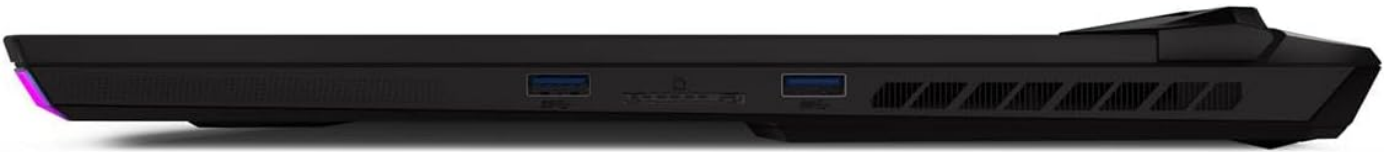
Image: Right side view of the MSI Raider GE77HX laptop, showing additional USB-A ports.