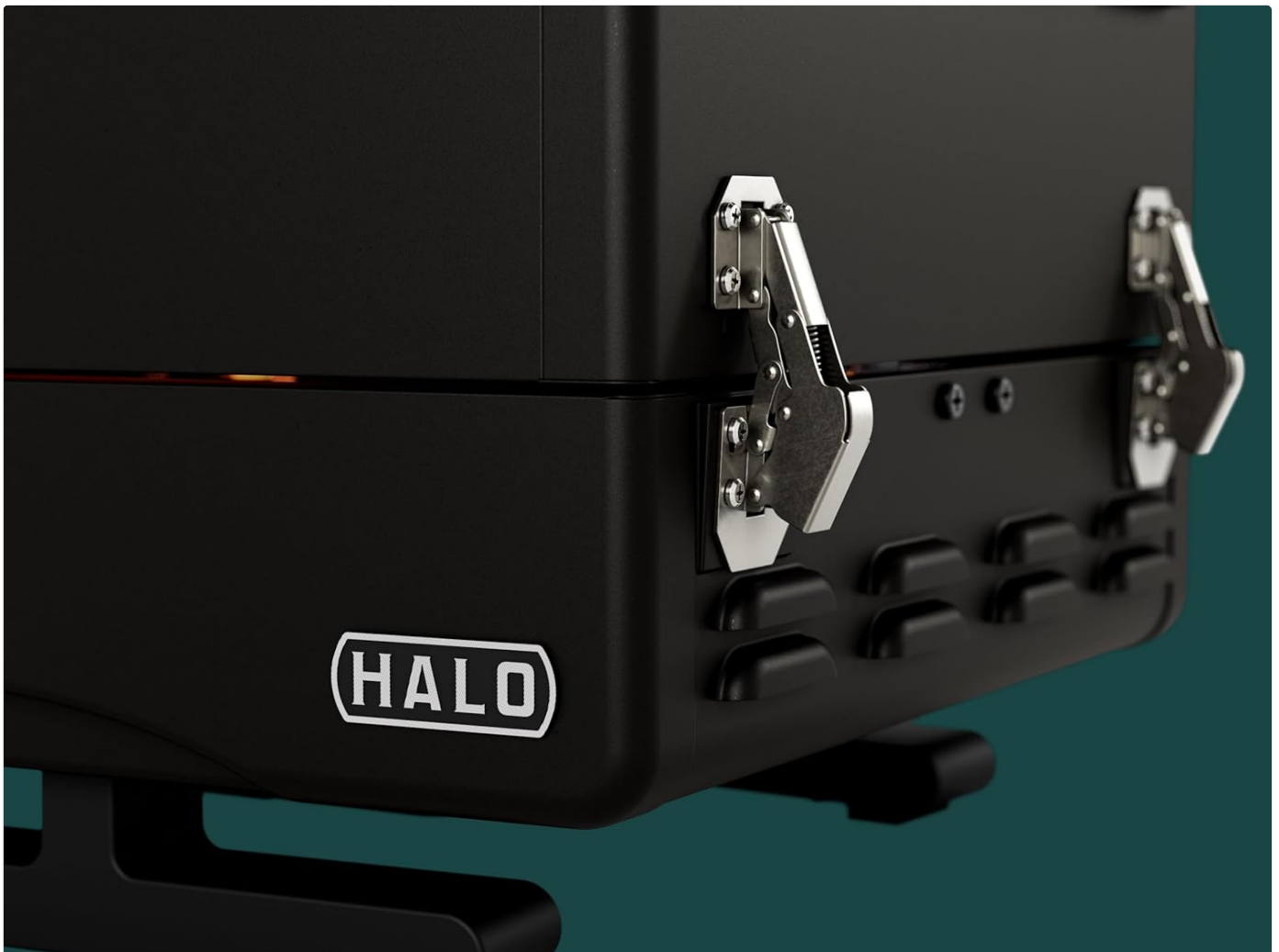
Image 2.1: Close-up of the side latch mechanism, indicating secure closure for portability and maintenance access.