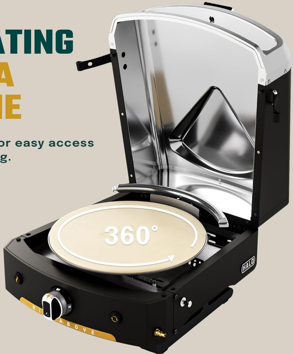
Image 3.2: The 16-inch rotating pizza stone with the hinged lid open, illustrating easy access for cleaning and pizza placement.

Hinged lid for easy access and cleaning.