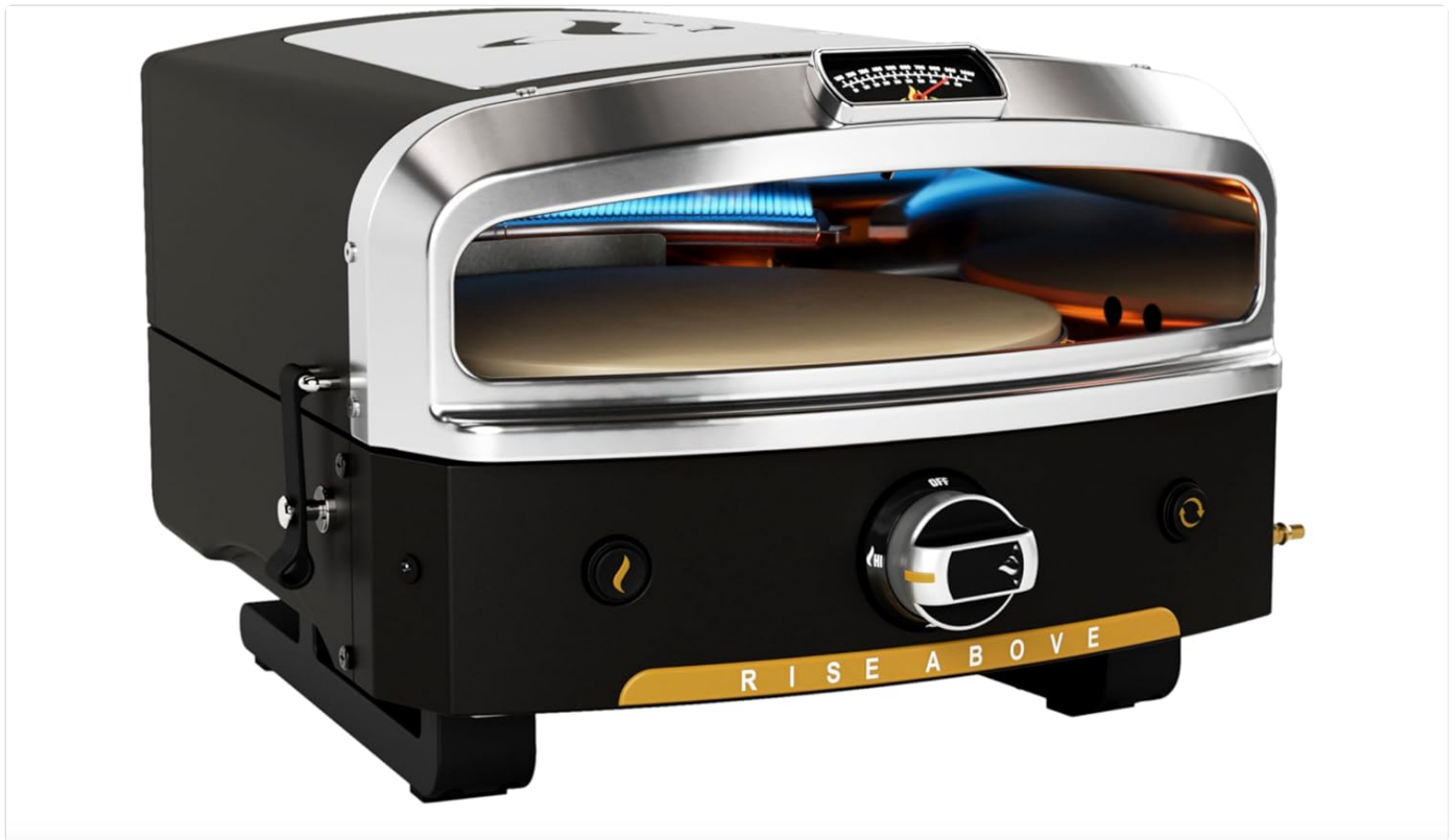
Image 1.1: The Halo Versa 16 Propane Gas Outdoor Pizza Oven, showcasing its compact design and front control knob.

The Halo Versa 16 is a portable propane gas outdoor pizza oven designed for cooking pizzas up to 16 inches in diameter. It features a rotating cooking stone and a dual burner system for consistent heat distribution.