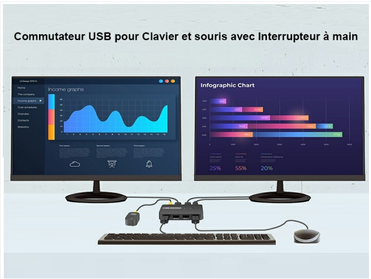
Image 5.1: Visual representation of switching methods: directly on the device and via the external remote control.