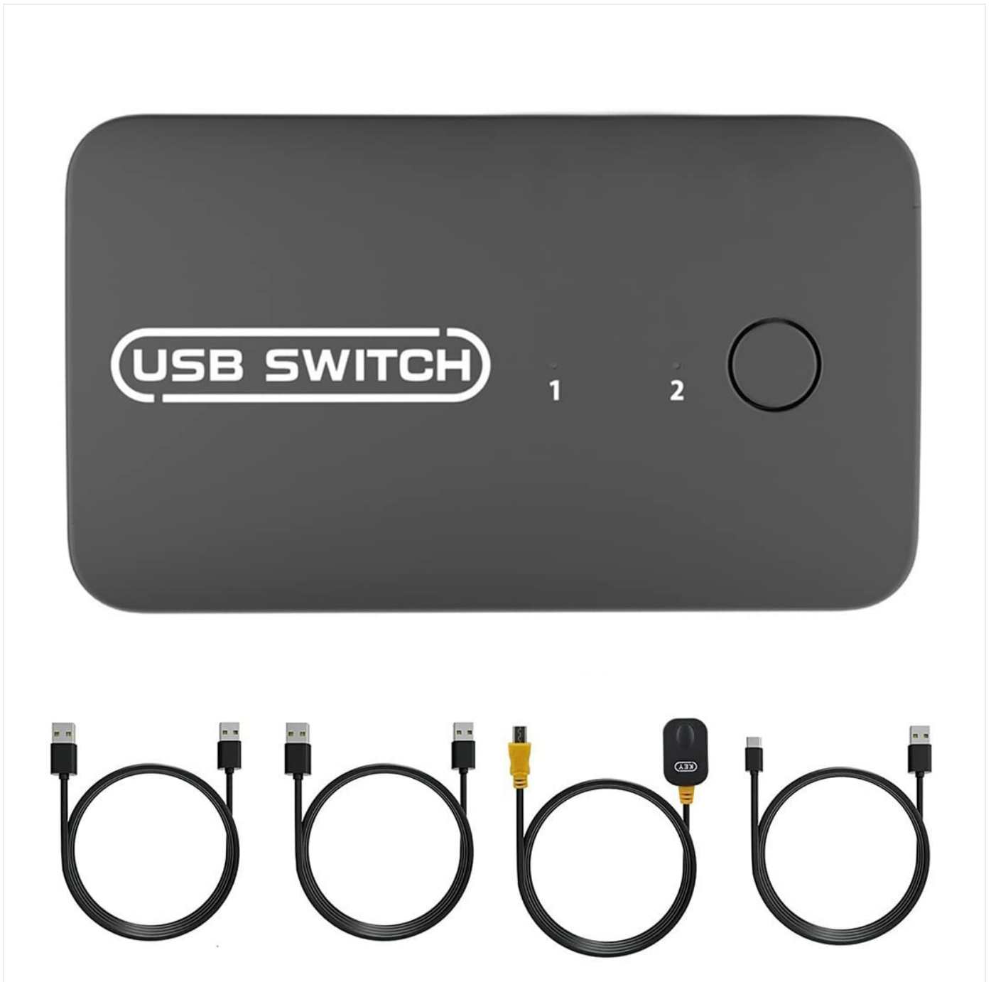
Image 2.1: The eppfun FJ-U204 USB KVM Switch shown with its included USB-A to USB-B cables and the external remote switch button.