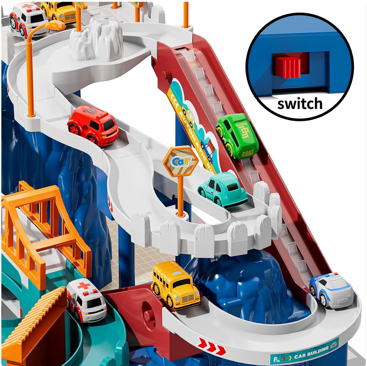
Figure 5.1: Location of the power switch for the automatic elevator.