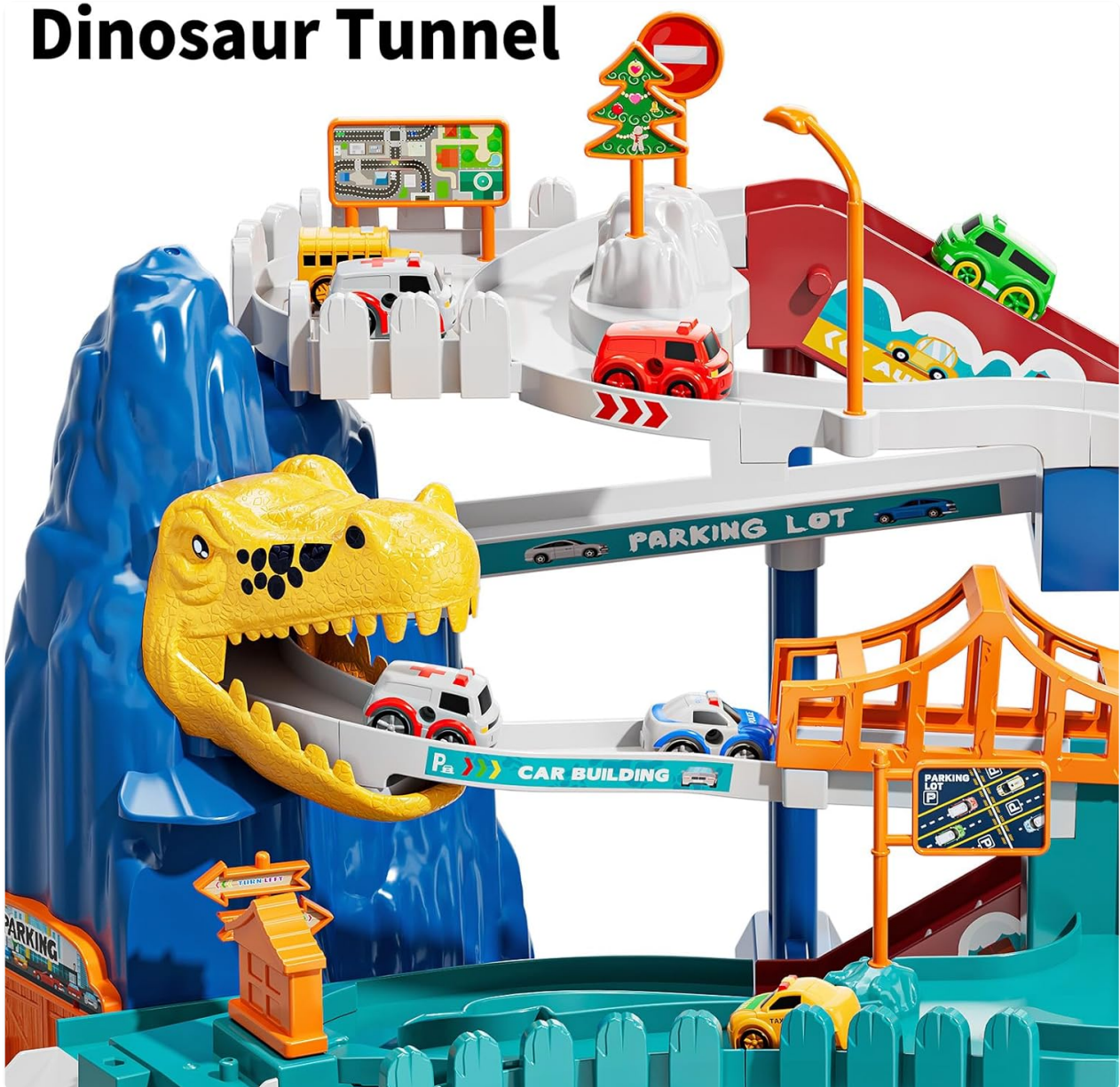
Figure 5.3: Cars passing through the Dinosaur Tunnel.