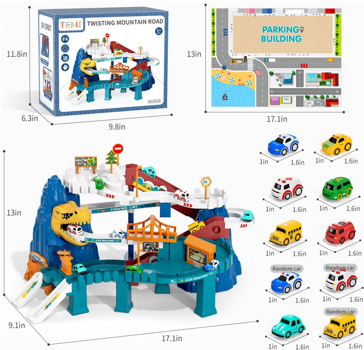
Figure 2.1: Overview of included components and their approximate dimensions.