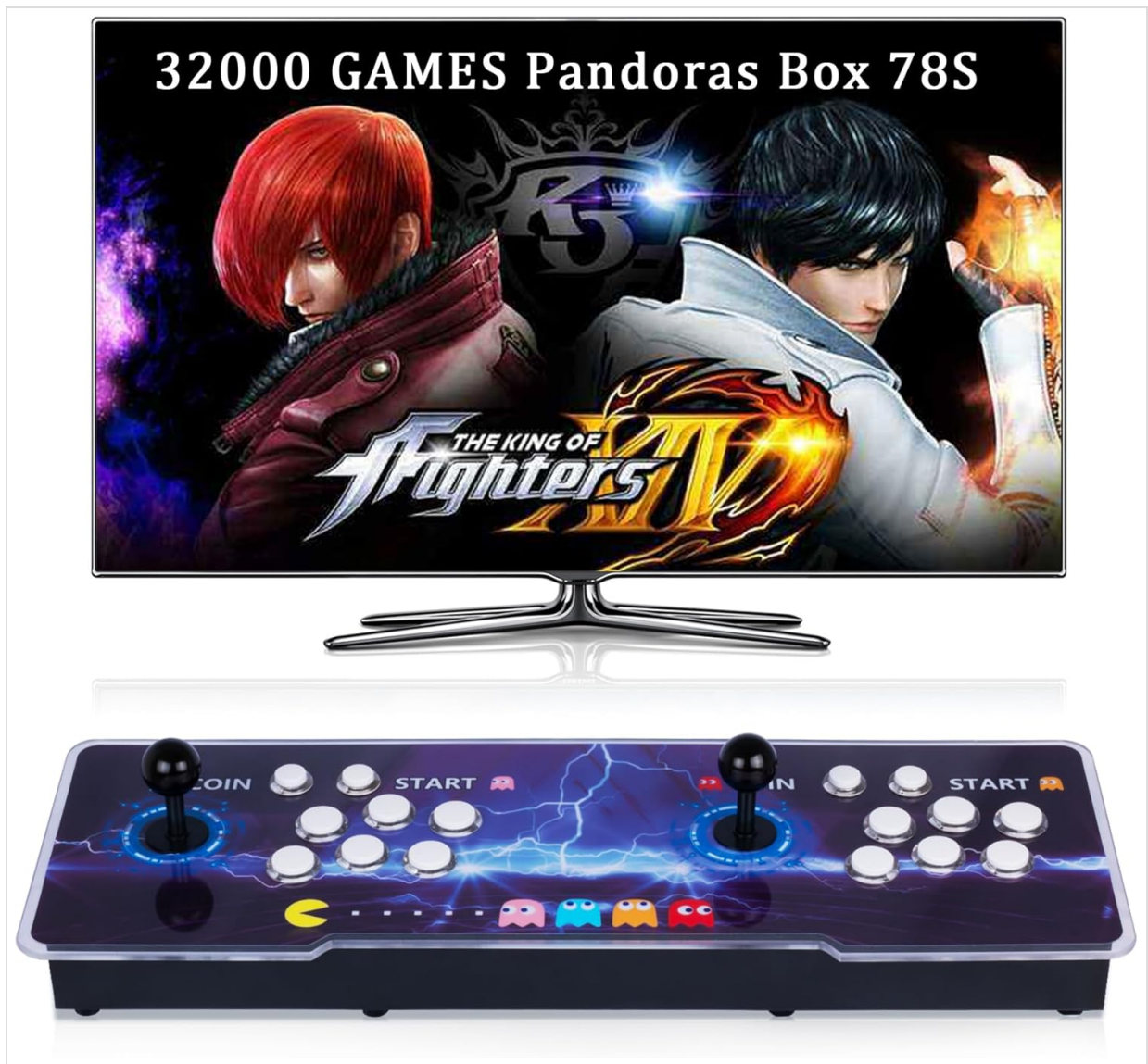
Image: The RegiisJoy Pandora's Box 78S console with two joysticks and multiple buttons, connected to a television displaying a game selection screen.