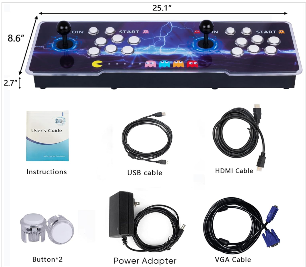
Image: All components included in the package, laid out on a surface. This includes the main console, USB cable, HDMI cable, power adapter, VGA cable, user's guide, and two spare buttons.