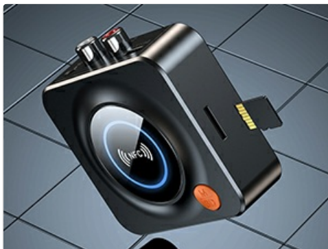
Figure 5.2: Close-up view of the eppfun receiver showing the TF card slot with a TF card inserted.