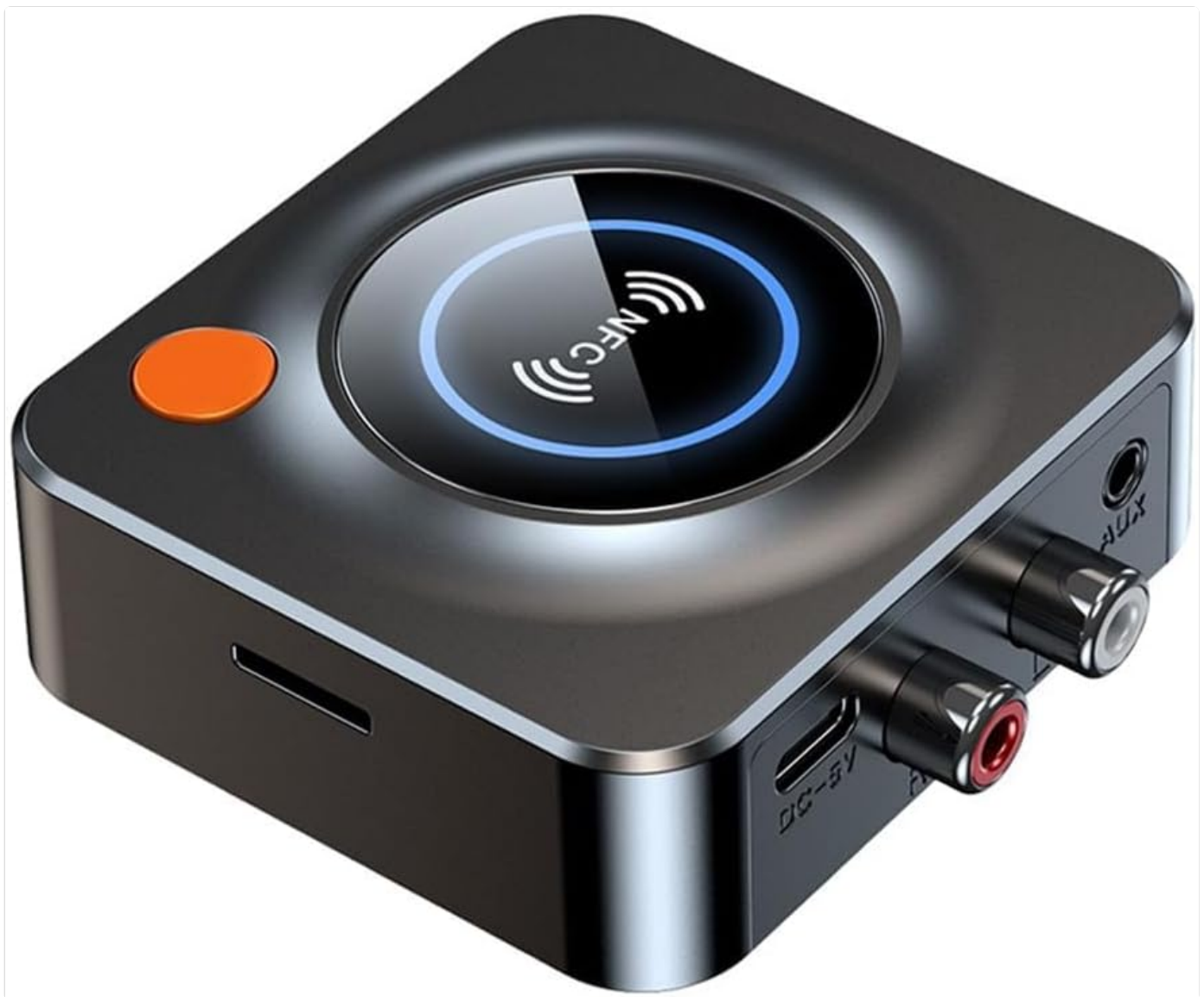
Figure 1.1: Front view of the eppfun Bluetooth 5.3 Receiver, highlighting the NFC area and control button.