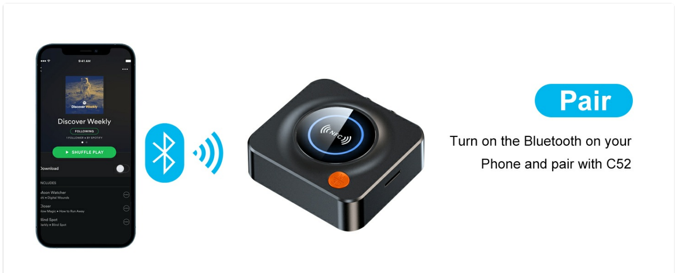
Figure 5.1: Diagram illustrating how the Bluetooth receiver enables wireless audio streaming from a phone to speakers.