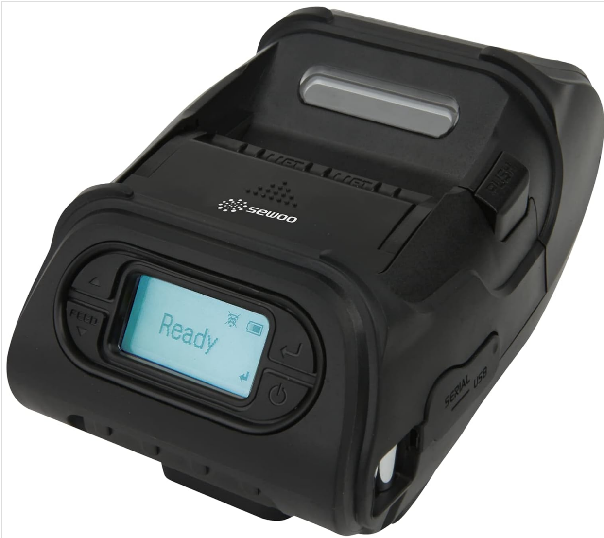
Figure 1.1: SEWOO LK-P12II Printer Overview

This image shows the SEWOO LK-P12II printer from a slightly elevated angle, highlighting its compact and rugged design. The display screen shows "Ready" and various icons, indicating its operational status. The top cover for media loading is visible, along with the "PUSH" button for opening it. The side features "SERIAL" and "USB" ports, indicating connectivity options.