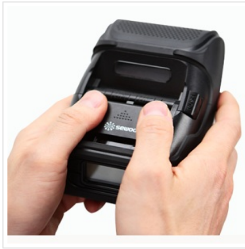
Figure 3.1: Control Panel and Buttons

This diagram illustrates the front control panel of the SEWOO LK-P12II printer. It clearly labels the "FEED" button, "Up Button", "Enter Button", and "Power Button" surrounding the display screen. The display shows "Ready" and battery/connectivity indicators.