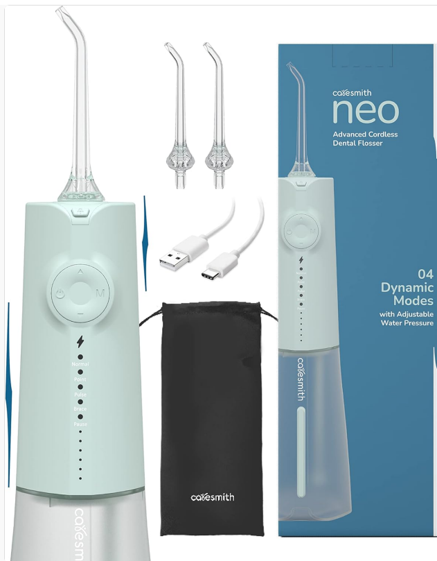
Image 1.1: The CARESMITH Neo Water Flosser, showing the main unit, two jet tips, a USB-C charging cable, and a travel pouch.