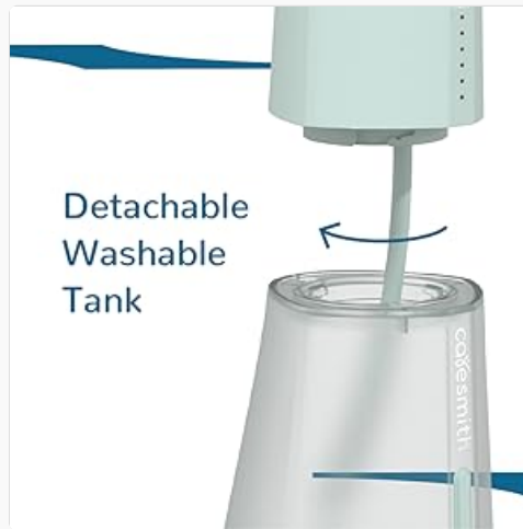
Image 7.1: The detachable and washable water tank, designed for easy cleaning and hygiene.