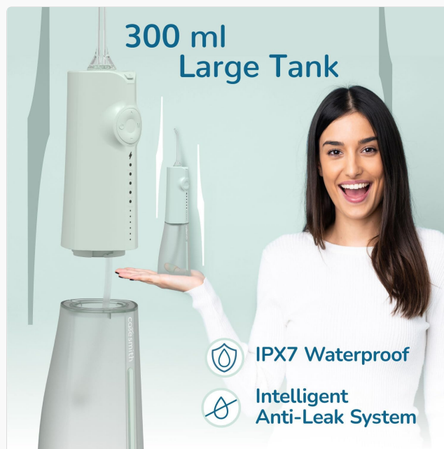
Image 5.2: The CARESMITH Neo Water Flosser demonstrating its large 300 ml detachable water tank and IPX7 waterproof design.