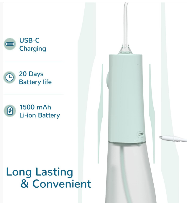
Image 5.1: The CARESMITH Neo Water Flosser highlighting its USB-C charging capability and long battery life.