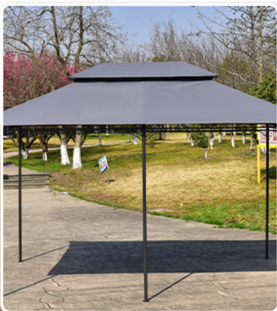
Retirer Le Rideau en Filet