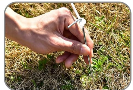
Image Description: This image illustrates key structural components. It highlights the reinforced support tubes for the canopy, the robust steel frame providing overall stability, footpads designed for ground staking, and wind ropes used to further secure the gazebo against wind.

► Cordes à Vent pour Une Stabilité Élevée