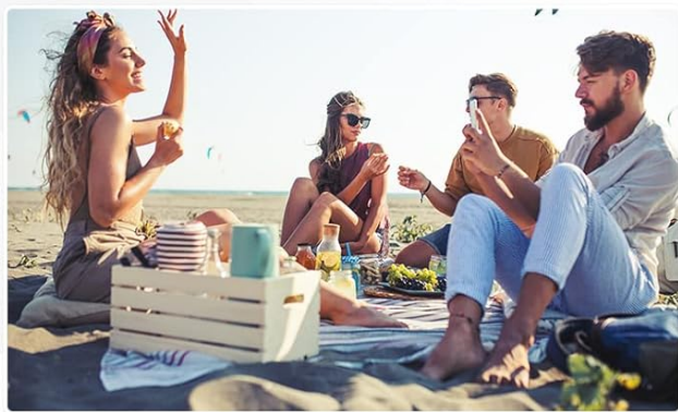
Réunion en Plein Air