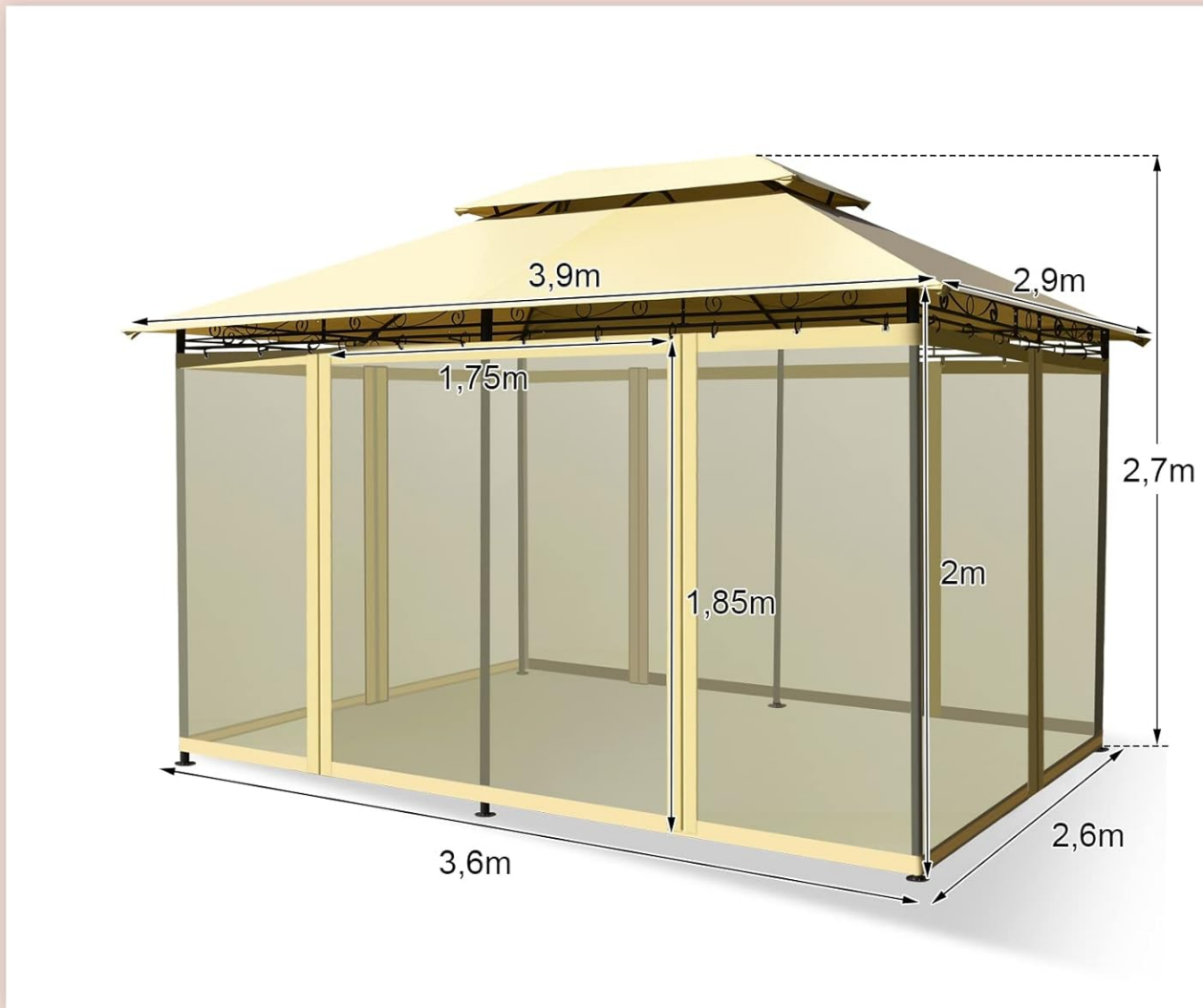
Image Description: This diagram provides a clear visual representation of the gazebo's overall dimensions, indicating a length of 3.9 meters, a width of 2.9 meters, and a height of 2.7 meters. It also includes internal measurements for reference.