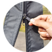
Fermeture Eclair Lisse