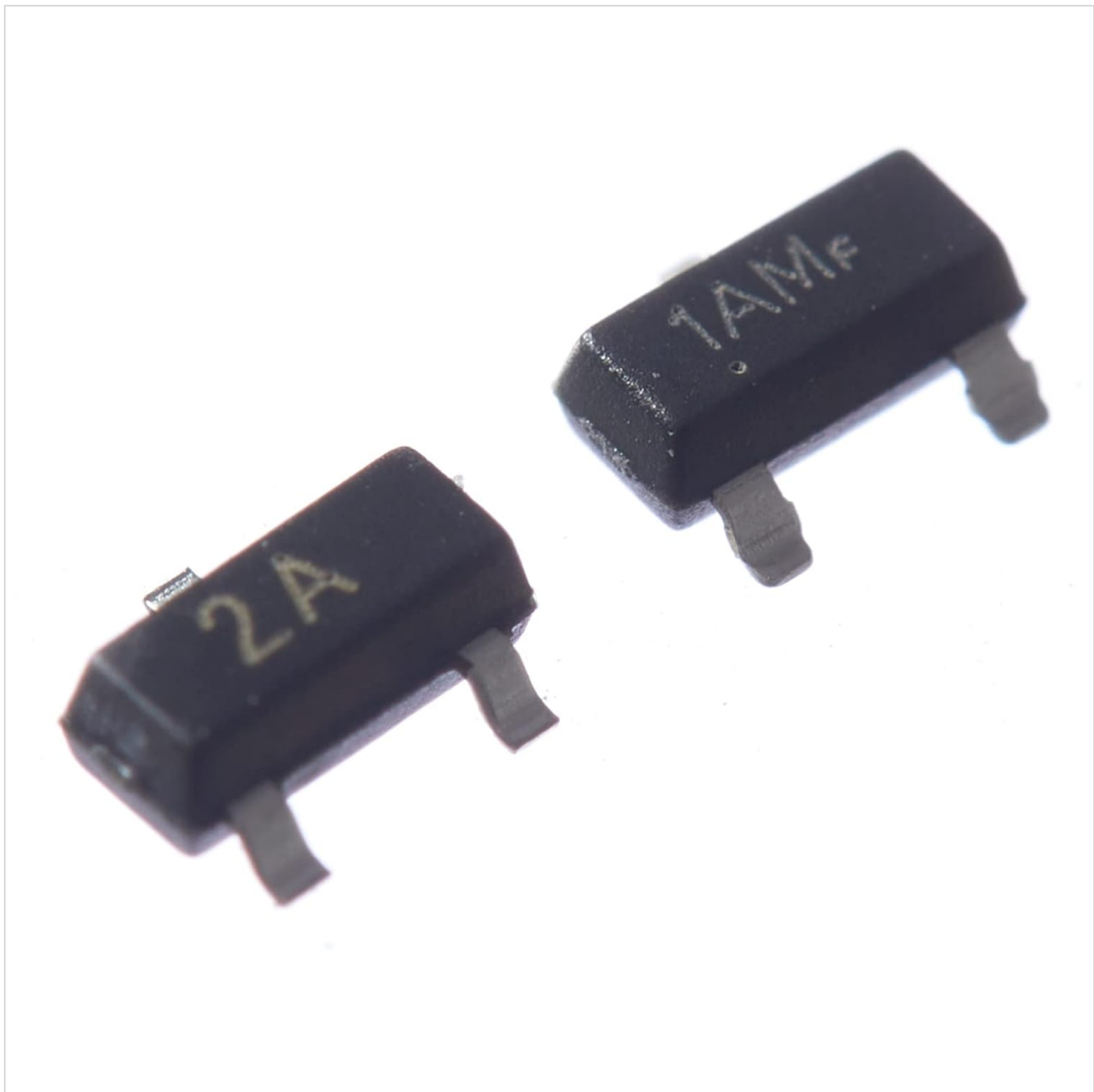
Figure 3: Close-up view of MMBT3904 (marked '1AM') and MMBT3906 (marked '2A') transistors, showing their distinct package markings for identification. This image provides a clearer view of the text printed on the top surface of each transistor.