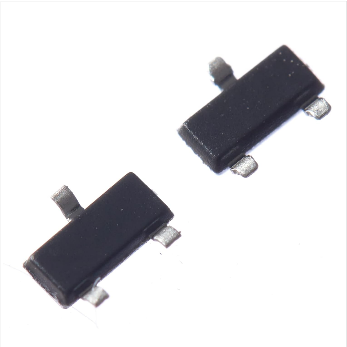
Figure 2: Bottom view of MMBT3904 and MMBT3906 SOT-23 transistors, showing the solder pads. The image displays the underside of the two transistors, highlighting the three metallic pads designed for surface mounting onto a circuit board.