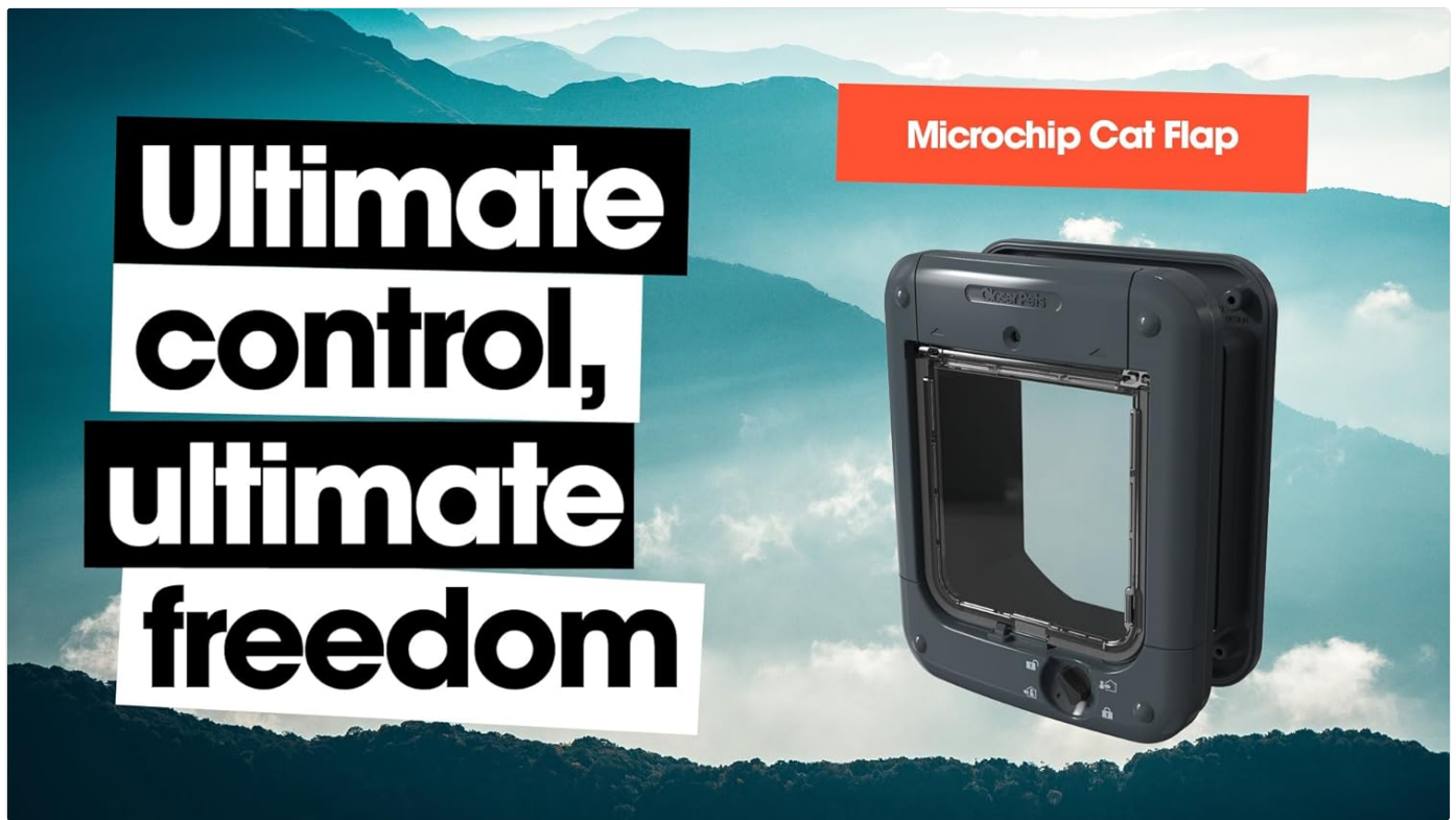
Figure 3: Detailed view of the 4-way rotary lock. This image highlights the manual control knob and the icons indicating the four lock settings: Unlocked, In Only, Out Only, and Locked.