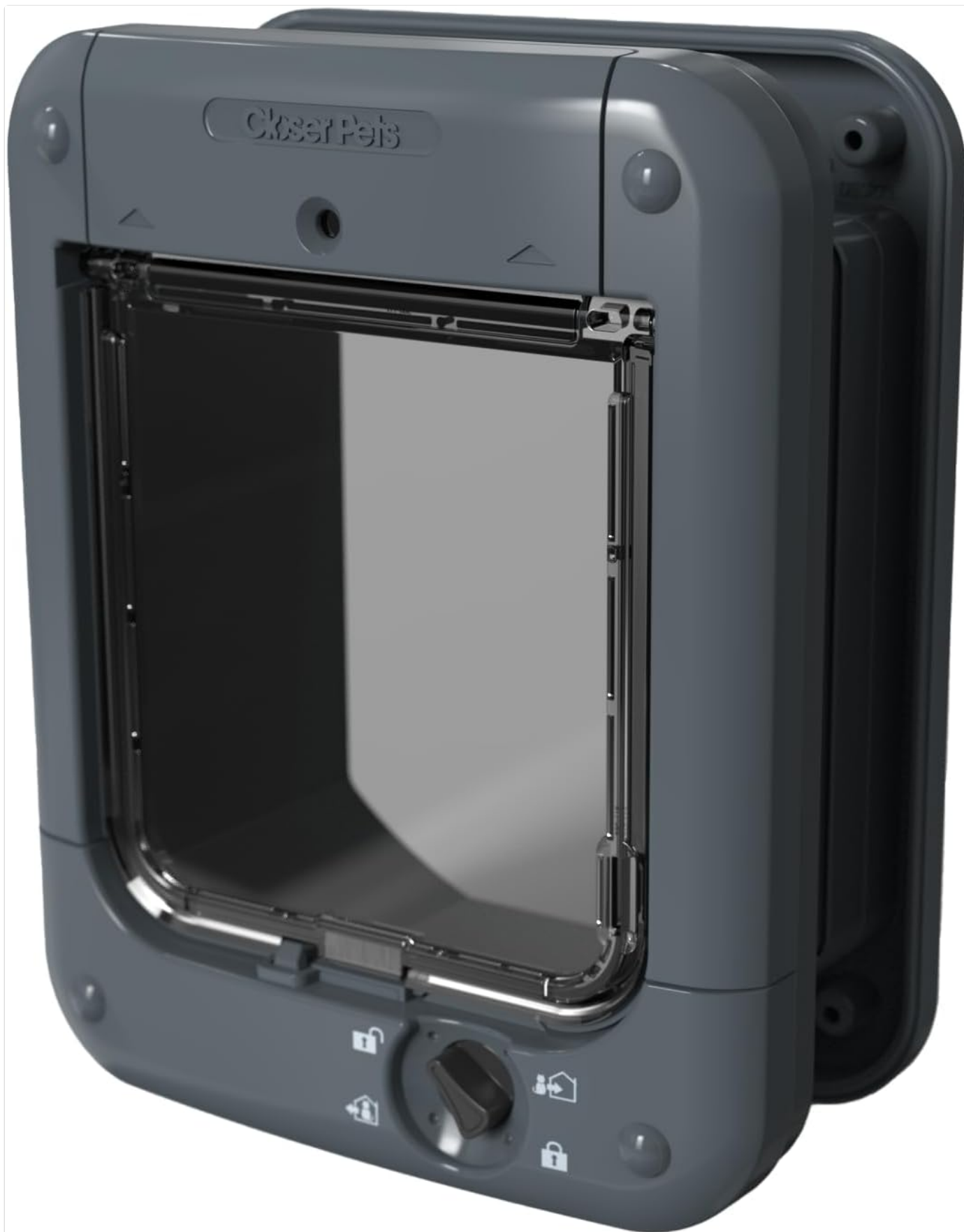
Figure 1: Front view of the Closer Pets Microchip Activated Cat Door. This image displays the main unit in its gray color, highlighting the clear flap and the control knob at the bottom.

The Closer Pets Microchip Activated Cat Door is constructed from super-tough polymer, ensuring durability. It features a clear flap for visibility and a rotary 4-way lock for manual control.