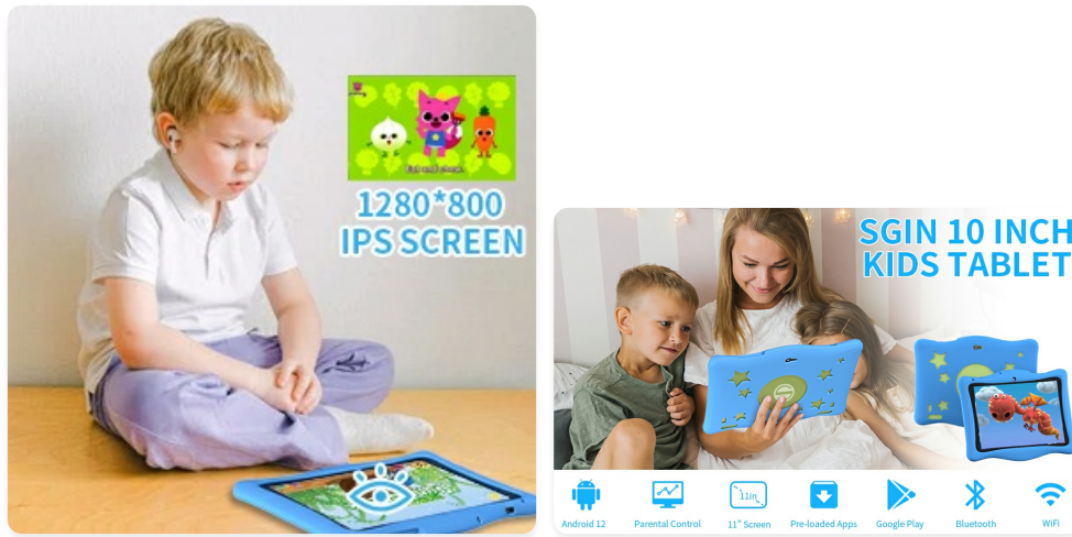
Image 4.1: The tablet's cameras allow for capturing moments and engaging in video calls.