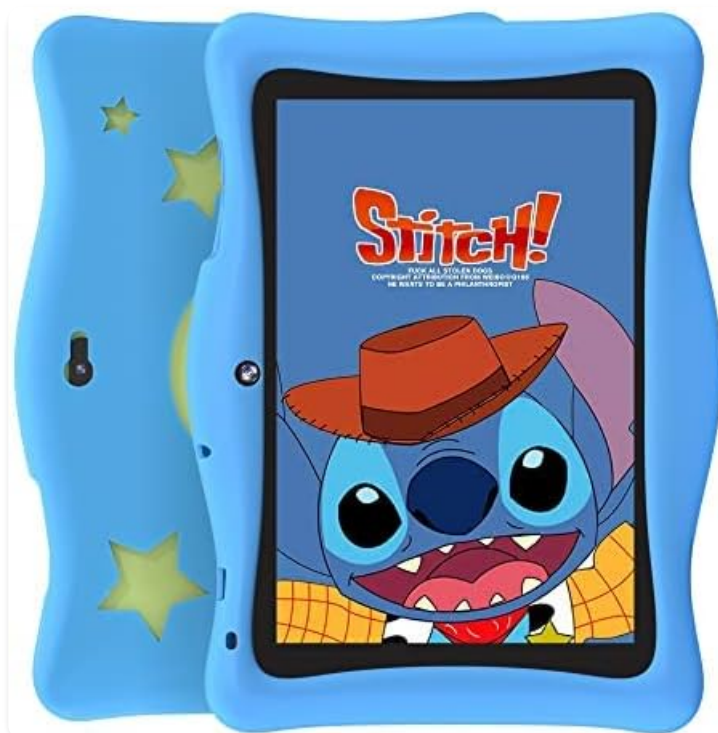
Image 2.1: Front view of the SGIN Kids Tablet 10-inch in its blue protective case.

The SGIN Kids Tablet is a high-performance device equipped with a 10.1-inch IPS display, 2GB RAM, and 32GB ROM, expandable via a TF card. It features dual cameras (2MP front, 5MP rear), Wi-Fi, GPS, Bluetooth, FM radio, and dual speakers. The tablet is housed in a protective, kid-friendly case.