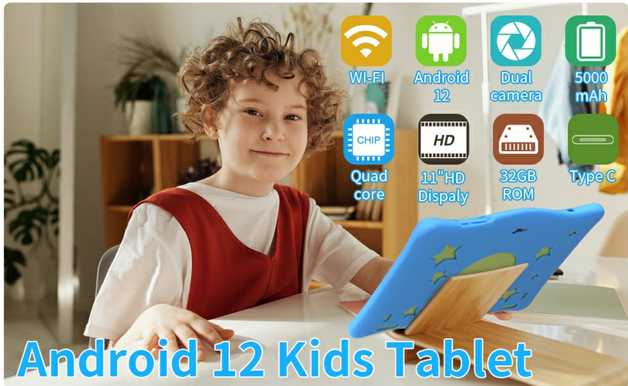
Image 2.2: Visual representation of the tablet's core features and specifications.