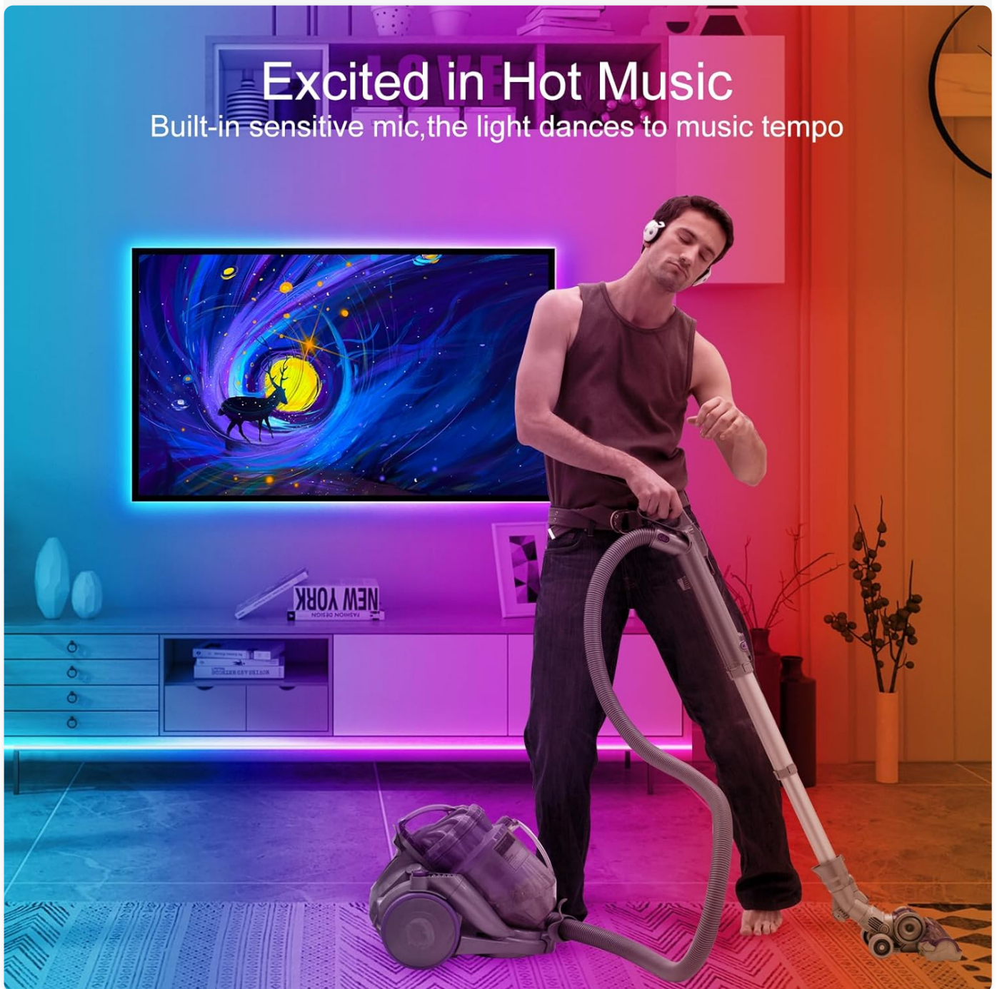
Figure 5: Music Sync Feature. This image demonstrates the music sync capability of the LED lights, showing them changing colors in response to sound, enhancing the ambiance of a room.