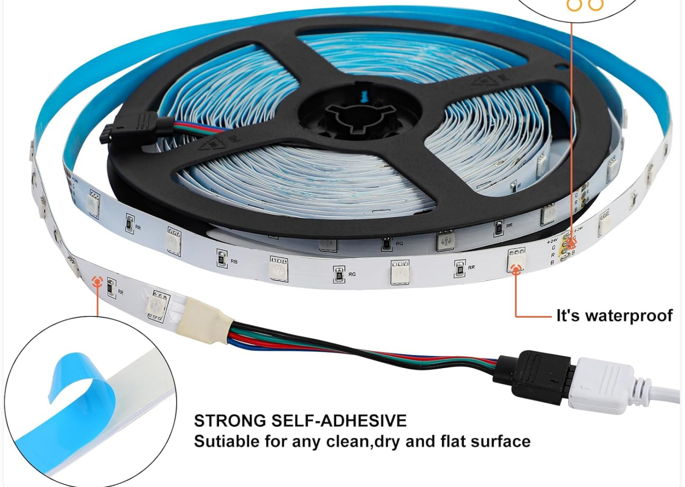
Figure 2: Waterproof Design and Self-Adhesive. This image highlights the IP65 waterproof rating of the LED strip and demonstrates the strong self-adhesive backing, which should be peeled off before application to a clean, dry, and flat surface.