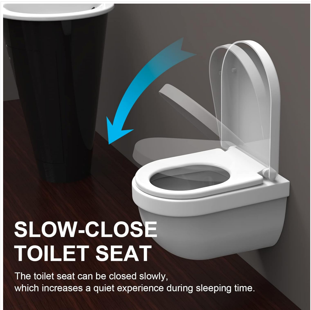
Image 6.1: Demonstration of the slow-close feature, where the toilet seat closes gently and quietly.