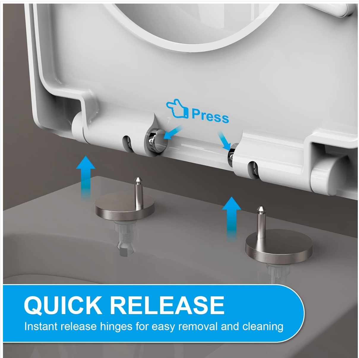
Image 5.1: Detail of the quick-release mechanism and mounting posts, illustrating how the seat attaches and detaches.