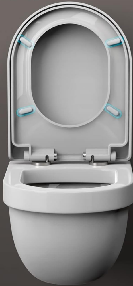
Image 5.2: Illustration of the four bumpers on the underside of the seat, which increase friction and prevent slippage.