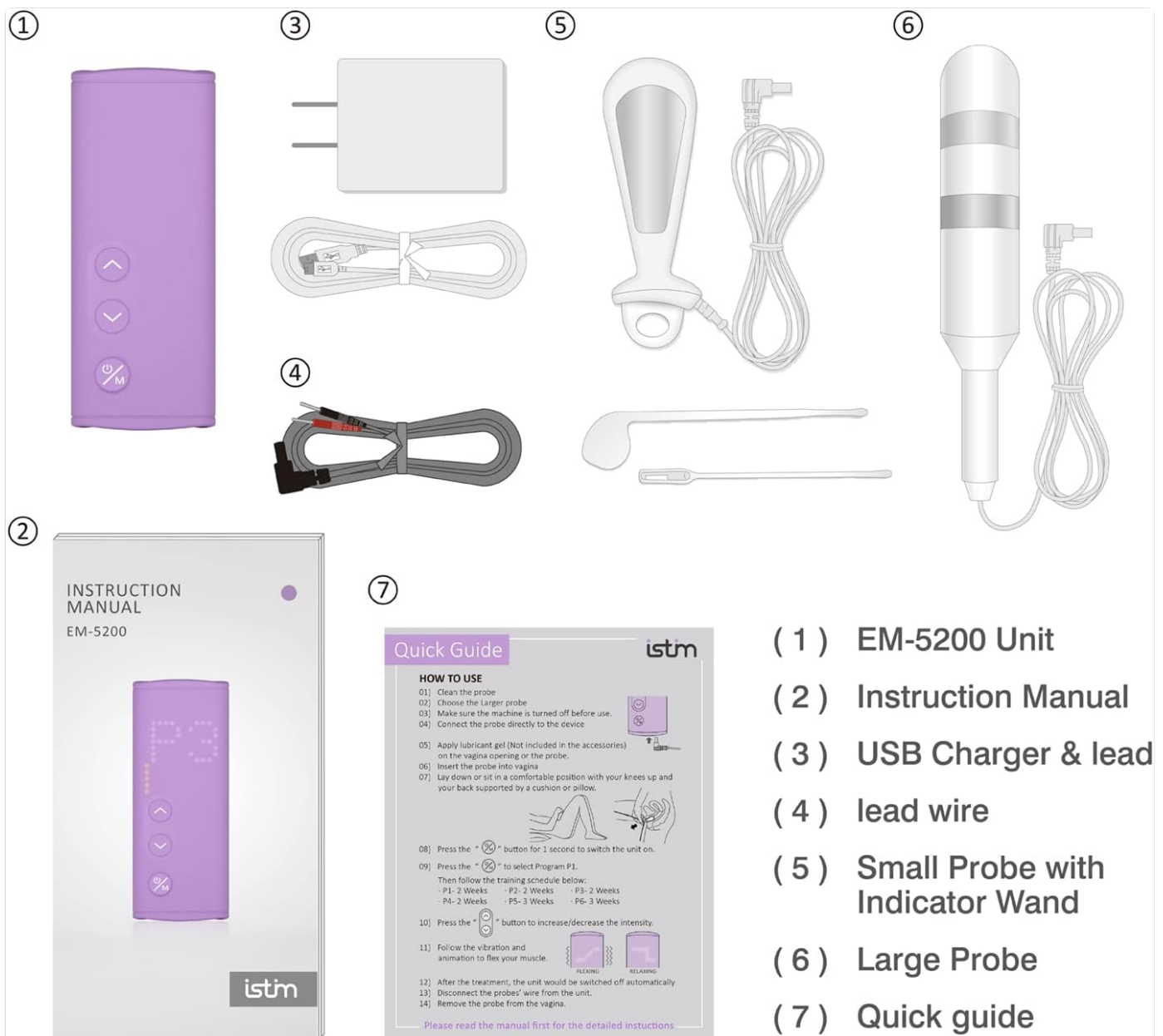
Figure 3.1: Complete package contents of the iStim EM-5200 Pelvic Floor Exerciser.