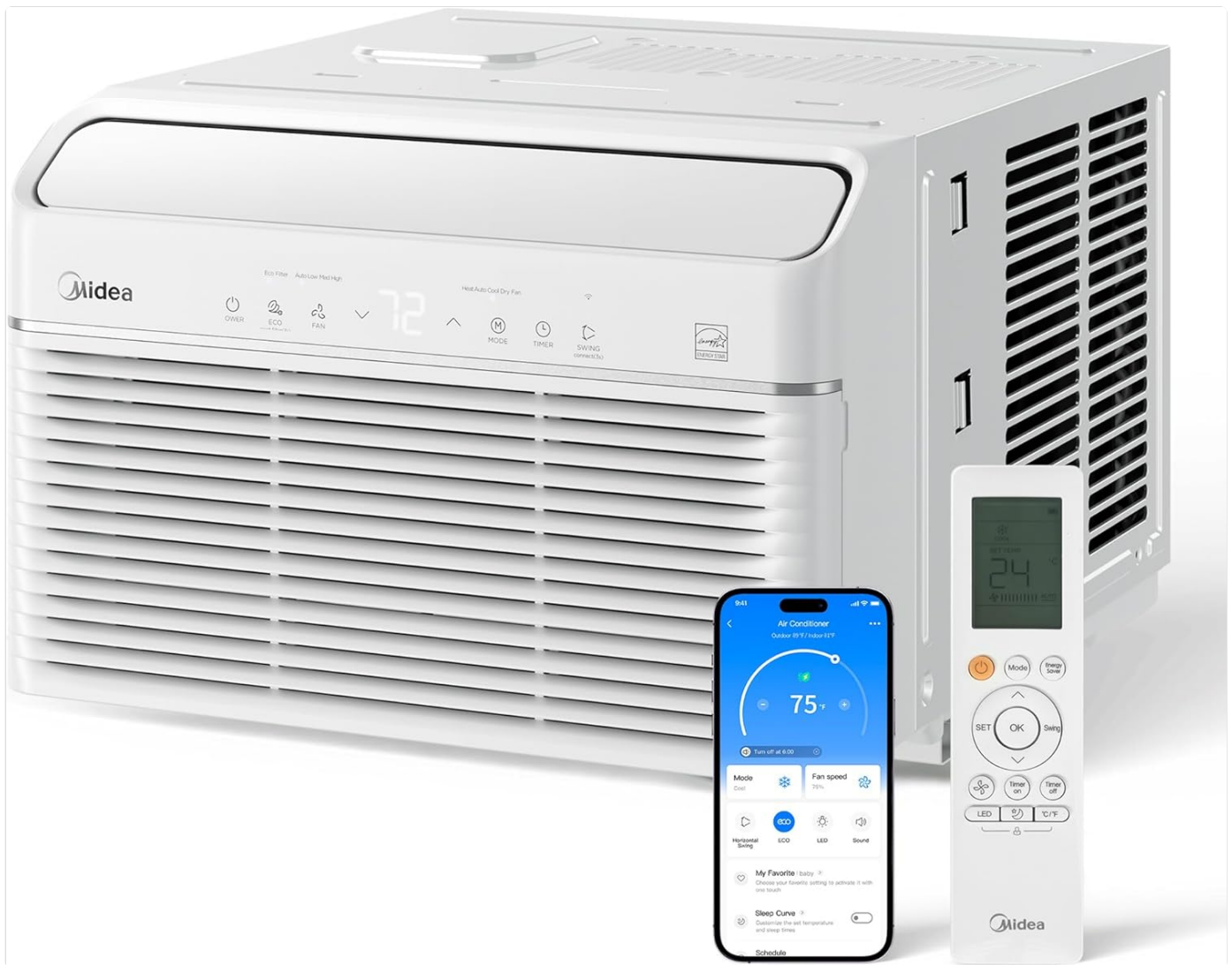
Image: The Midea 12,000 BTU Smart Inverter Air Conditioner unit, shown with its remote control and a smartphone displaying the MSmartHome app interface.

This unit integrates advanced inverter technology for energy efficiency, reducing electricity consumption by up to 35% compared to standard units. It operates at a low noise level, ensuring a peaceful environment.