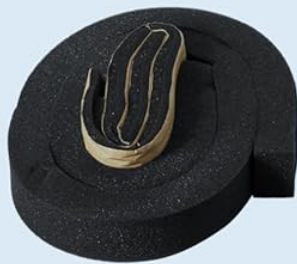
Window Sash Seal Foam