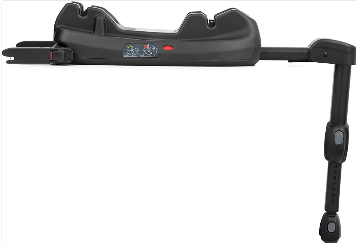
Image: Side view of the Joie i-Base LX 2, illustrating the ISOFIX arms extended from the base, ready for attachment to vehicle anchors.