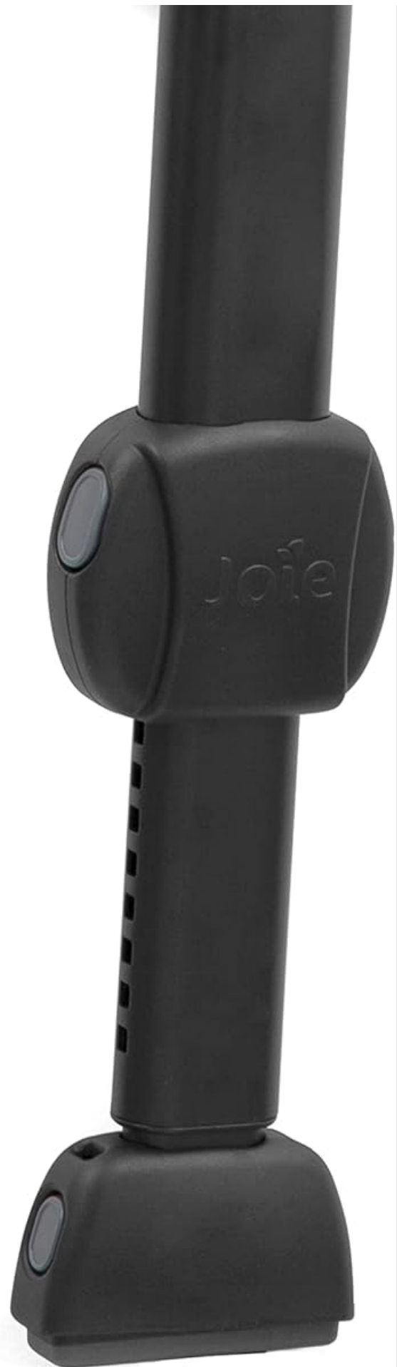
Image: Close-up view of the Joie i-Base LX 2 support leg, highlighting the adjustment buttons and the Joie branding.