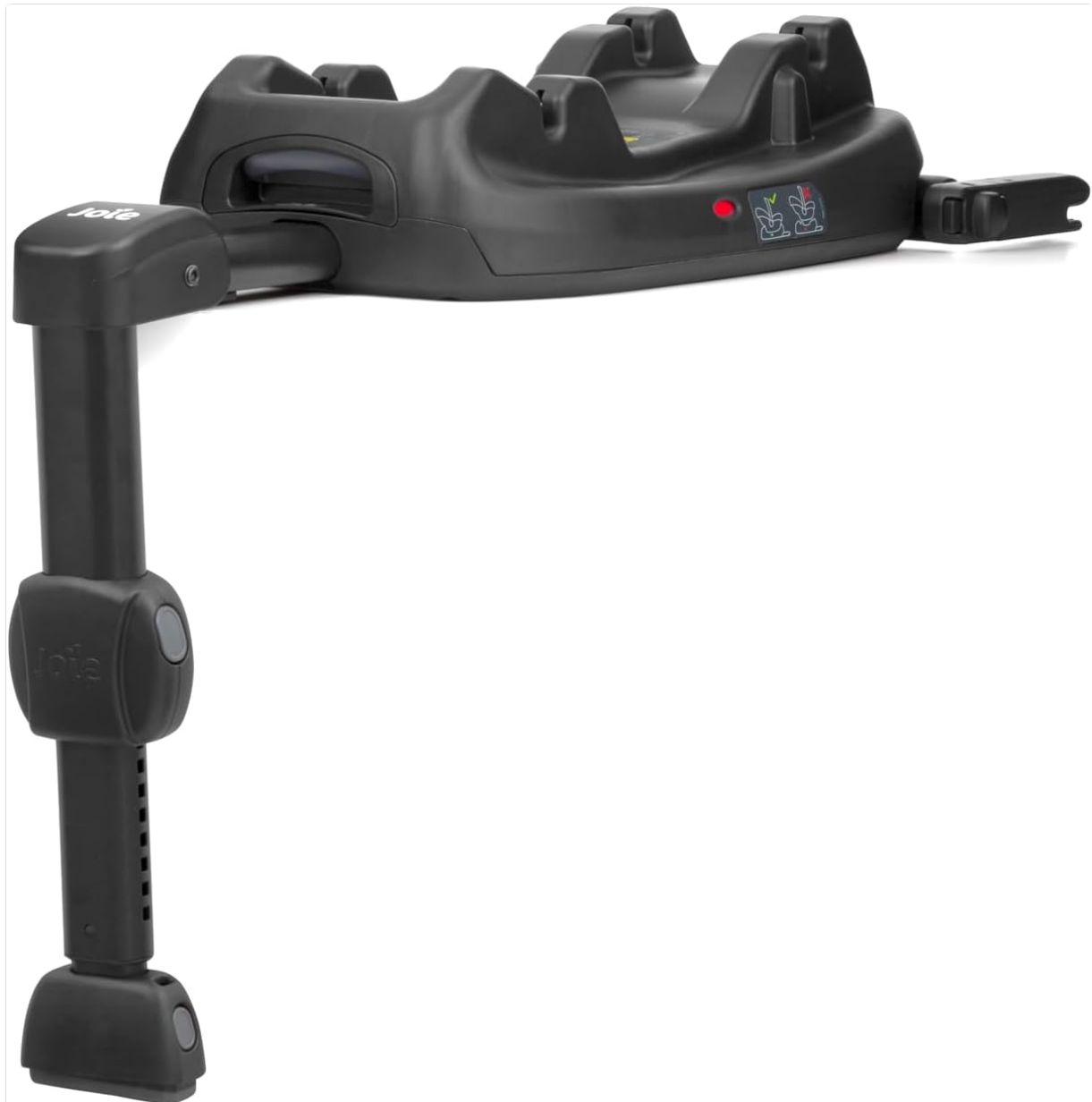
Image: Partial view of the Joie i-Base LX 2, focusing on the area where depth adjustments can be made, indicated by a red button and green checkmark for correct installation.

The i-Base LX 2 offers 7 adjustable depth levels to optimize the fit in your vehicle and provide comfortable recline for the car seat. Adjust the depth by using the designated mechanism on the base.